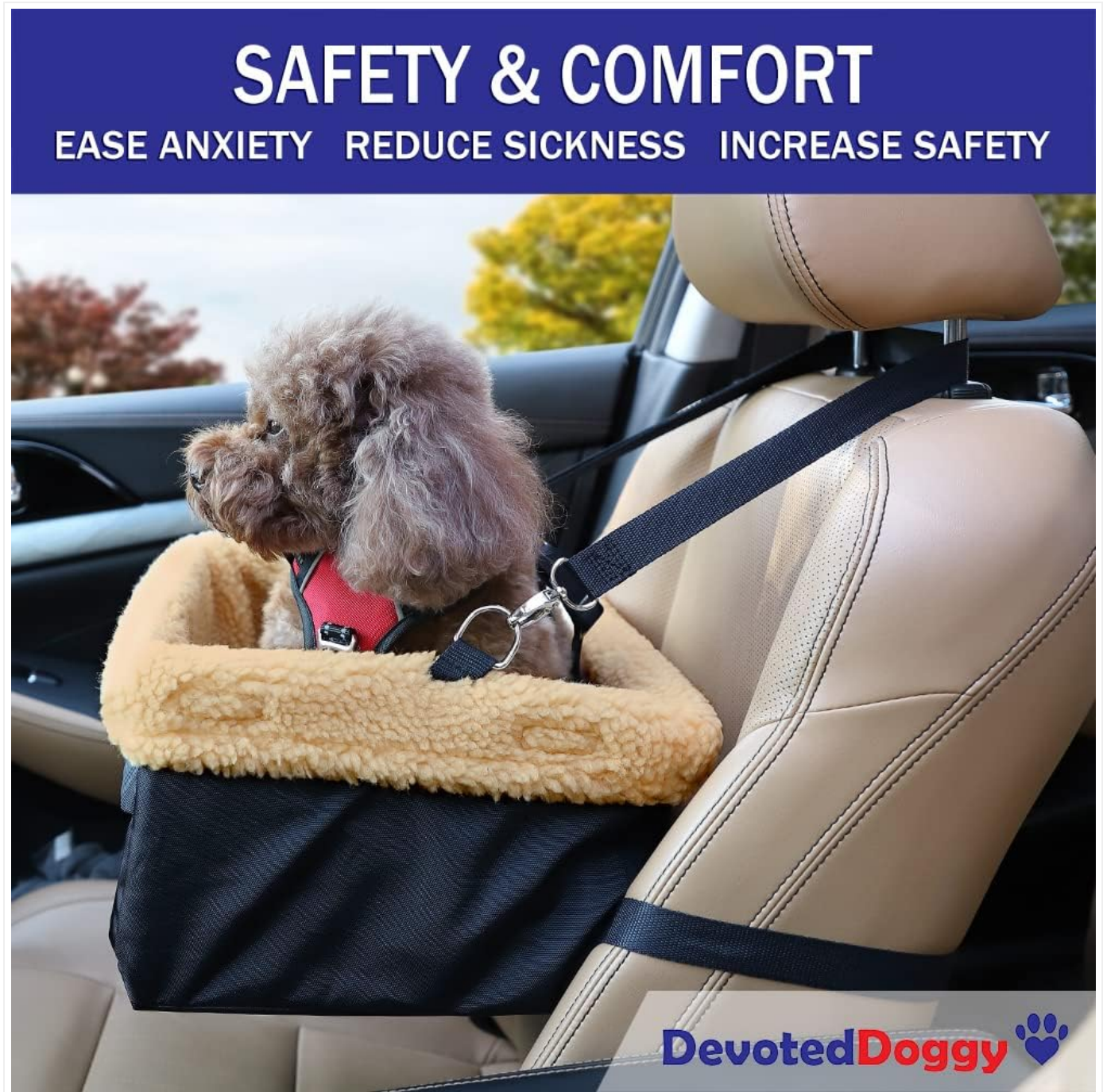
Figure 3: Properly installed car seat with a pet secured, ensuring safety and comfort.

Video 1: Demonstration of the quick and easy installation process for the Devoted Doggy Deluxe Dog Car Seat, showing how to secure it to a car seat using adjustable straps and buckle the pet inside.