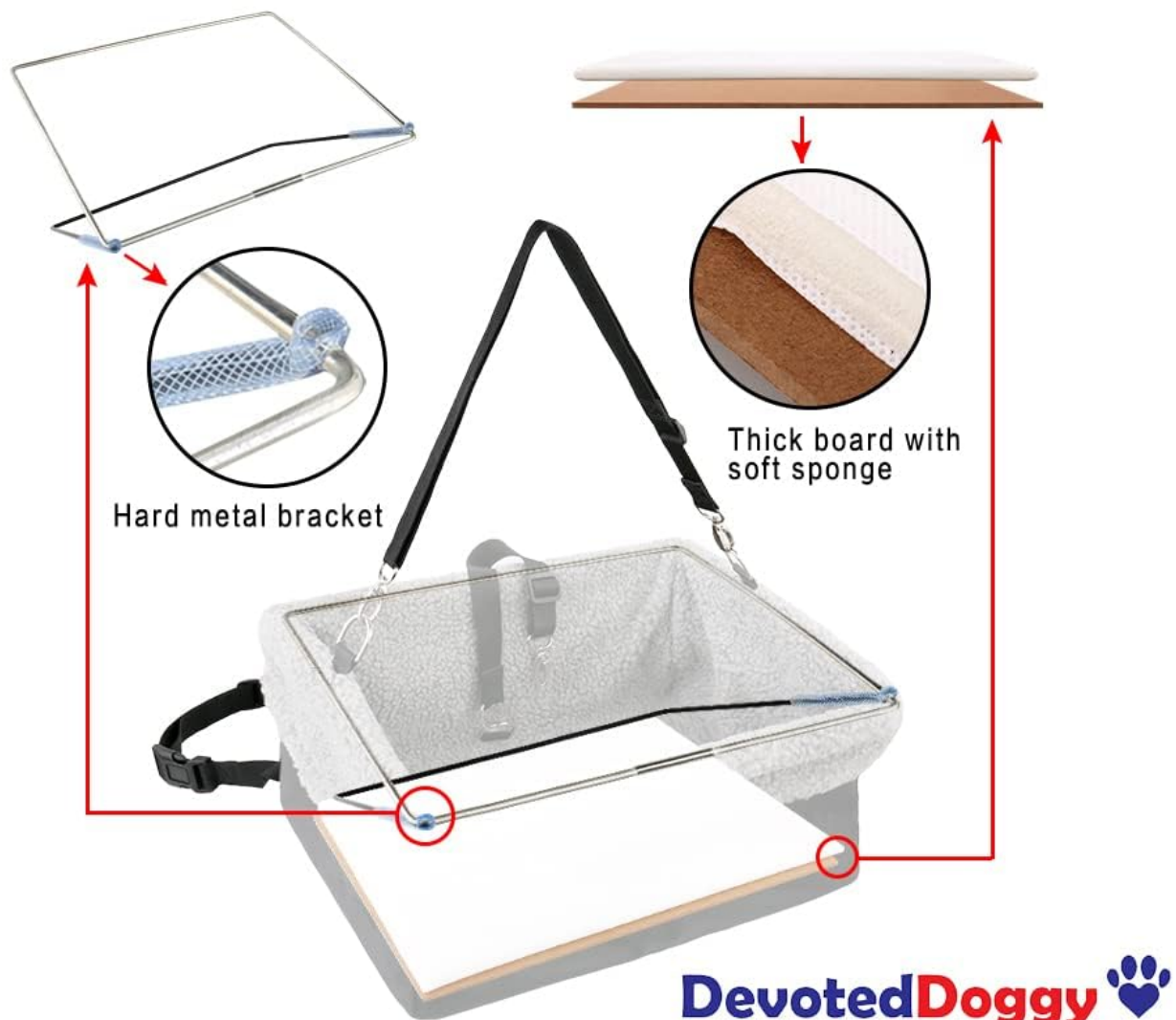
Figure 2: Internal metal frame and padded base for structural integrity and comfort.