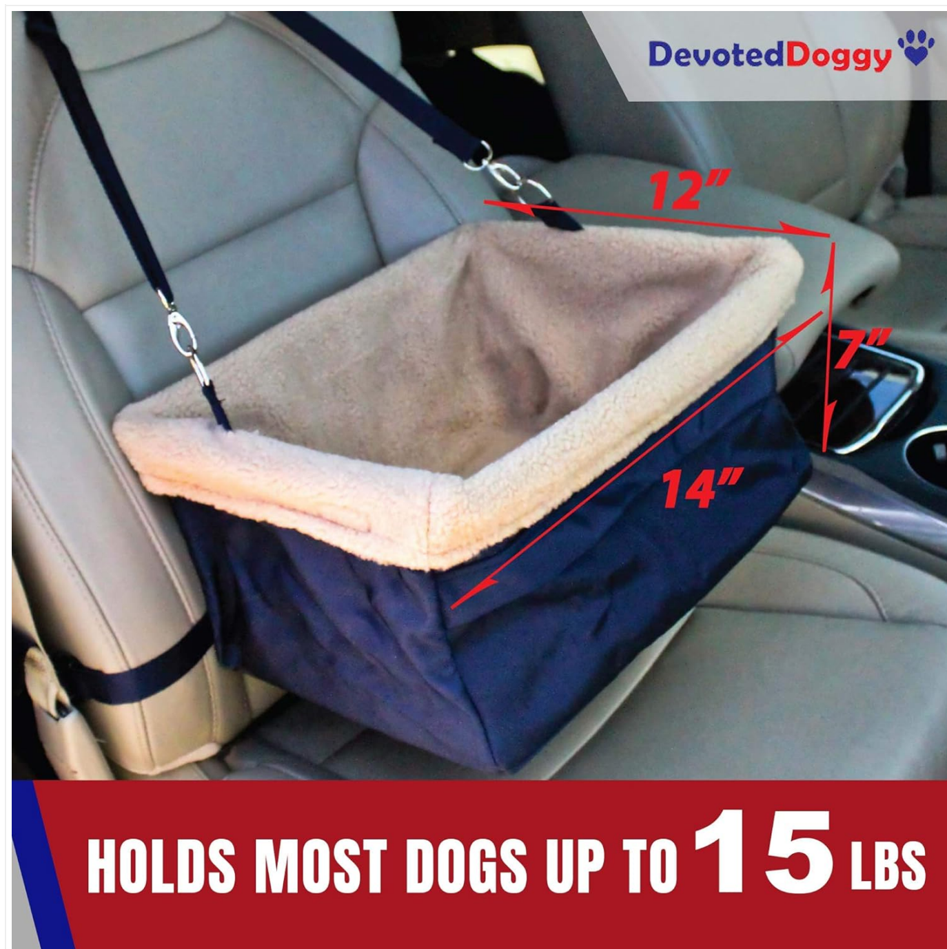
Figure 6: Product dimensions and weight capacity.