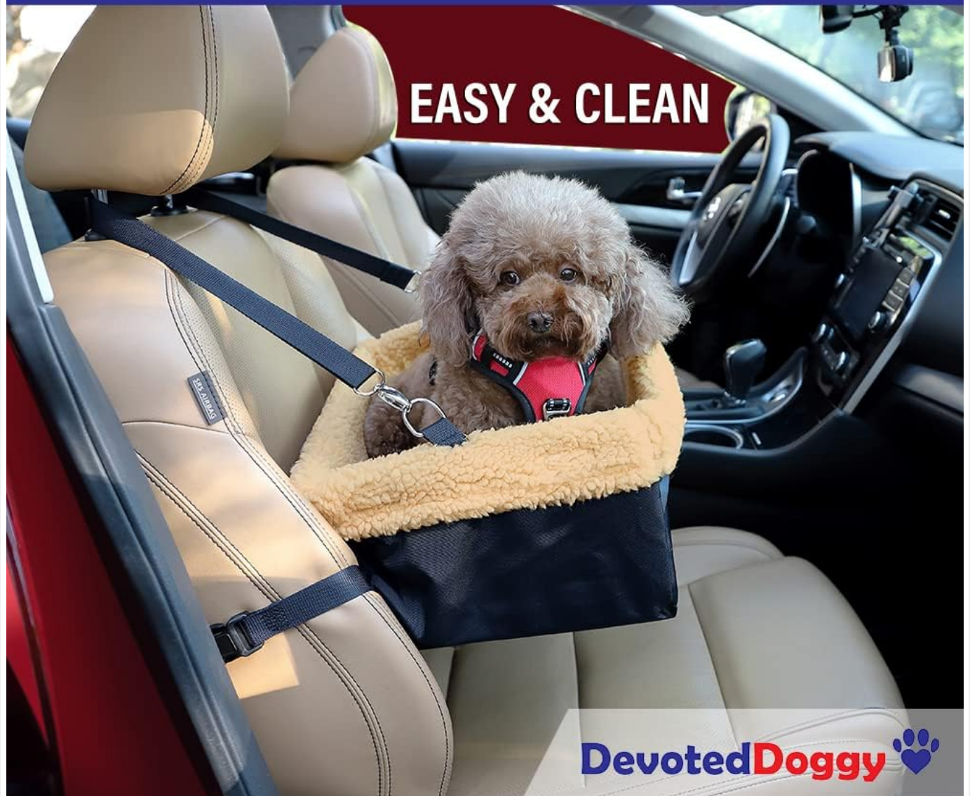
Figure 5: The car seat's design facilitates easy cleaning and maintenance.

CANVAS EXTERIOR THAT IS QUICK TO CLEAN & INTERIOR KEEPS HAIR IN ONE PLACE