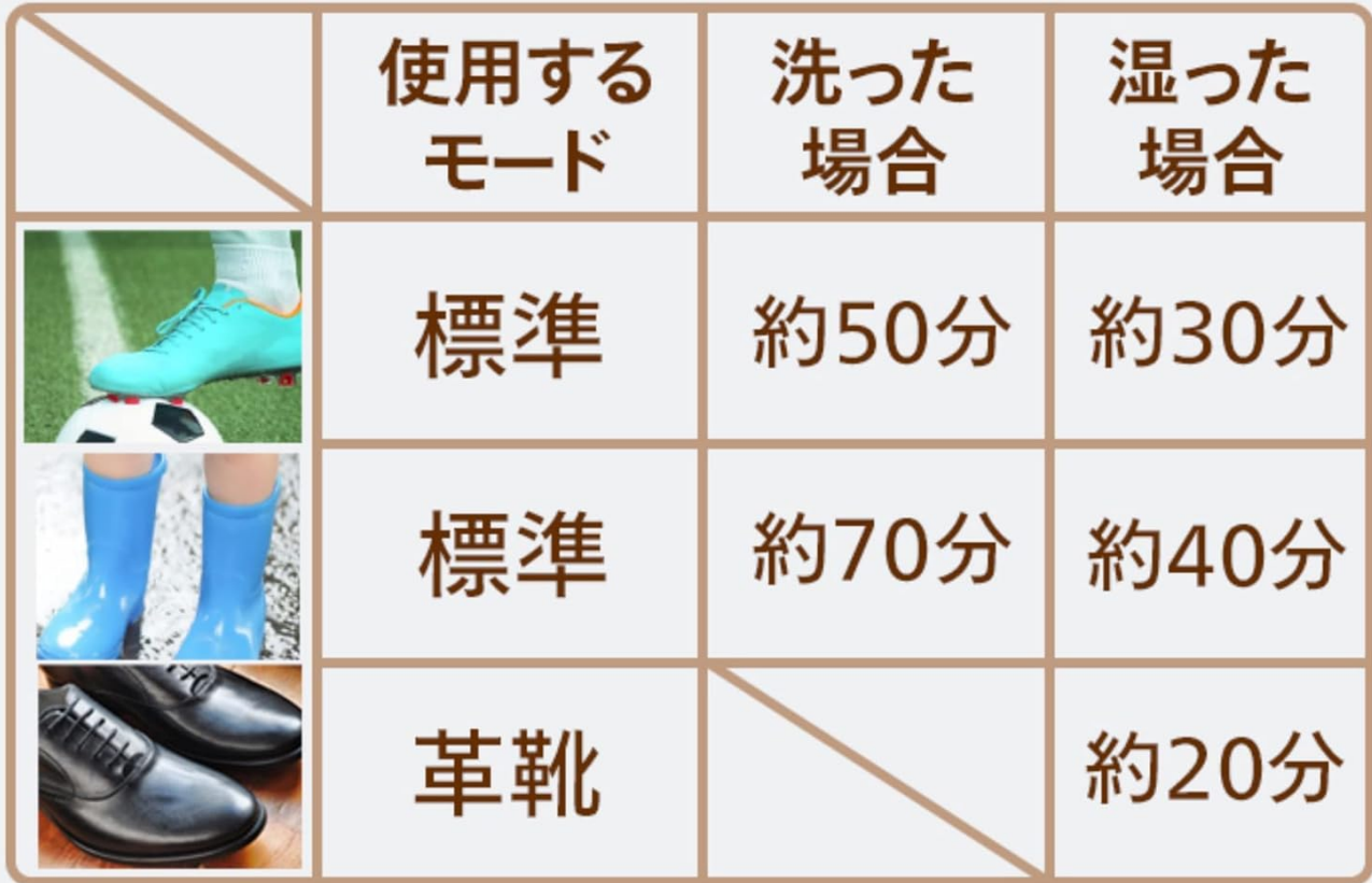
Figure 5.4: Estimated drying times for various shoe types and conditions.