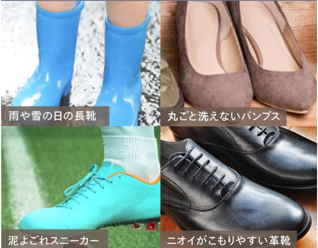
Figure 5.3: The dryer is versatile for various shoe types and conditions.