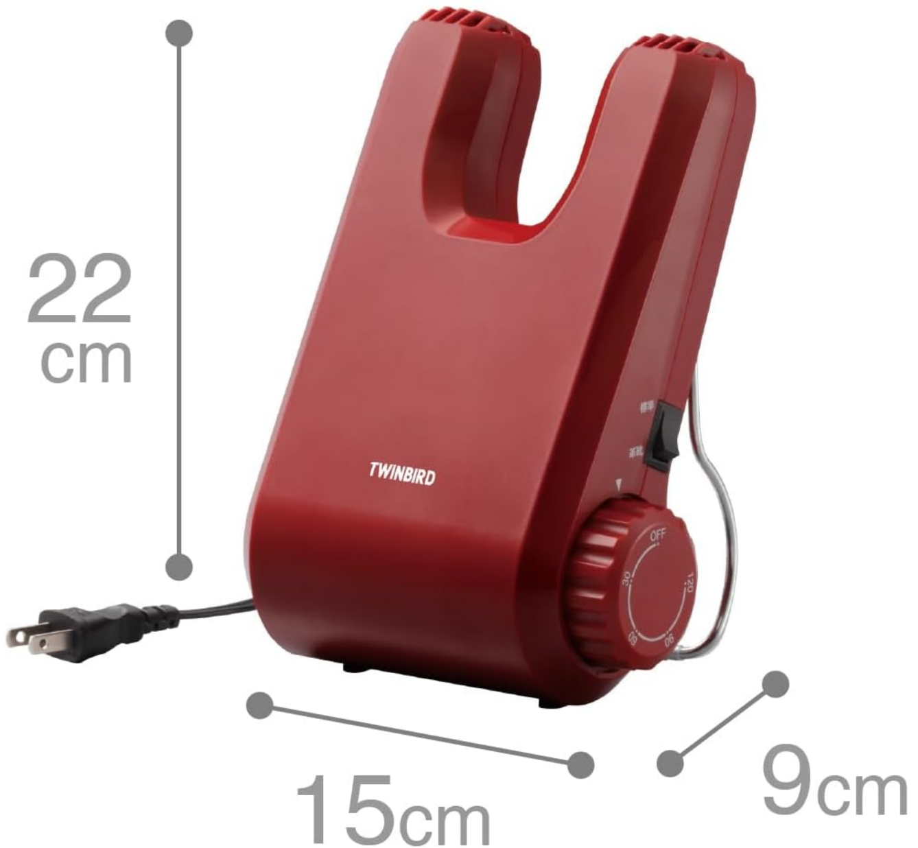
Figure 8.2: The compact design of the SD-4546R, making it easy to store.