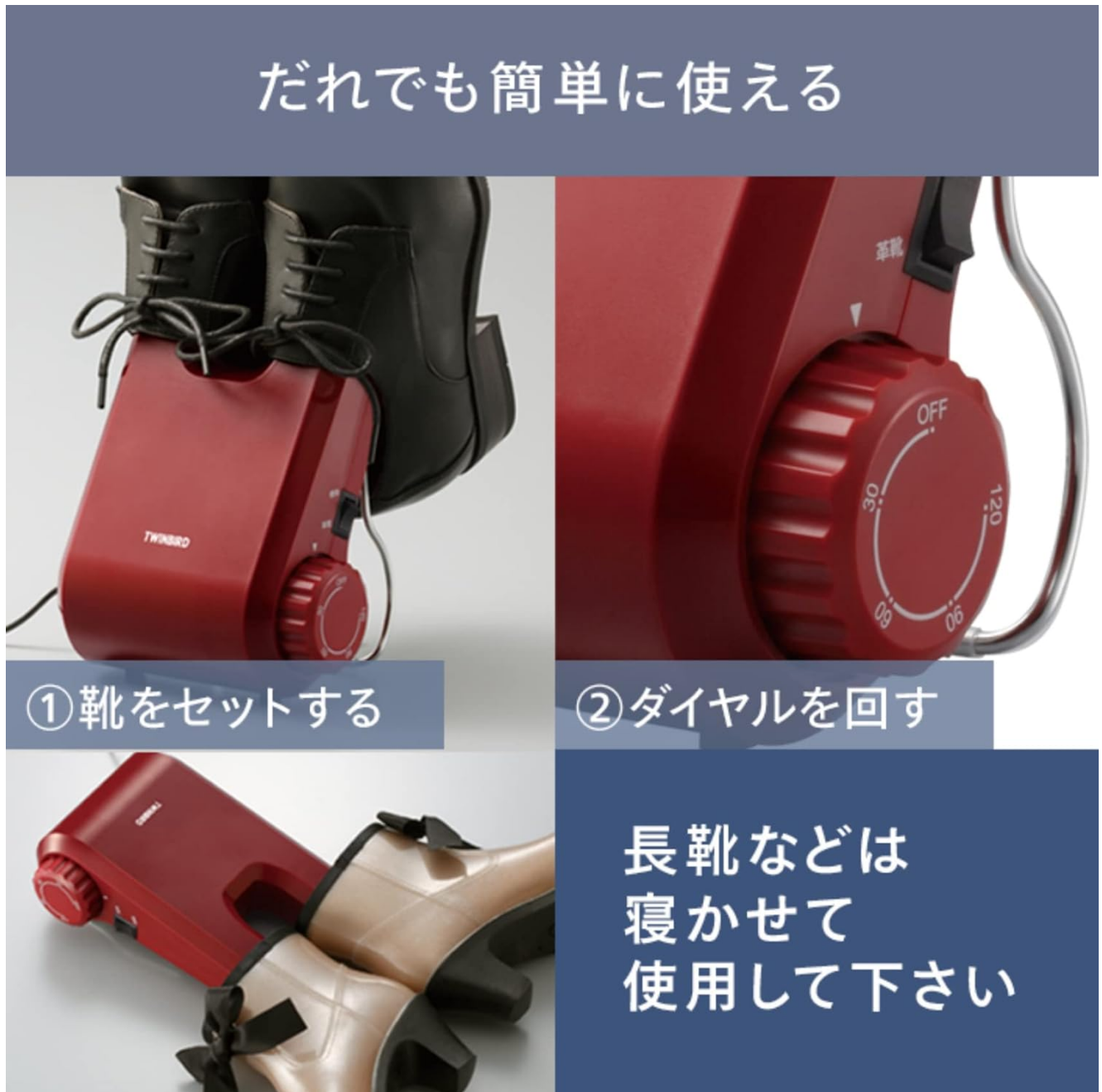
Figure 5.2: Simple two-step operation for drying shoes.