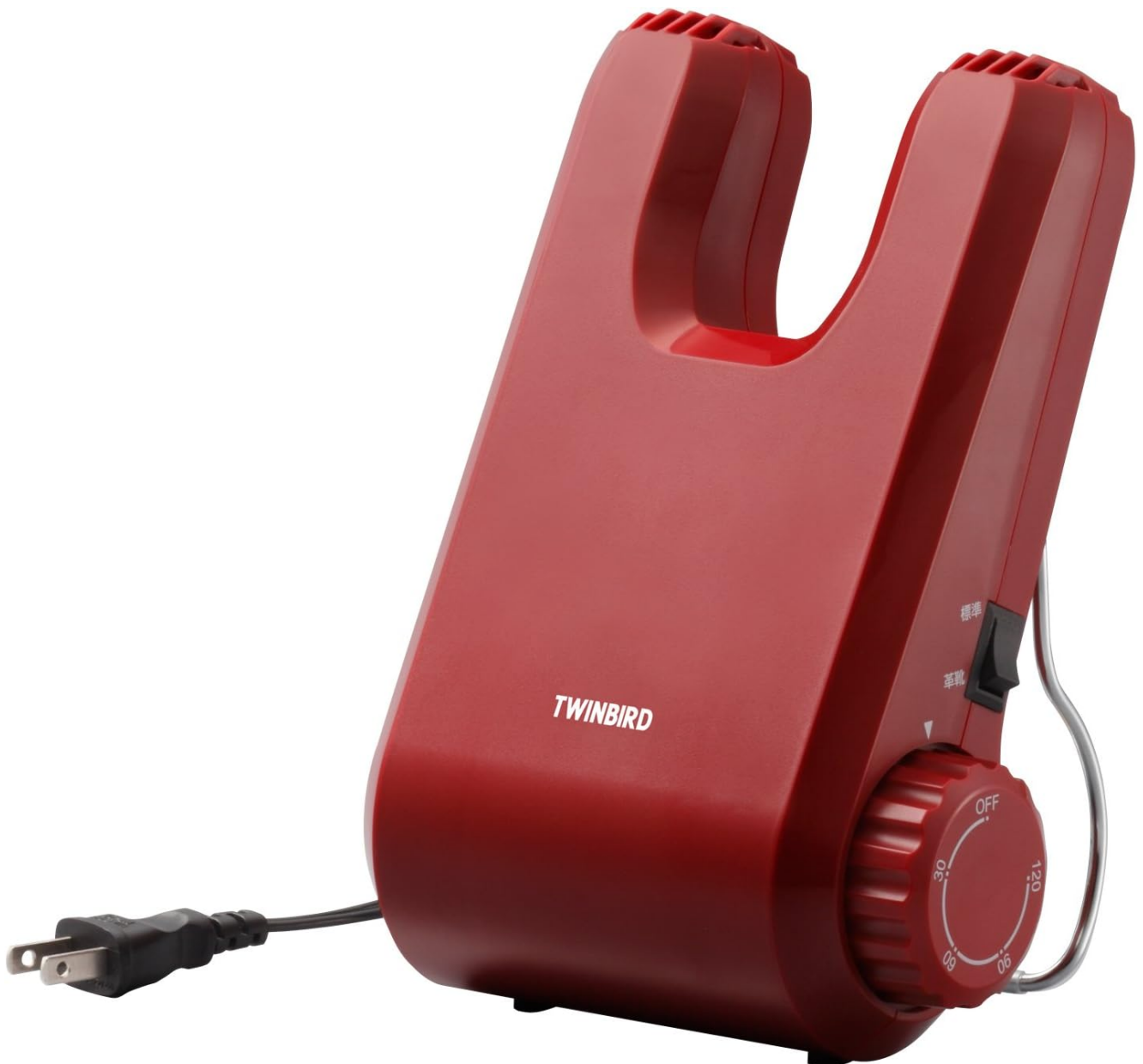
Figure 3.1: Front view of the TWINBIRD SD-4546R Shoe Dryer, showcasing its compact red design, drying nozzles, control dial, and power cord.

Familiarize yourself with the components of your TWINBIRD SD-4546R Shoe Dryer.