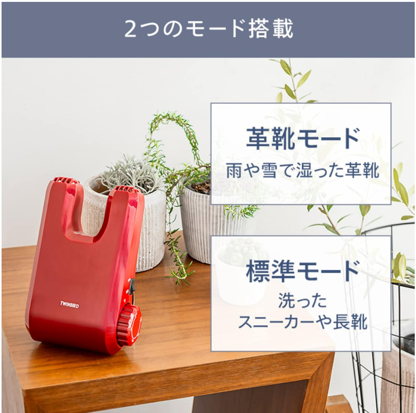
Figure 5.1: The shoe dryer features two modes for different shoe types and conditions.

The TWINBIRD SD-4546R offers two distinct drying modes: