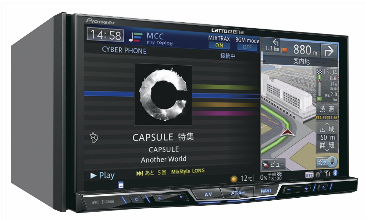
Figure 1: Front view of the Pioneer AVIC-ZH0999 Car Navigation System.