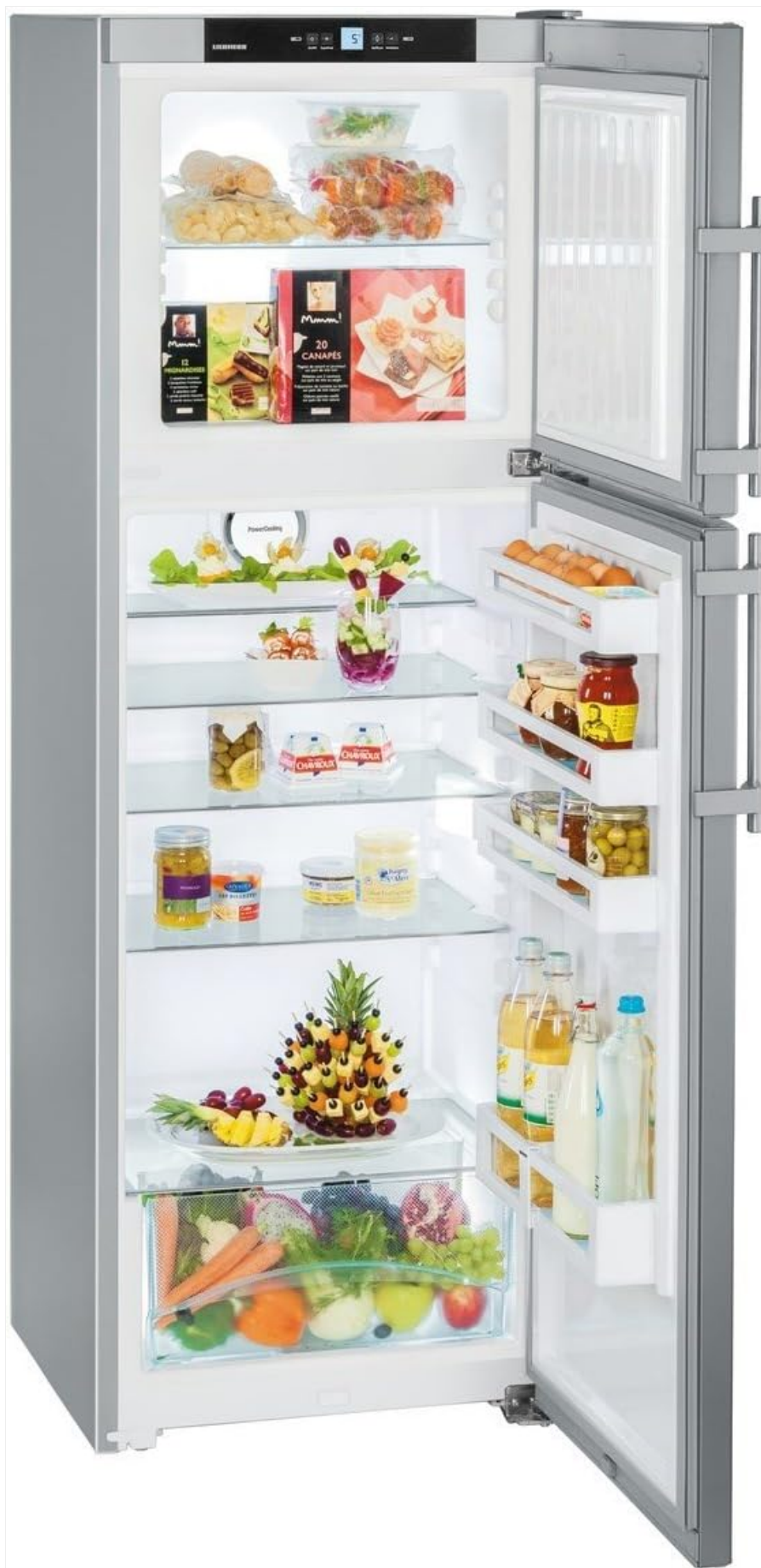
Figure 3: Interior view of the Liebherr CTPesf 3316-22 refrigerator compartment, showing adjustable glass shelves, door bins, and the large vegetable drawer, all illuminated by LED lighting.