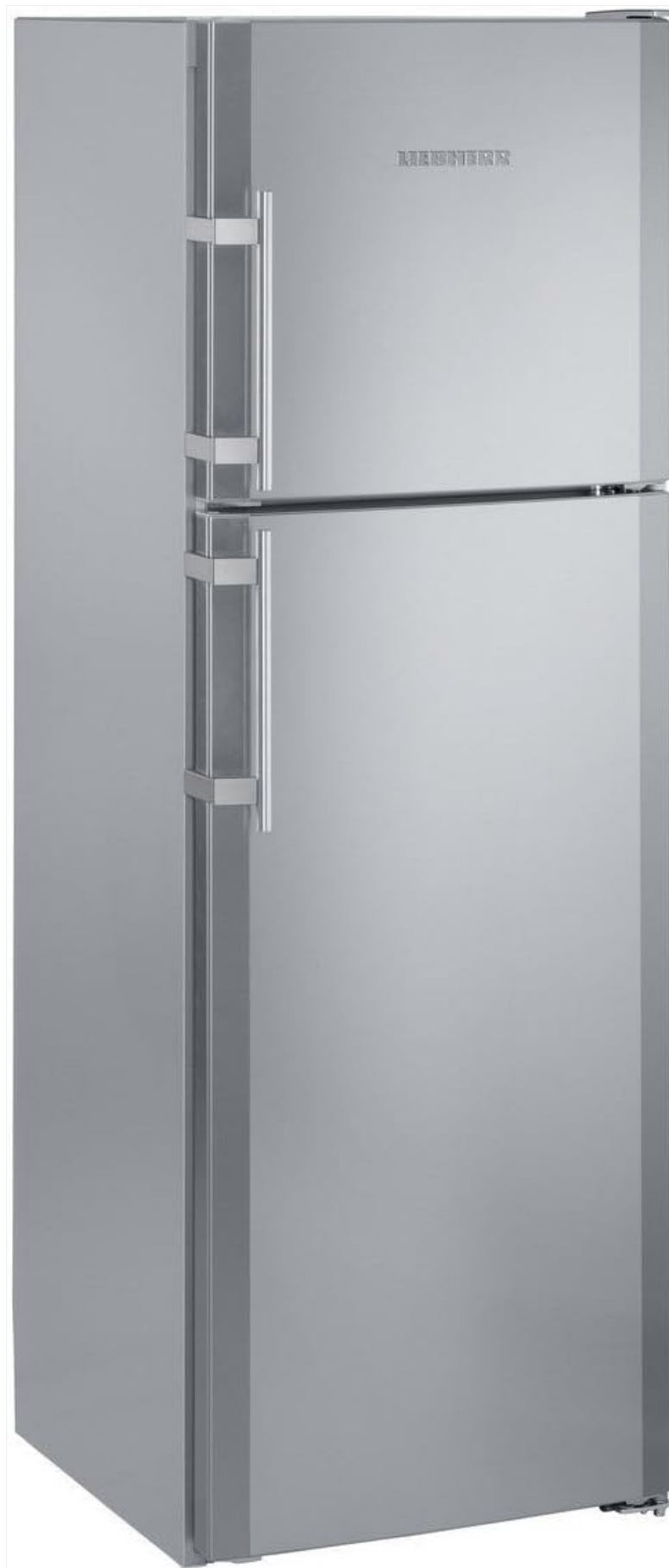
Figure 1: Front exterior view of the Liebherr CTPesf 3316-22 refrigerator-freezer, showcasing its silver finish and integrated handles.

The dimensions of the appliance are approximately 600 mm (width) x 630 mm (depth) x 1761 mm (height). Refer to the dimensional drawing for detailed measurements and required clearances.