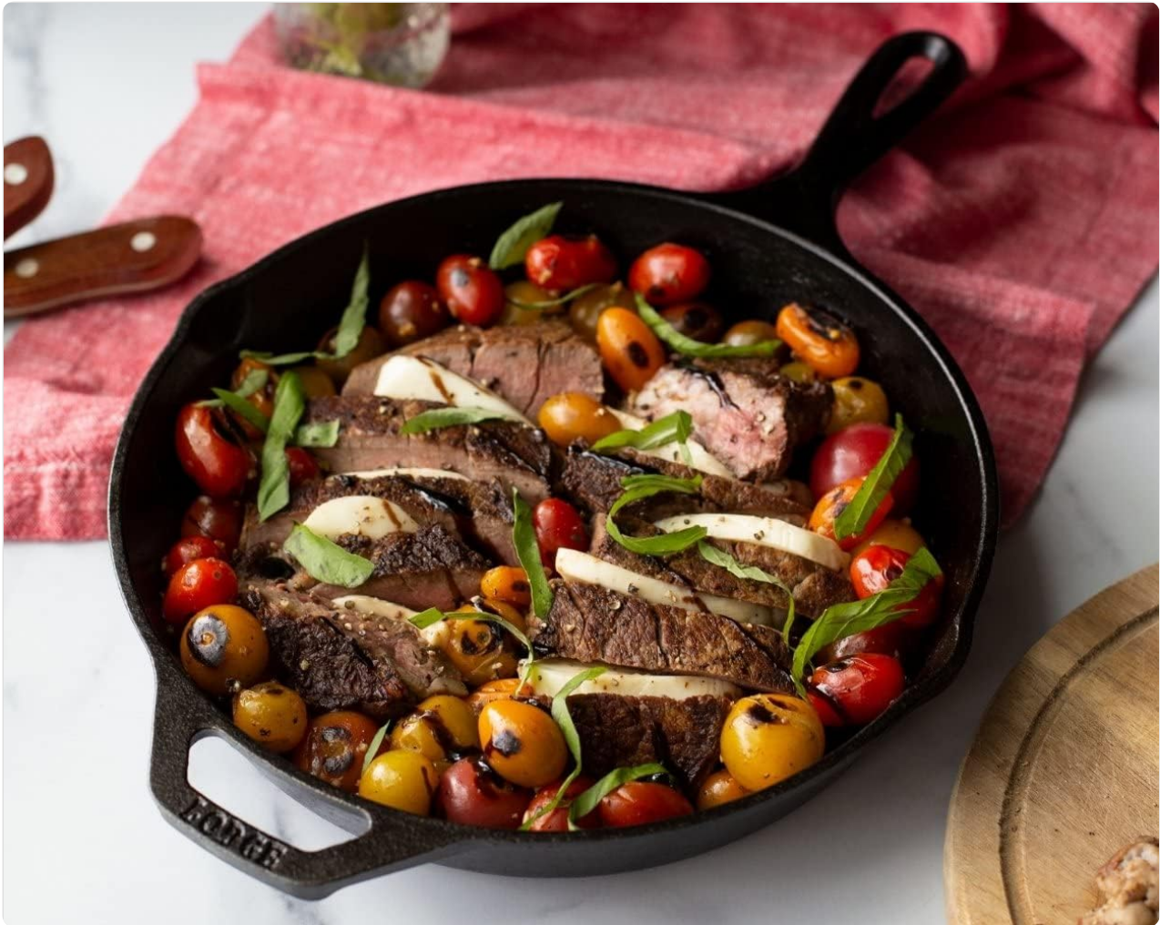
Figure 3: A perfectly seared steak and roasted vegetables prepared in the Lodge Cast Iron Skillet.

This image demonstrates the skillet's ability to cook a full meal, showcasing a seared steak surrounded by colorful roasted tomatoes and herbs, highlighting its even cooking and presentation capabilities.