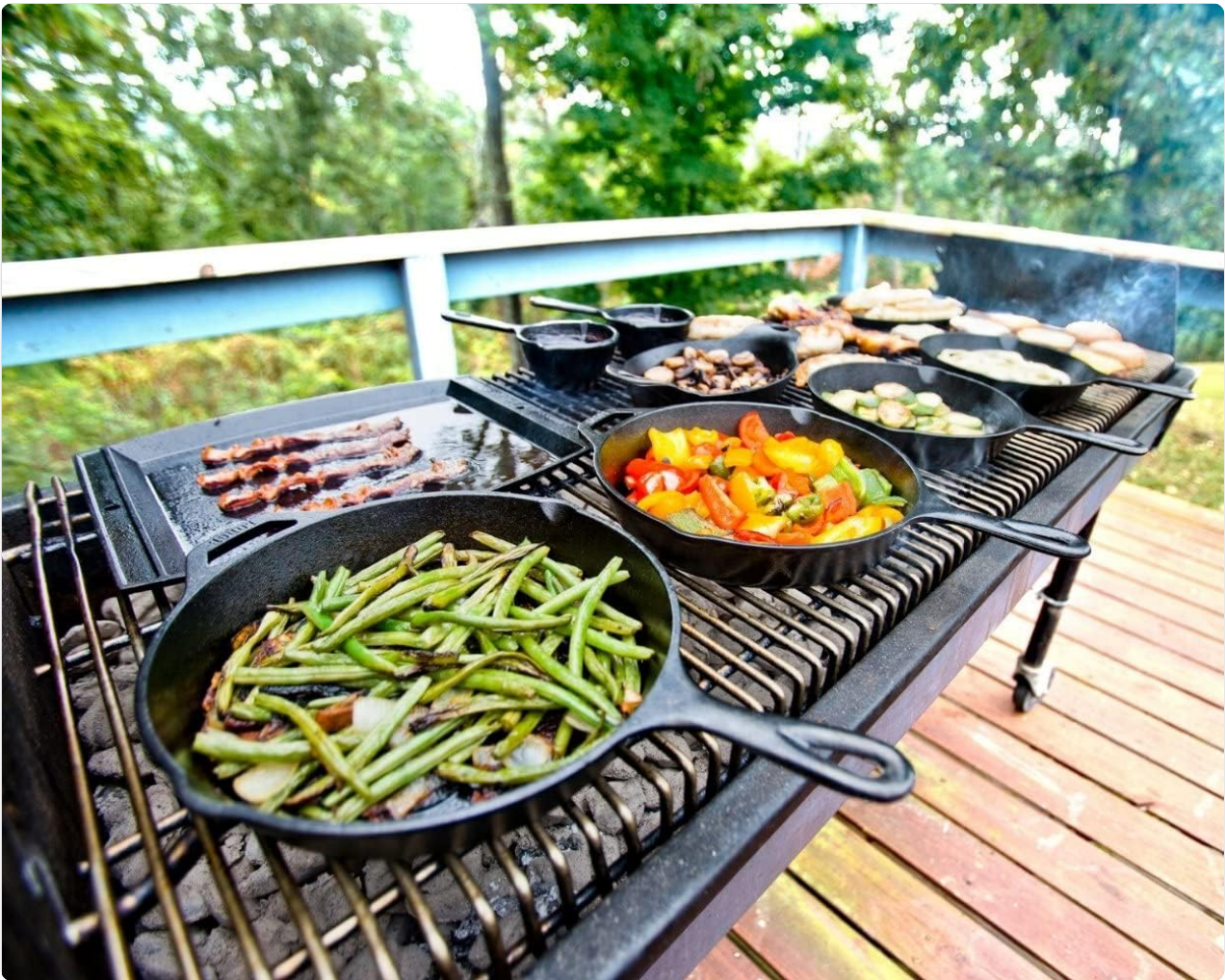
Figure 5: Several Lodge Cast Iron Skillets being used on an outdoor grill.

This image highlights the skillet's outdoor versatility, showing multiple skillets on a grill cooking various foods like bacon, vegetables, and green beans, perfect for camping or backyard barbecues.