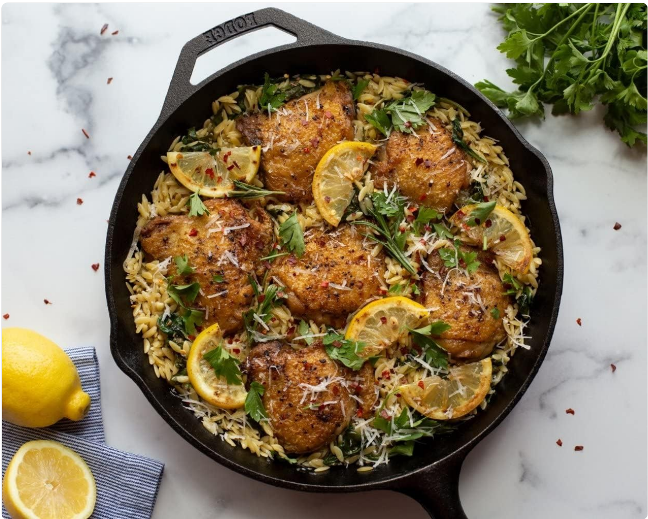
Figure 4: Chicken and orzo dish cooked in the Lodge Cast Iron Skillet.

This image features a complete chicken and orzo meal prepared in the skillet, illustrating its capacity for one-pan cooking and its suitability for various recipes.