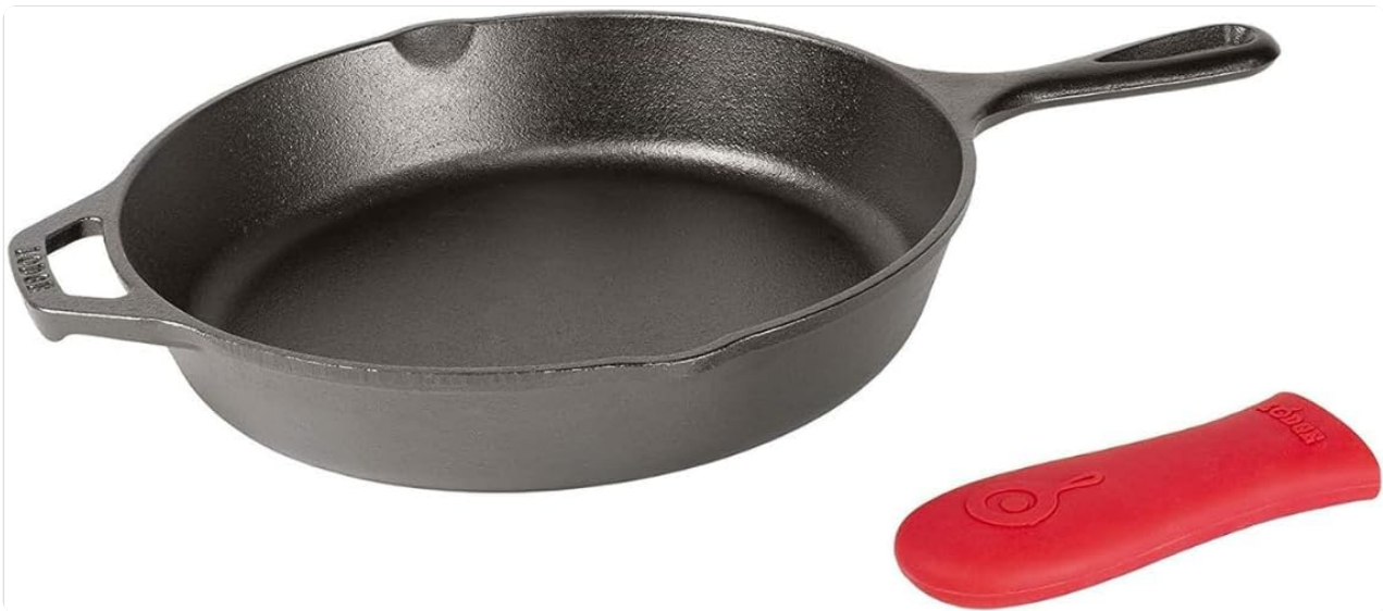
Figure 1: Lodge 10.25-inch Cast Iron Skillet with Red Silicone Hot Handle Holder.

This image displays the Lodge 10.25-inch Cast Iron Skillet, featuring its classic black finish and the accompanying red silicone hot handle holder. The skillet has a main handle and an assist handle for easier lifting.