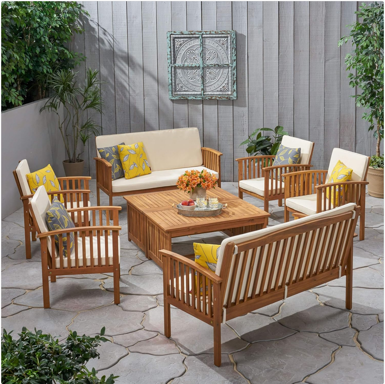
Image 1.1: The complete Christopher Knight Home Carolina 8-Pcs Outdoor Sofa Seating Set arranged in a patio environment.