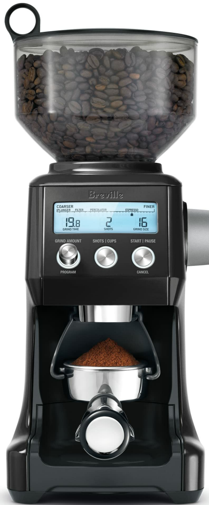
Image: The Breville Smart Grinder Pro, model BCG820BKSL, in a black sesame finish, positioned on a kitchen counter with coffee beans in the hopper and ground coffee in the container.

Your browser does not support the video tag. Please update your browser to view this content.