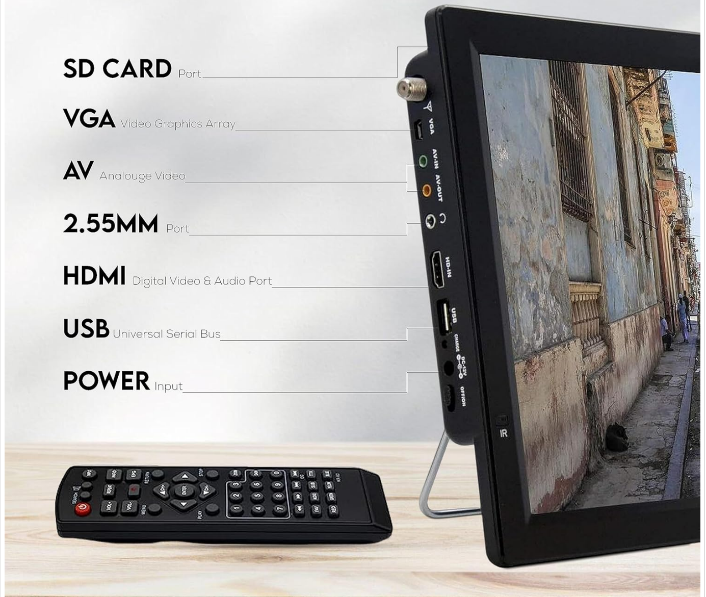
Image: Side view of the Milanix 14.1 inch Portable LED TV, detailing the various input ports including SD Card, VGA, AV, 2.55mm (Headphone), HDMI, USB, and Power Input.