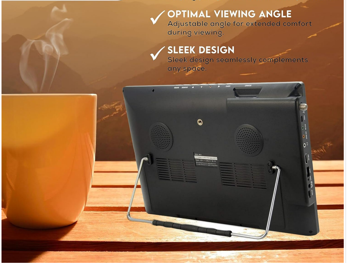
Image: Rear view of the Milanix 14.1 inch Portable LED TV, highlighting the adjustable stand for stable support and optimal viewing angles. The top panel shows control buttons for SOURCE, MENU, VOL+/-, CH+/-, and POWER.