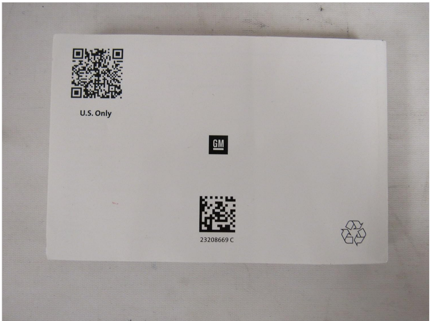
Image: Back cover of the 2015 Chevrolet Silverado Owners Manual, featuring QR codes, the GM logo, and a recycling symbol. One QR code is labeled "U.S. Only".