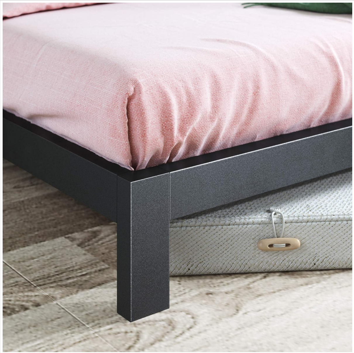
A close-up of the bed frame leg, showing the clearance for under-bed storage.