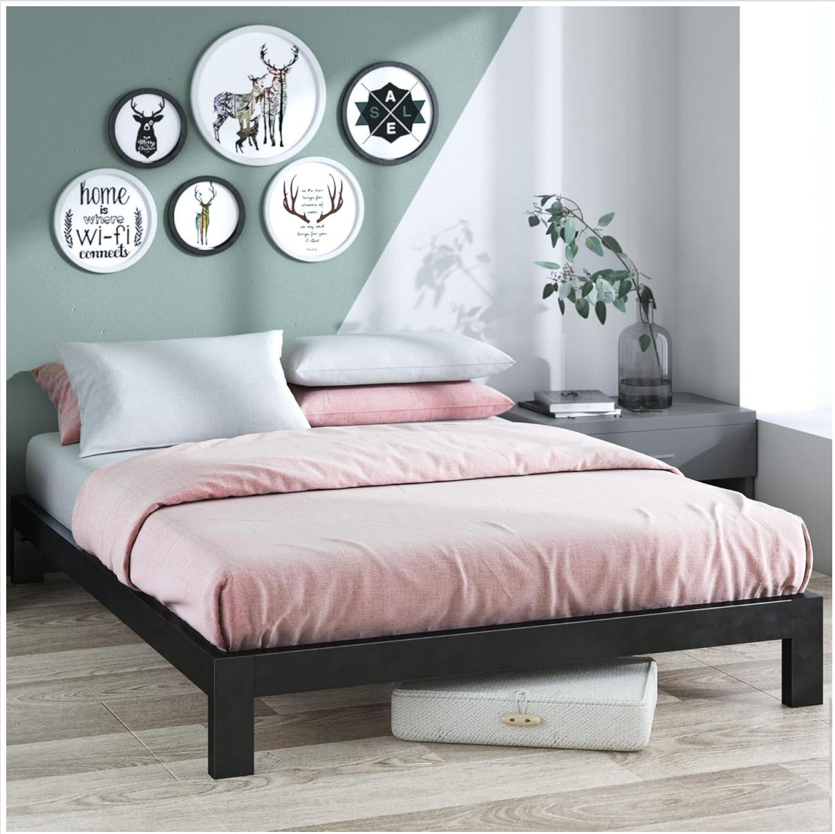
An assembled ZINUS Arnav Full Metal Platform Bed Frame, showcasing its low-profile design with a mattress and bedding.