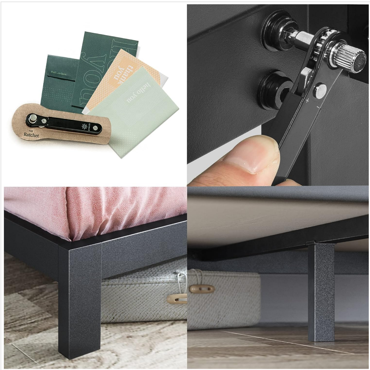
Image showing the included mini ratchet tool, bolts, and thank you cards provided for assembly.