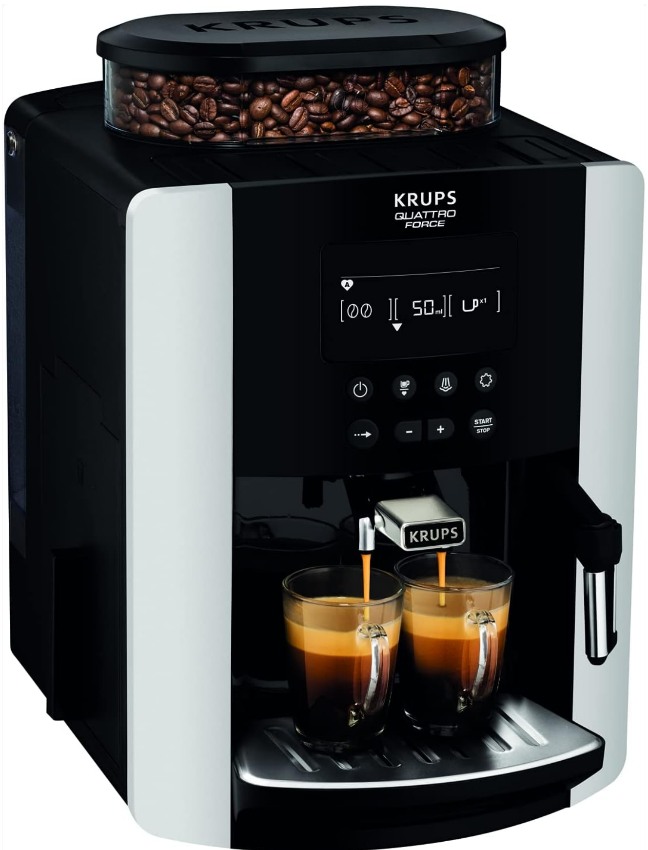
Figure 1.1: KRUPS Arabica Automatic Espresso Machine with two cups of coffee.