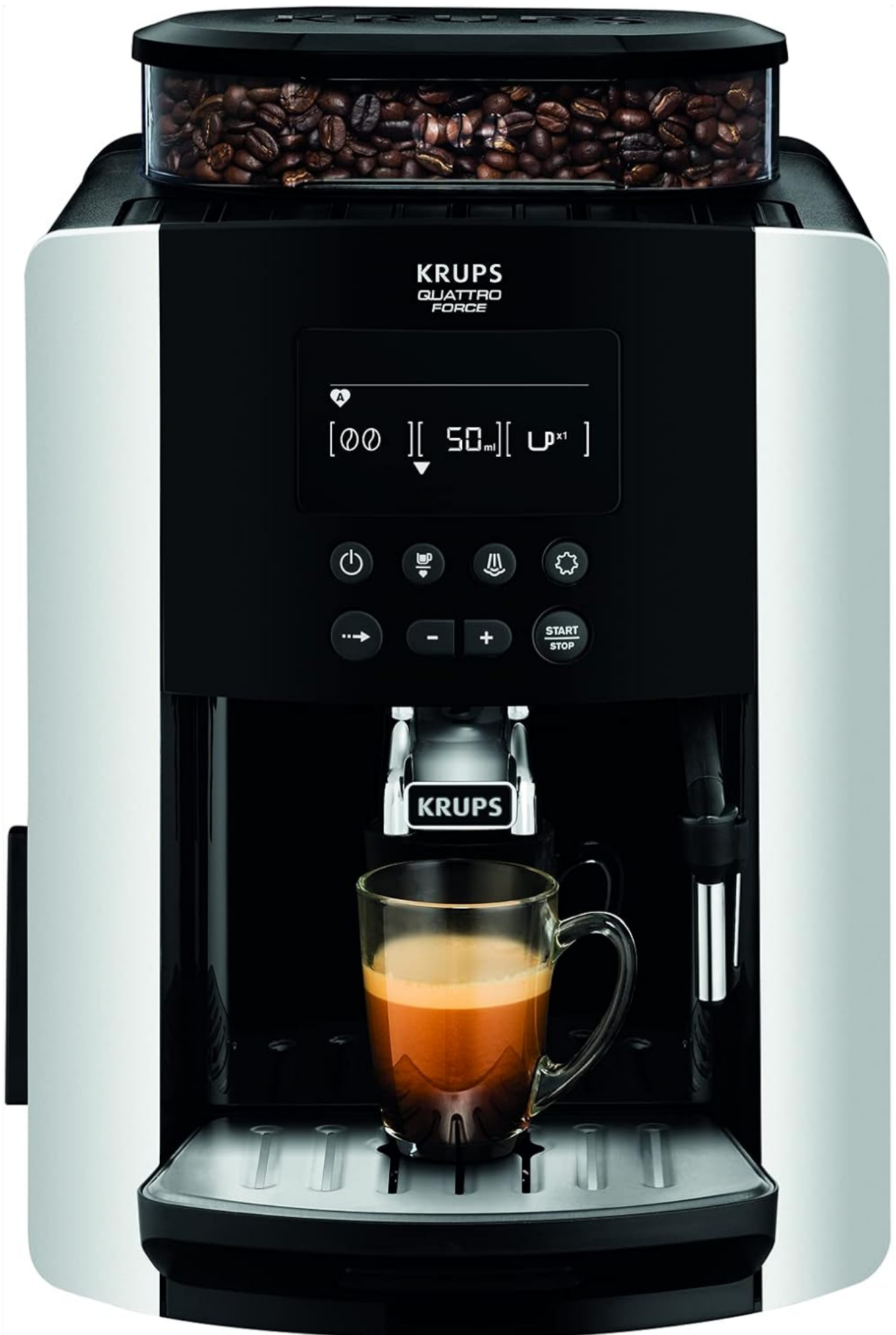
Figure 5.1: The KRUPS Arabica machine dispensing coffee into a single glass cup.