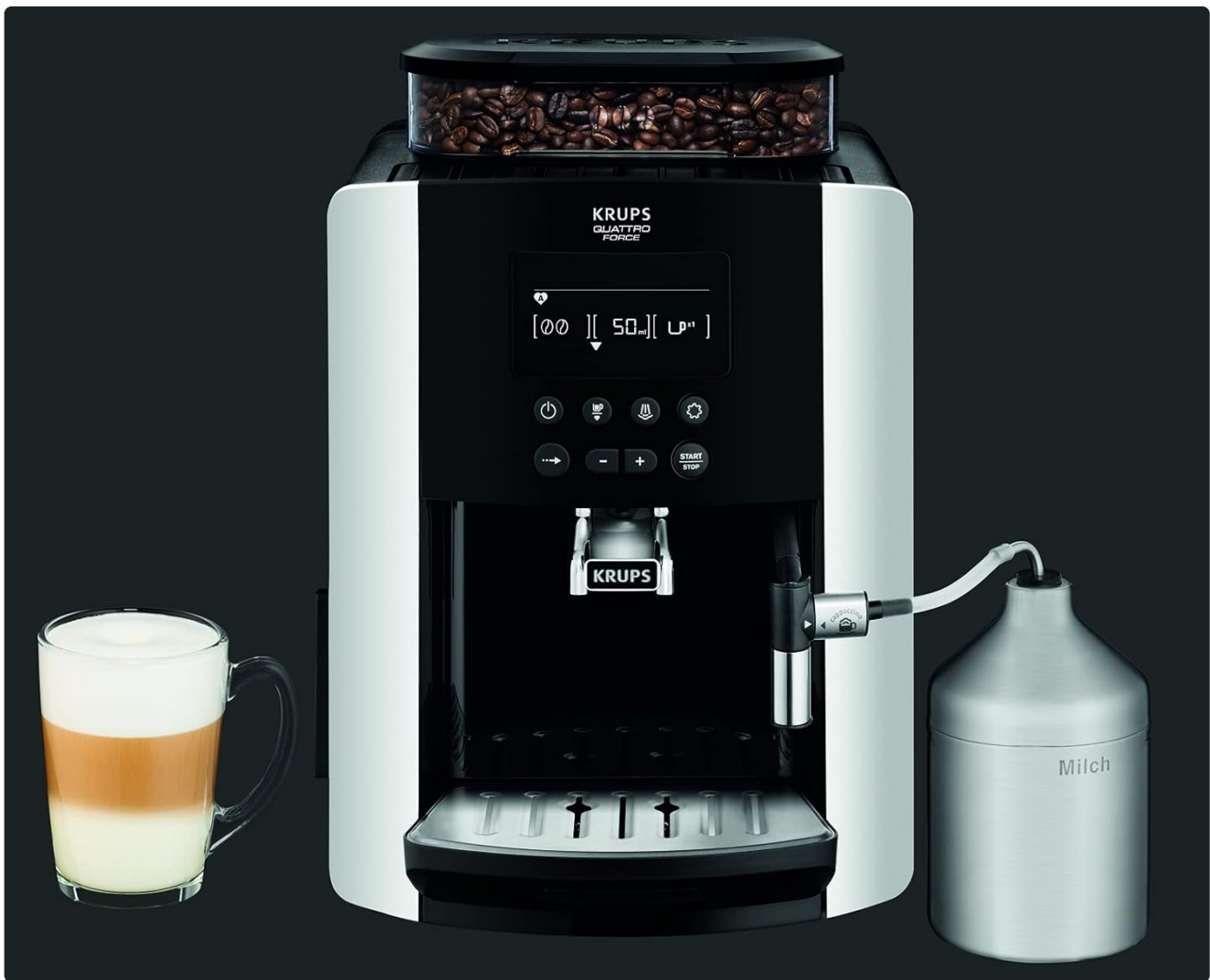
Figure 5.3: The coffee machine shown alongside a milk frother and a prepared latte.