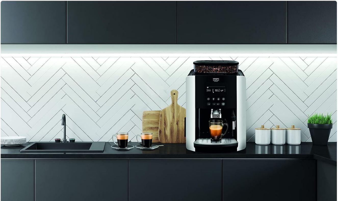
Figure 4.1: The KRUPS Arabica machine positioned on a kitchen countertop, ready for use.