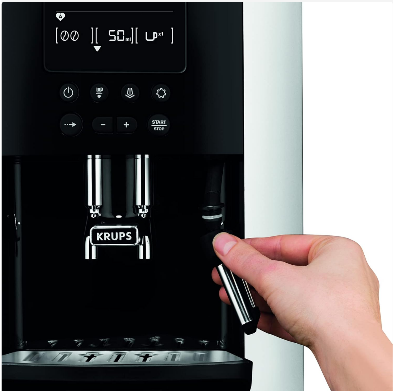
Figure 5.2: A hand demonstrating the use of the integrated steam wand.