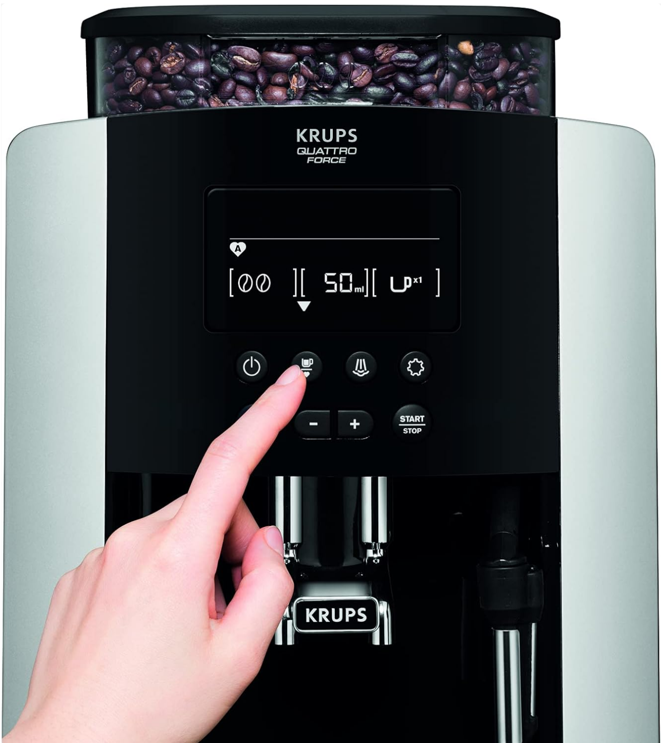
Figure 3.2: A hand pressing a button on the intuitive LCD control panel.