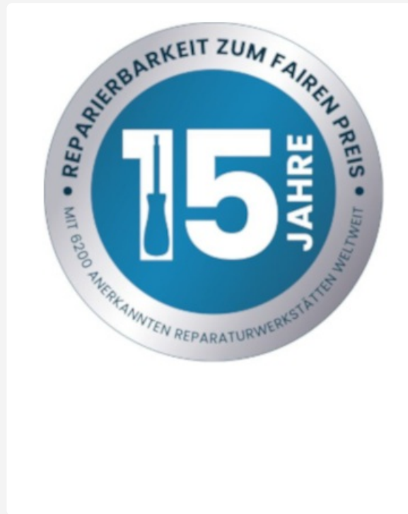
Figure 9.1: KRUPS 15-year repairability commitment logo.

For warranty claims, technical support, or to inquire about spare parts, please visit the official KRUPS website or contact their customer service department. Please have your model number (EA817810) and proof of purchase ready.