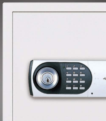
Image: Visual representation of the safe's security features, including 60-minute fire resistance, digital media fire protection, rapid heating/impact/drop test compliance, double lock, and anti-peeping function.