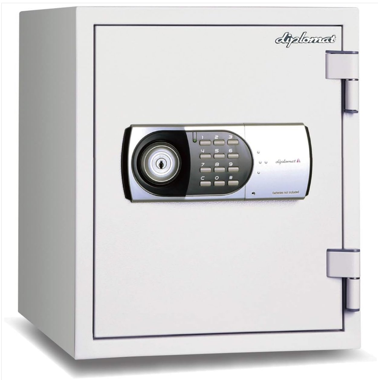
Image: Front view of the Diplomat 125EK77DRUG Fireproof Safe, showcasing its white exterior and electronic keypad.