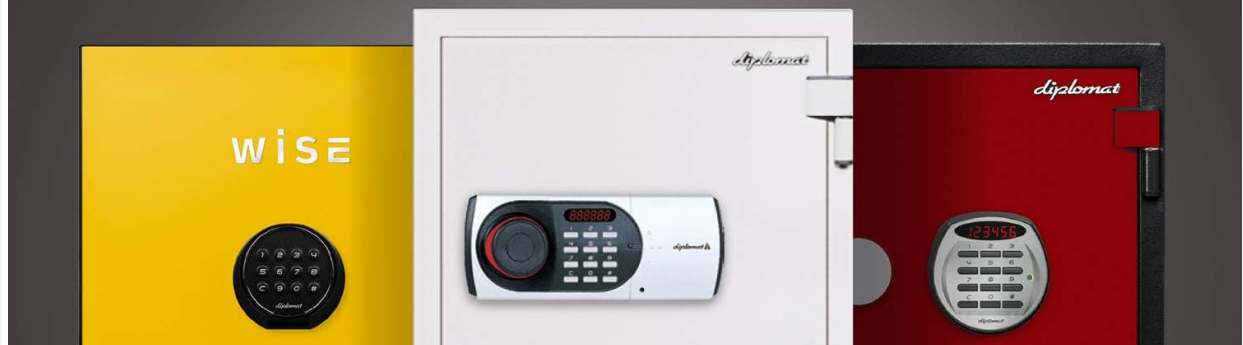
Image: Diplomat's commitment to customer support, highlighting the 18-month guarantee and fire recovery support service.

万が一火災により耐火金庫が焼損した場合に、現在お使いの金庫と同等の金庫本体を無料にてお届けいたします。