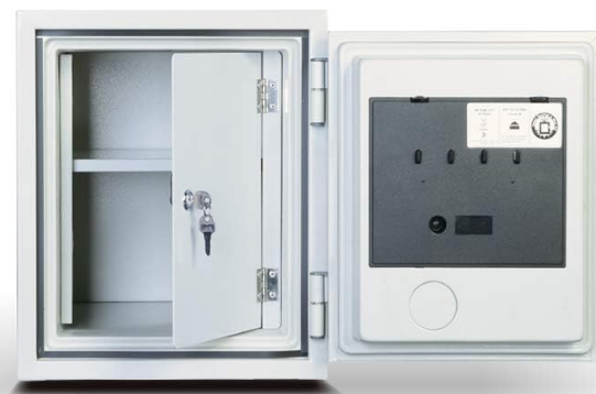
Image: Detailed view of the safe's external dimensions (W352 x D454 x H412 mm) and internal dimensions (W260 x D292 x H320 mm), along with an open view showing the inner door with cylinder lock and key hooks.