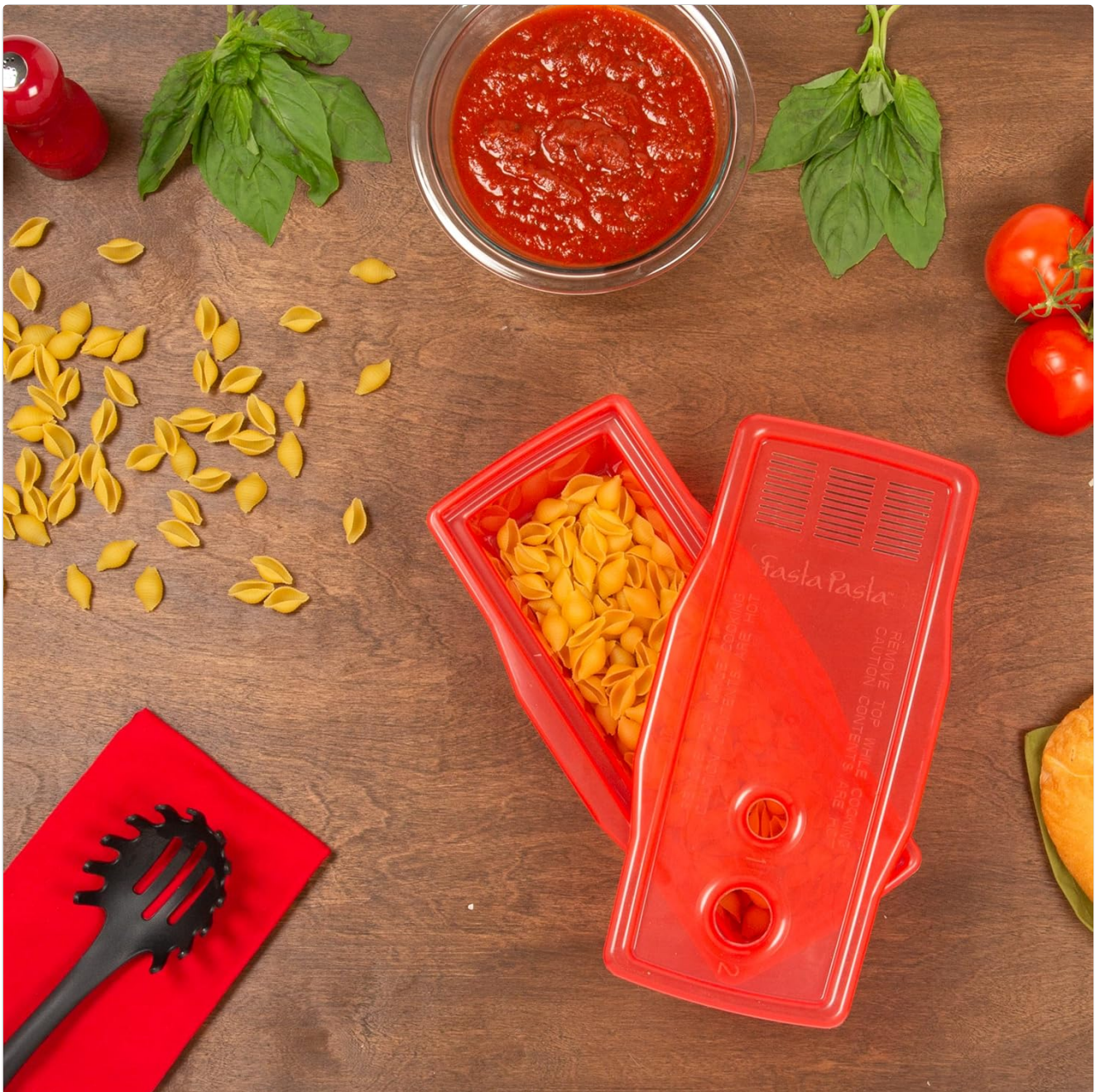
Image: The Fasta Pasta cooker open, filled with uncooked shell-shaped pasta, positioned on a wooden surface with tomatoes, basil, and sauce nearby.