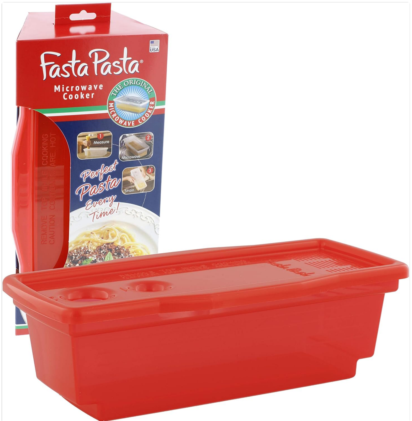
Image: The Fasta Pasta Microwave Cooker, red in color, shown alongside its retail packaging. The cooker is a rectangular container with a lid, designed for microwave use.