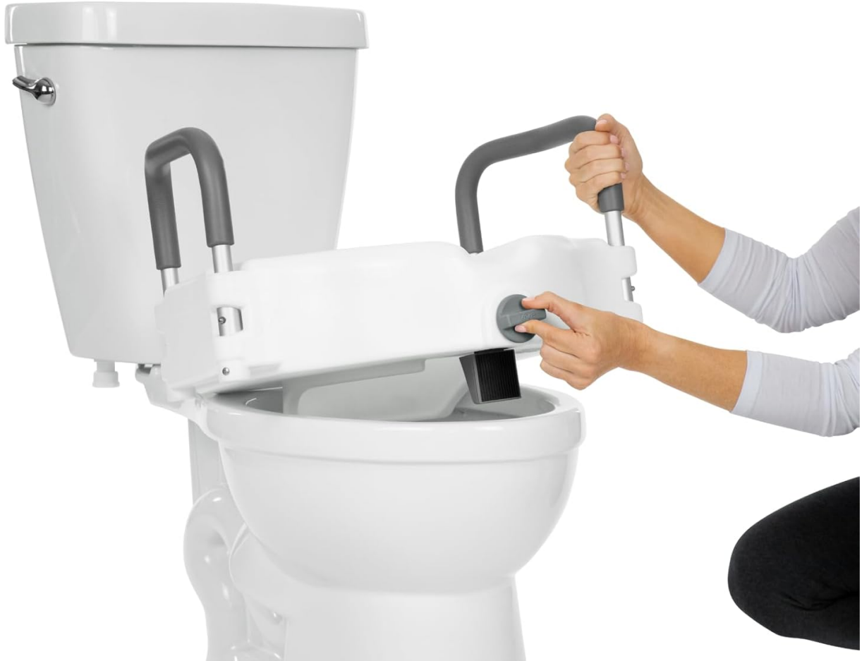
Image: Illustrates the easy, tool-free installation process of the raised toilet seat onto a standard toilet.

Video: This video provides a comprehensive overview of the Vive Raised Toilet Seat, including its features and how it attaches to a toilet.