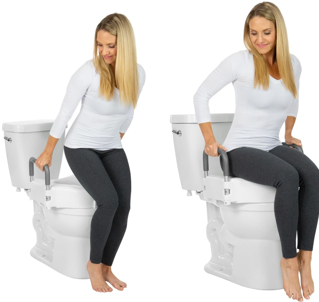
Image: A user demonstrating the ease of sitting and standing from the toilet with the added height of the Vive Raised Toilet Seat.

Effortlessly maneuver with 5 extra inches