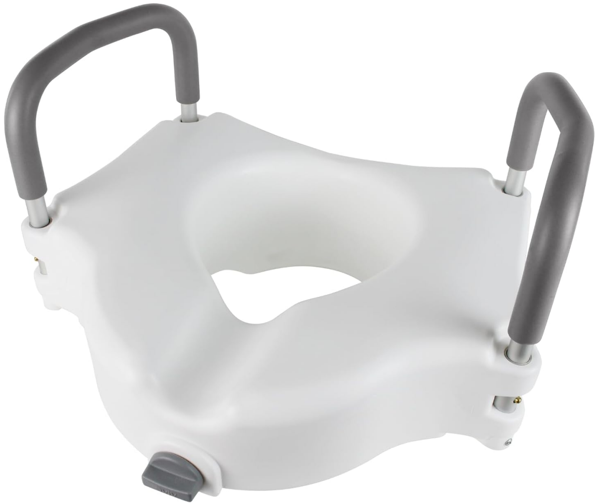
Image: The main unit of the Vive Raised Toilet Seat with its contoured design and attachment points for handles.