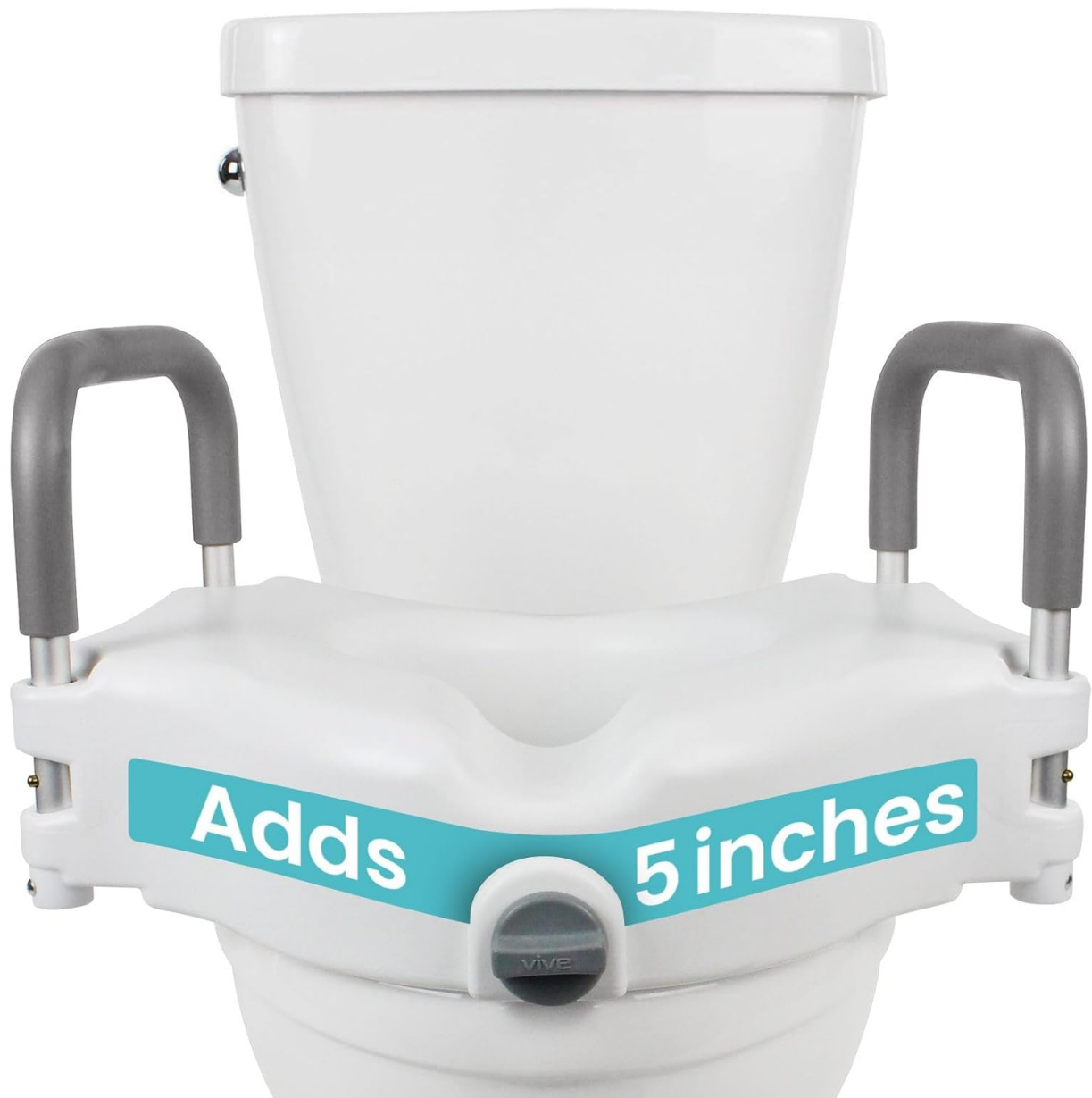
Image: The Vive Raised Toilet Seat installed on a standard toilet, clearly indicating the added 5 inches of height.