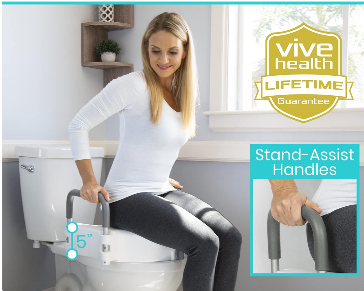
Image: A user demonstrating the stability and support provided by the Vive Raised Toilet Seat during use.