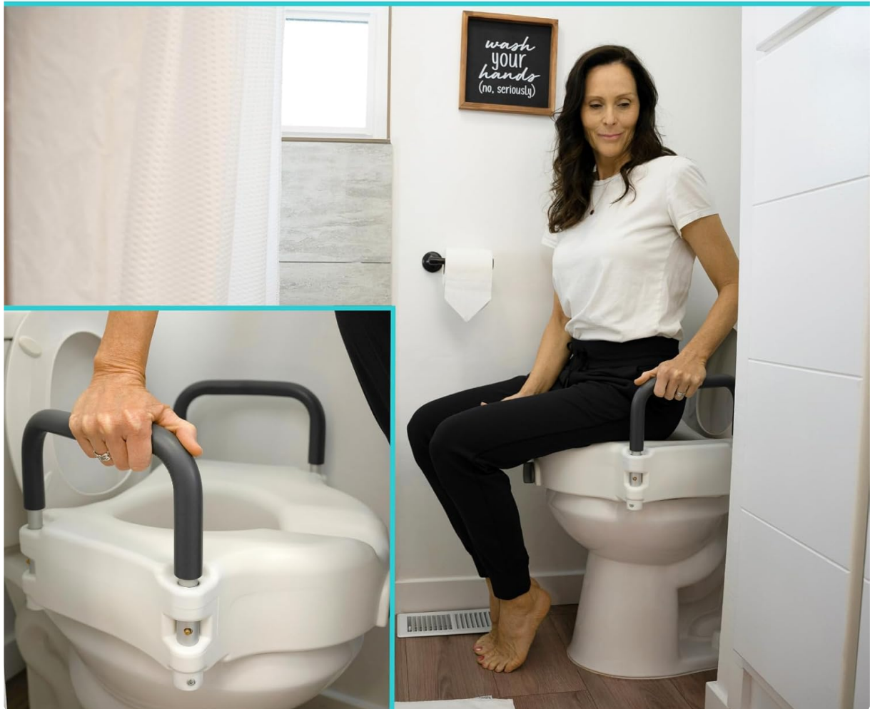
Image: A close-up view highlighting the comfortable, padded handles that provide additional support.