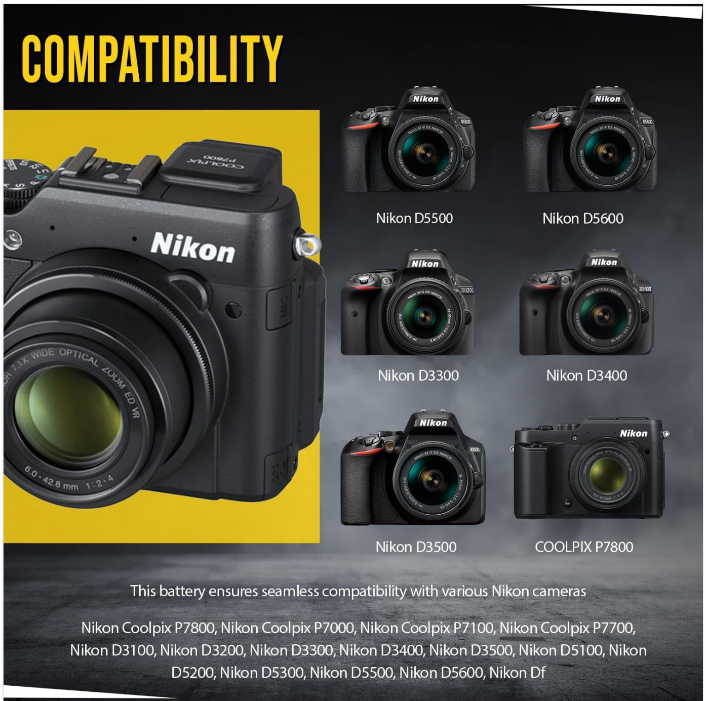
Image: Visual representation of the BM Premium EN-EL14A battery's compatibility with various Nikon camera models, including D5500, D5600, D3300, D3400, D3500, and Coolpix P7800.