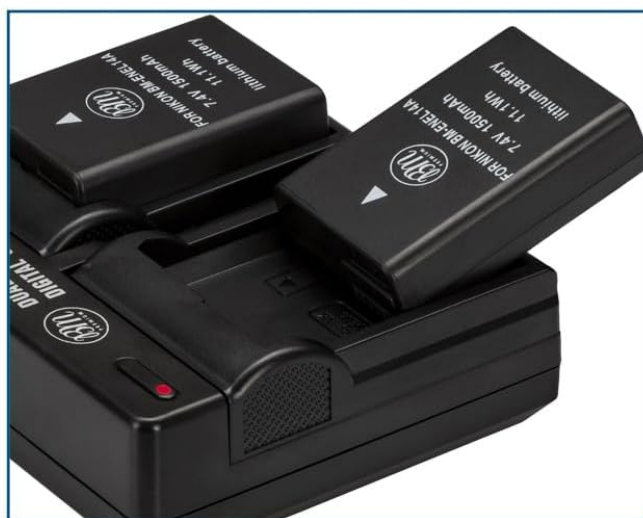
Insert batteries into charger.