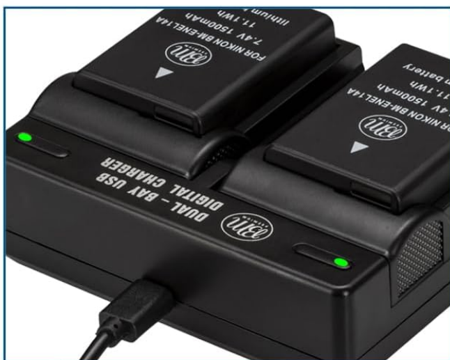
Allow to fully charge.