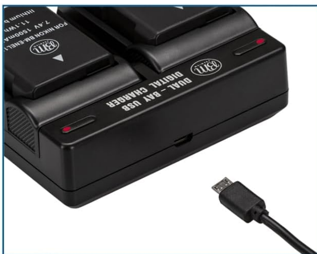
Plug in USB power cord into charger and power source