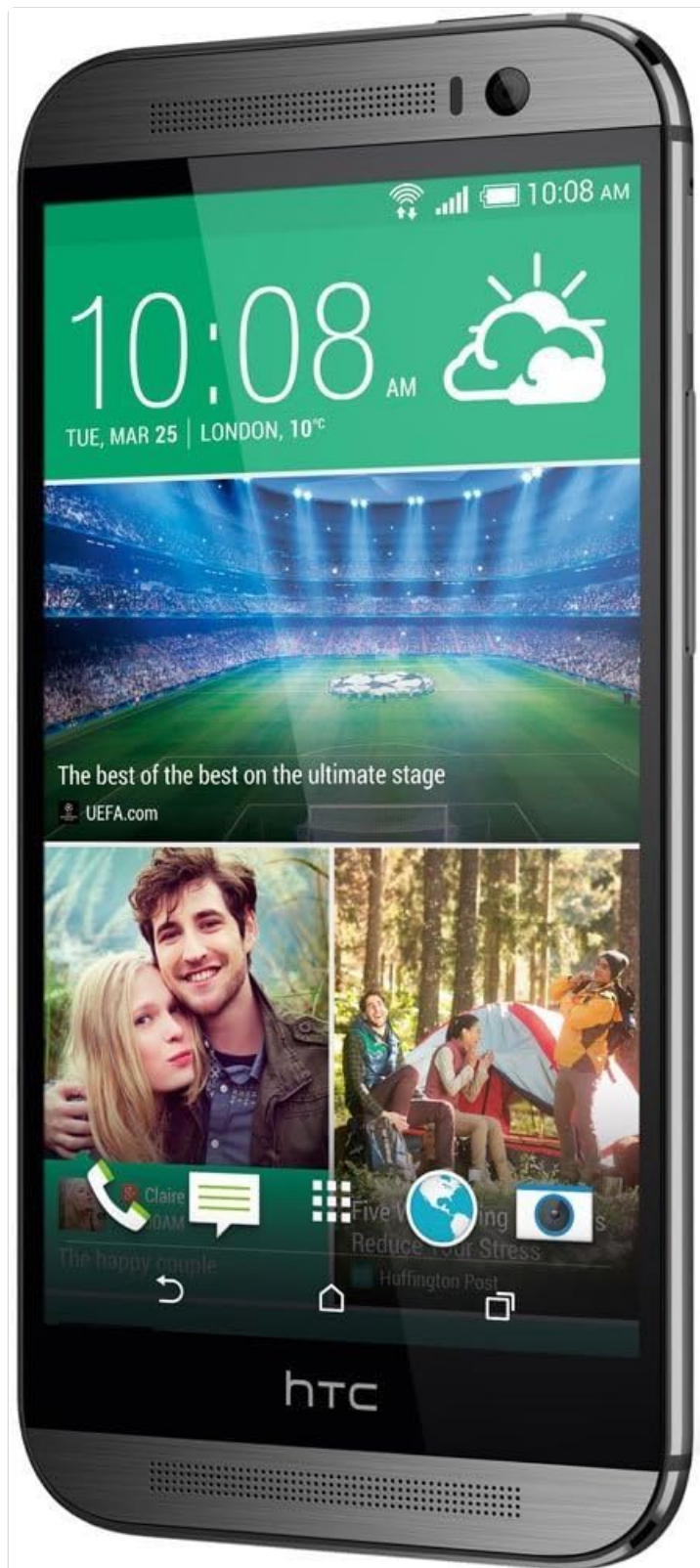
Figure 2.4: Angled front view of the HTC One M8s, displaying the active screen interface.