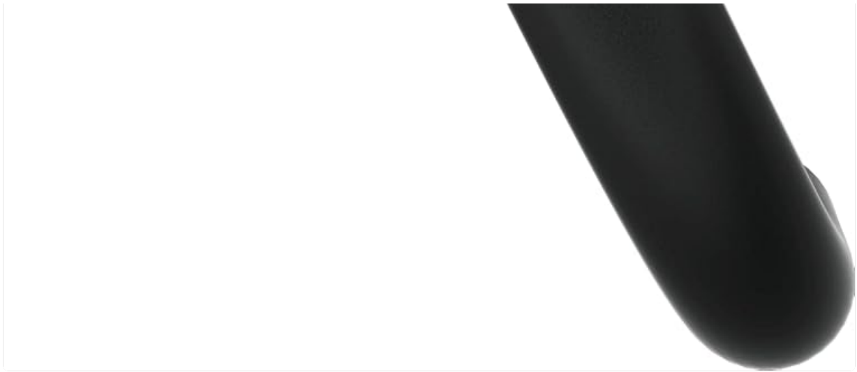
Figure 3.1: A detailed view of the faucet's base and control lever, highlighting its robust construction.