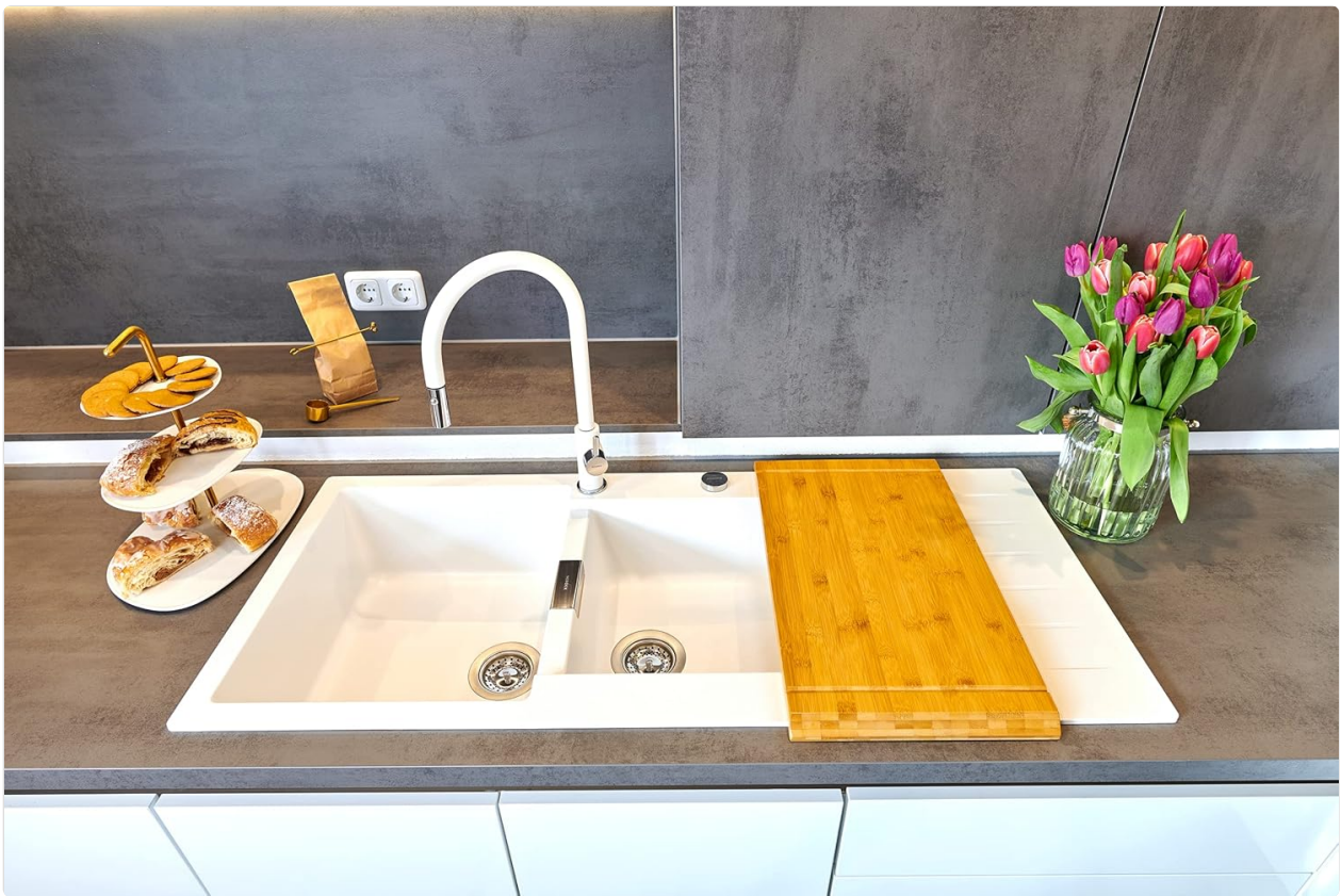
Figure 4.1: The Schock Hekate B549.120S faucet seamlessly integrated into a modern kitchen sink setup.