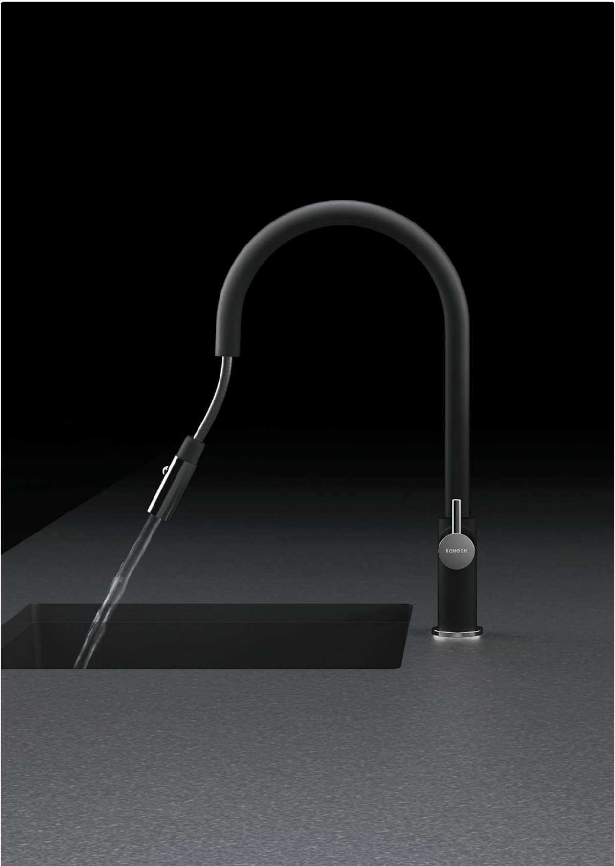
Figure 5.1: The faucet's pull-out spray head in action, illustrating the versatile spray function for various kitchen tasks.