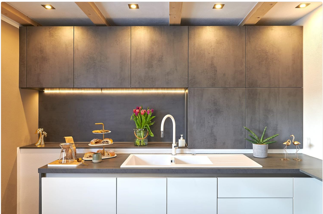
Figure 4.2: A wider perspective of the kitchen environment, showcasing the faucet's aesthetic appeal within the space.