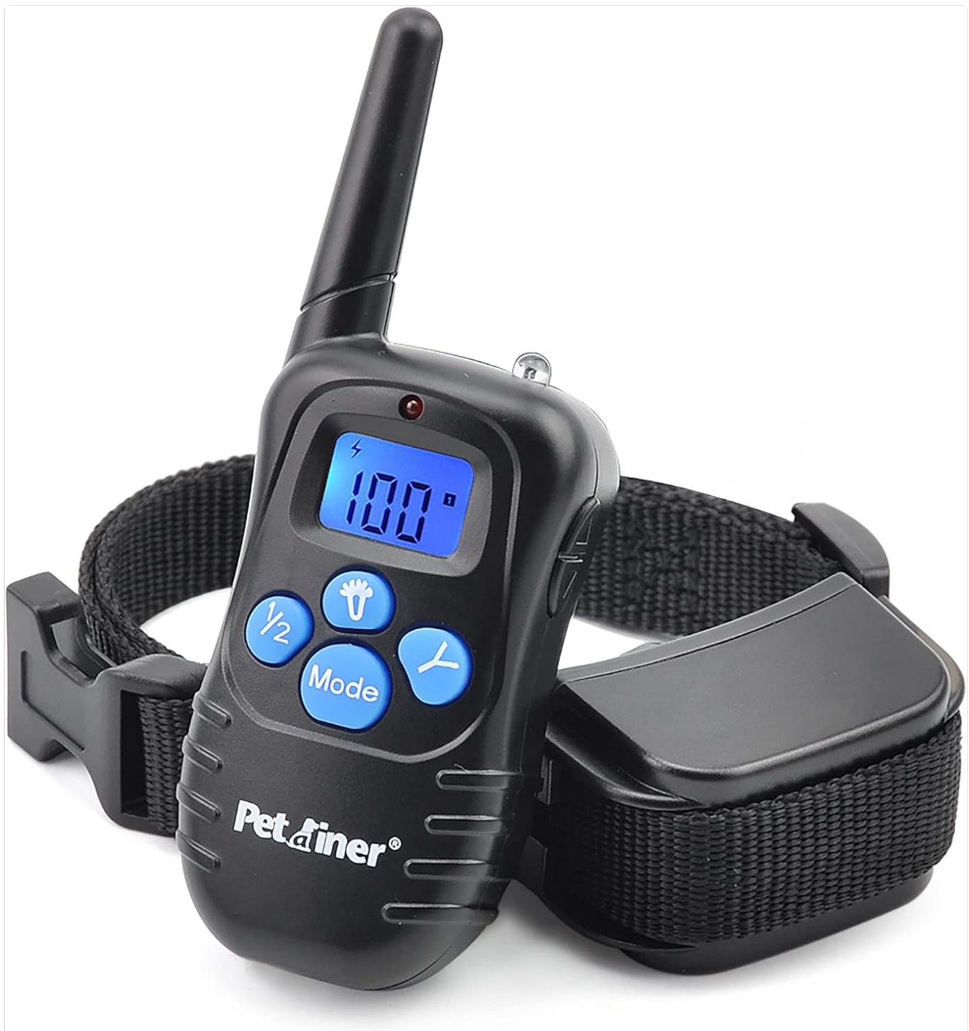
Figure 1.1: Pettrainer PET998DRB1 Remote Transmitter and Receiver Collar.