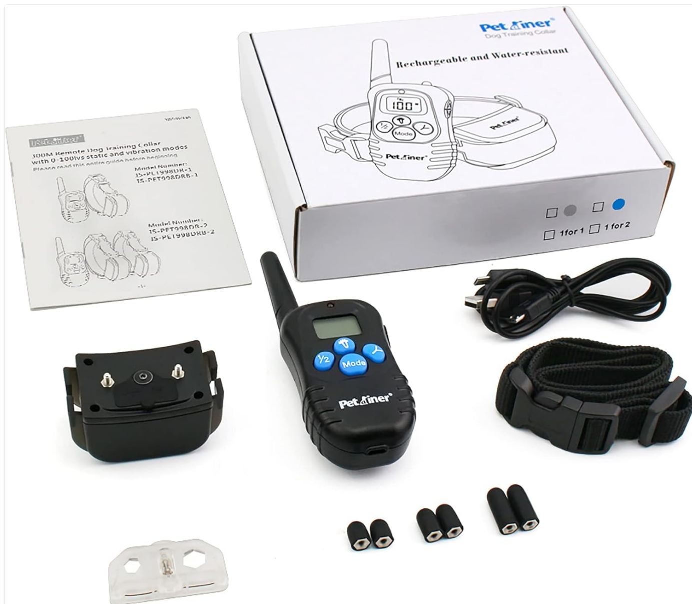
Figure 2.1: Package Contents of the Pet Trainer PET998DRB1.