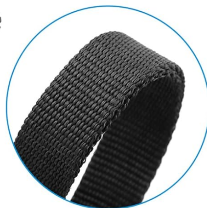
Figure 3.2: Adjustable Collar for All Dog Sizes.

Nylon Material - Protect Your Dog's Sensitive Skin ▶