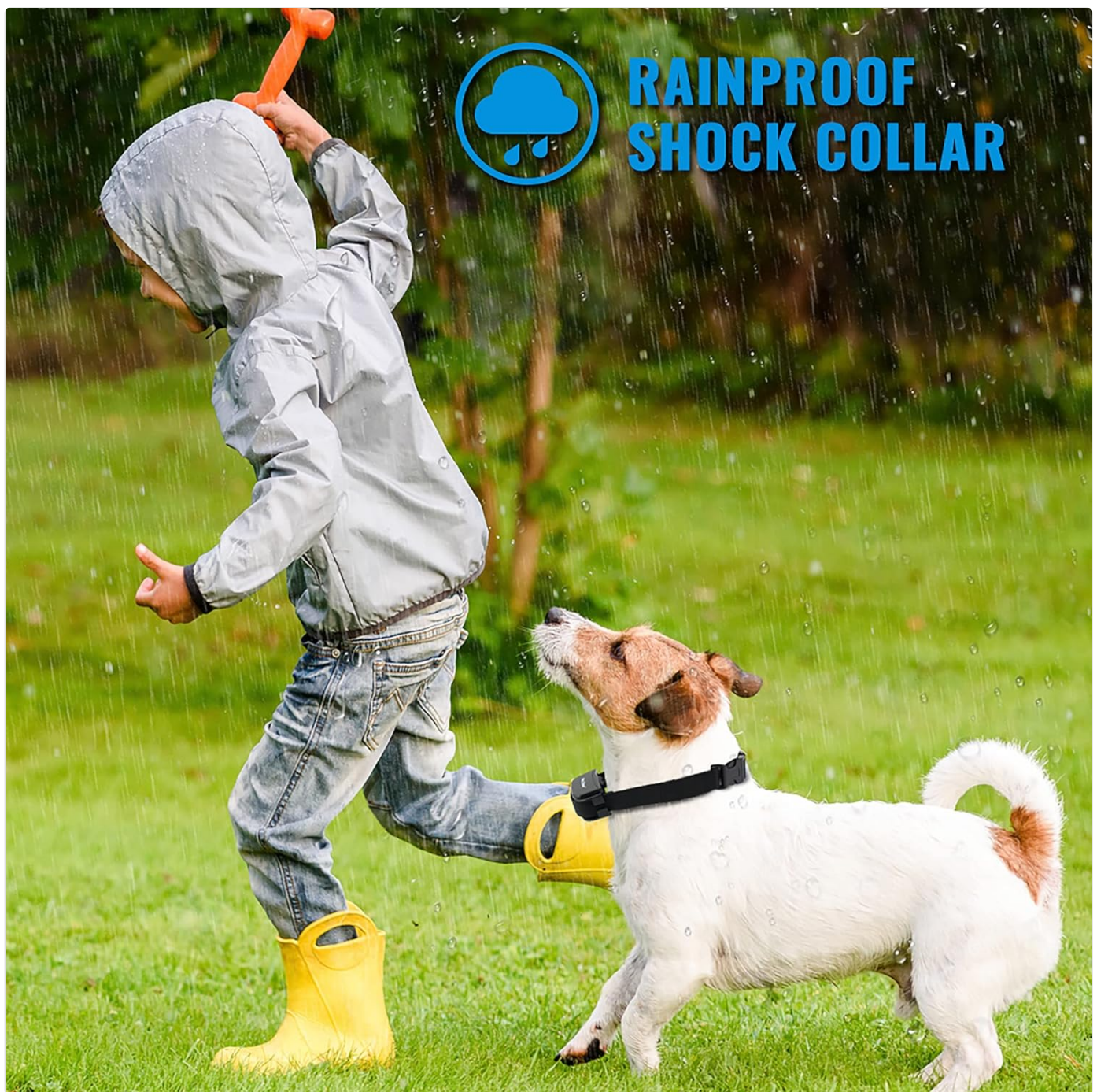
Figure 6.1: Rainproof Collar for Outdoor Use.