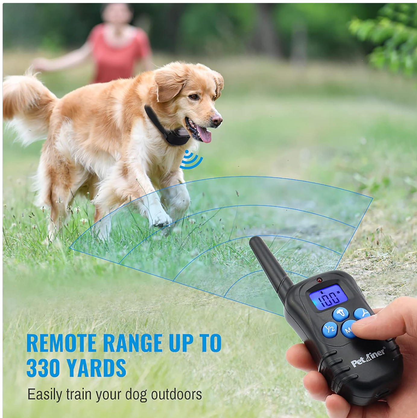
Figure 4.1: Remote Range up to 330 Yards.