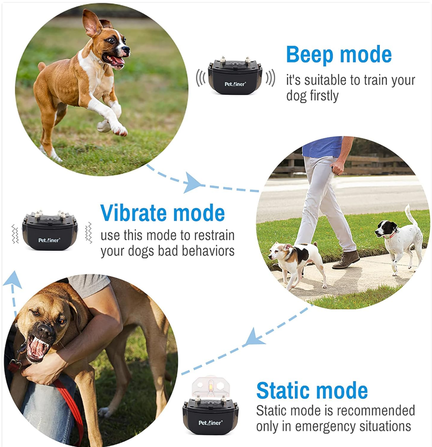
Figure 4.2: Overview of Training Modes.