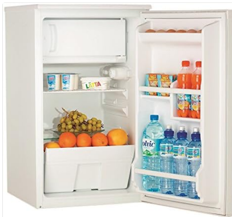
Image 5.1: Interior view of the integrated refrigerator, showing shelves, door compartments, and vegetable crisper.