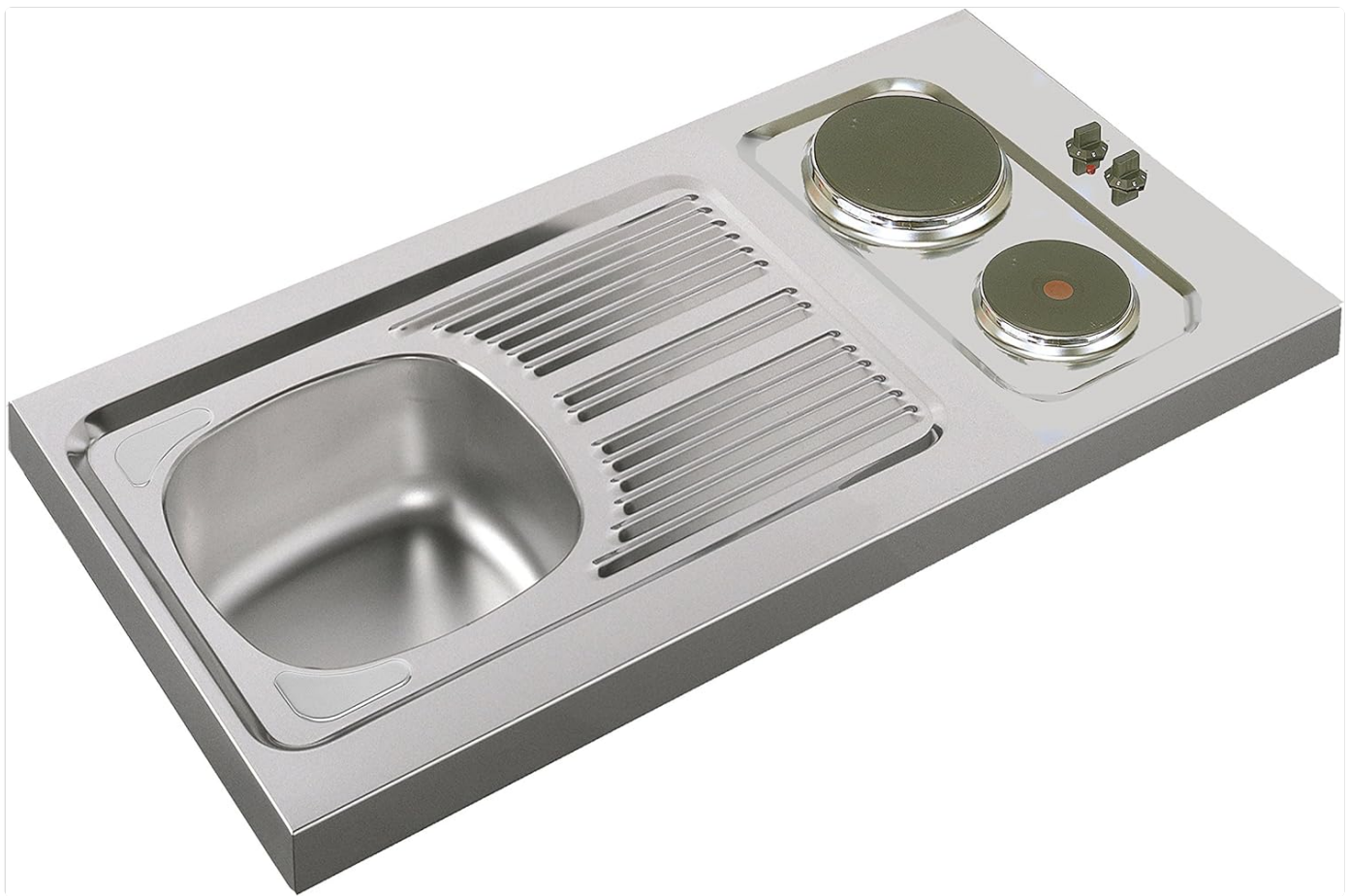
Image 4.1: The integrated stainless steel cooktop and sink unit. This component is installed into the cabinet countertop.