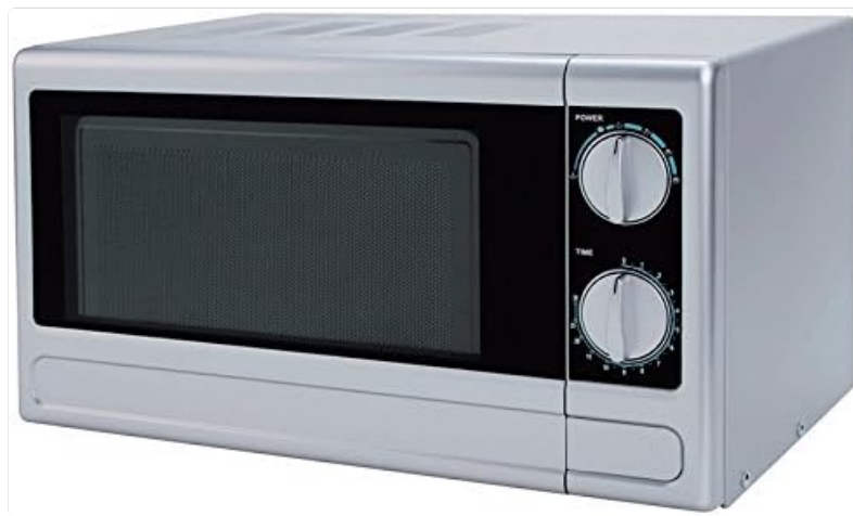
Image 5.2: The integrated microwave oven with control dials for power and time.