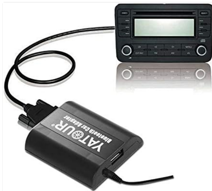
Image: The Yatour Bluetooth Adapter module connected to a car radio unit, demonstrating the physical connection.