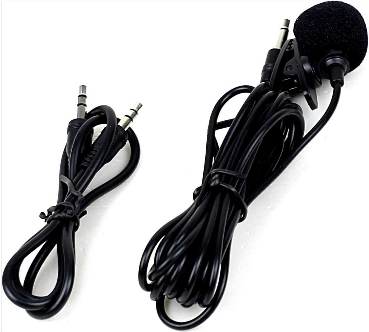
Image: The external microphone and AUX cable provided with the Yatour Bluetooth Adapter, essential for hands-free calling and auxiliary audio input.