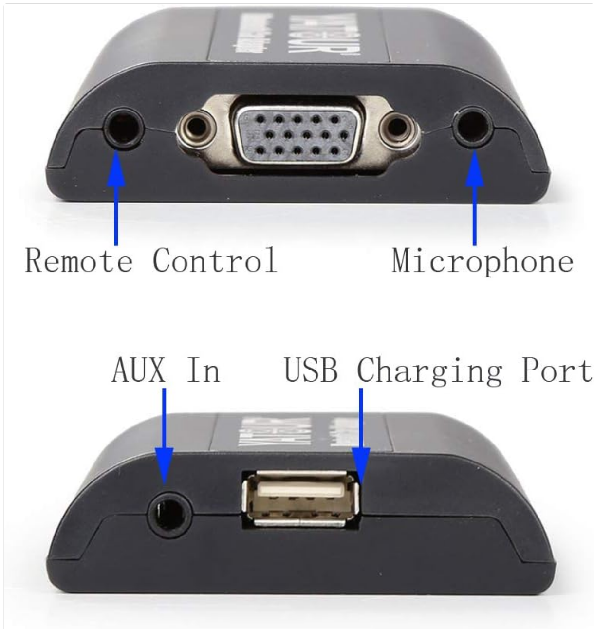
Image: Close-up view of the Yatour Bluetooth Adapter showing the various ports for remote control, microphone, AUX input, and USB charging.