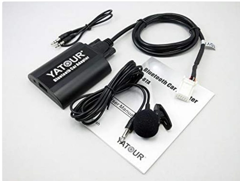
Image: All components included in the package, including the adapter module, cables, and microphone.