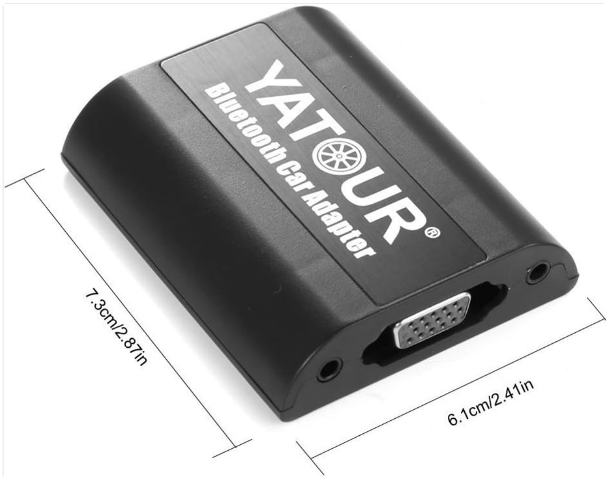
Image: The Yatour Bluetooth Car Adapter module with its dimensions labeled as 7.3cm/2.87in and 6.1cm/2.41in.