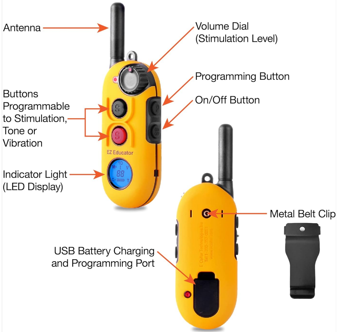
Figure 4: Labeled diagram of the EZ-900 ergonomic remote transmitter, highlighting key controls and features.