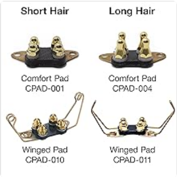
Figure 3: Comfort pads and winged pads designed for optimal contact on short and long-haired dogs.