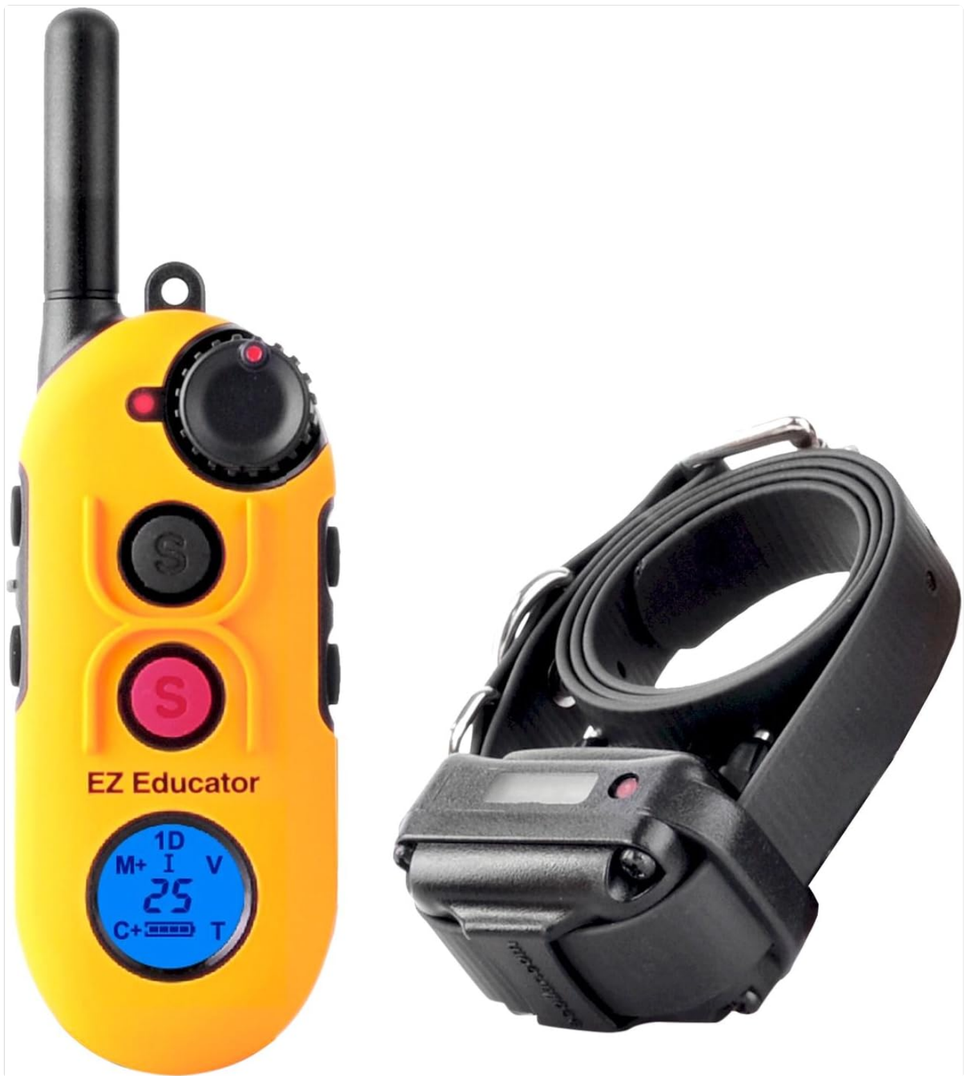
Figure 1: Overview of the Educator EZ-900 remote transmitter and collar receiver.