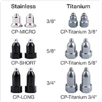
Figure 2: Various contact point sizes (3/8", 5/8", 3/4") in stainless steel and titanium for different coat lengths.

snugly between the contact point and your dog's skin. Select the appropriate contact points (5/8" or 3/4") based on your dog's coat length. Longer contact points are generally used for dogs with thicker coats to ensure proper contact. Use the provided contact removal tool to install or change the contact points.