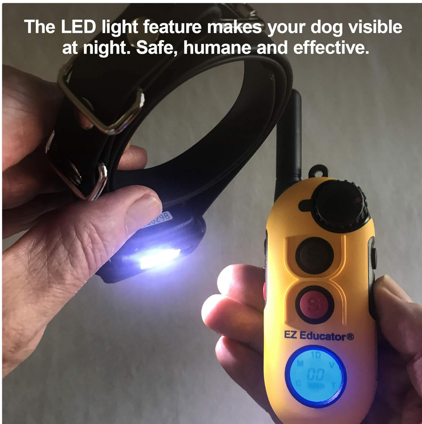
Figure 7: The collar's LED light feature, providing visibility for your dog at night.

The LED light feature makes your dog visible at night. Safe, humane and effective.