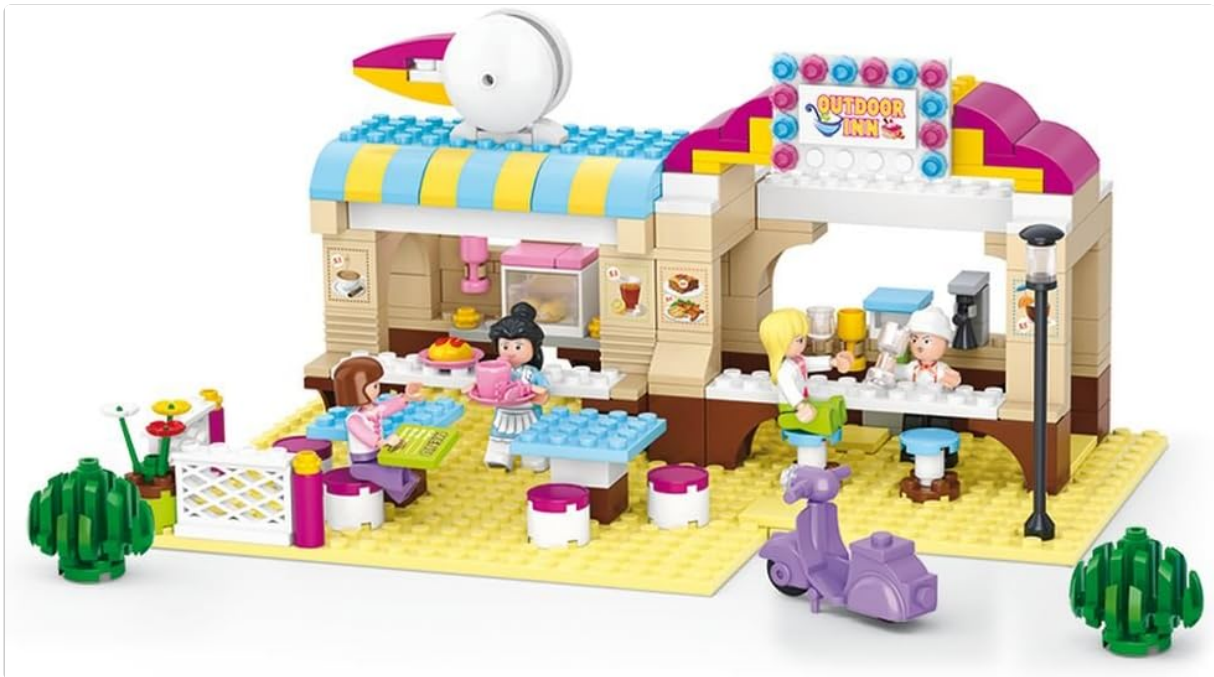
Image: The fully assembled Sluban Girls Dream Restaurant, showcasing its modular design, colorful details, and included figures with a scooter.

Thank you for choosing the Sluban M38-B0530 Girls Dream Restaurant Building Set. This set allows you to construct a vibrant and detailed modular restaurant using 257 high-quality building blocks. Designed for creative play, this set encourages imagination and spatial awareness. Please read this manual carefully before beginning assembly to ensure a smooth and enjoyable building experience.