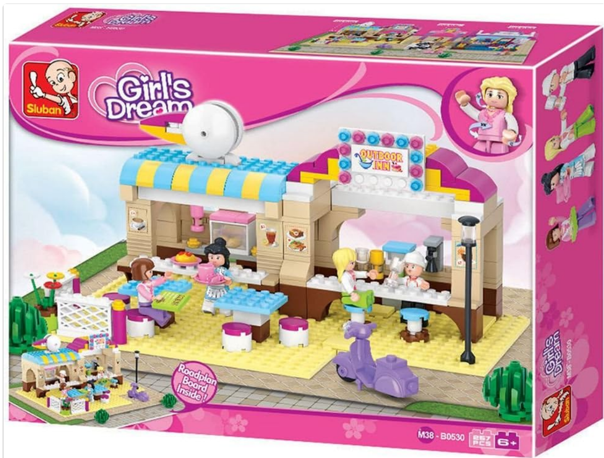
Image: The product packaging for the Sluban Girls Dream Restaurant, displaying the assembled model, included figures, and the "Girl's Dream" branding.