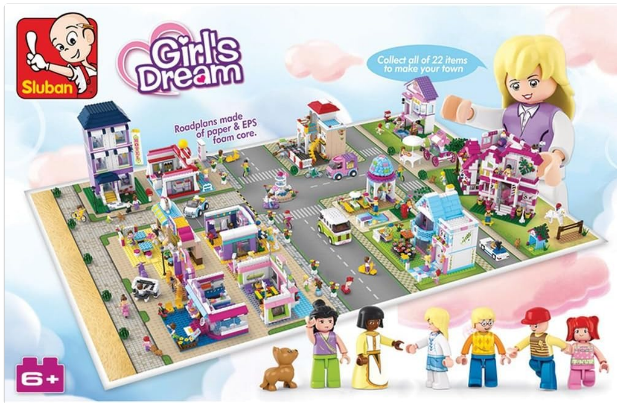
Image: An expansive city scene constructed from various Sluban Girls Dream modular sets, demonstrating the potential for creative expansion and interconnected play.