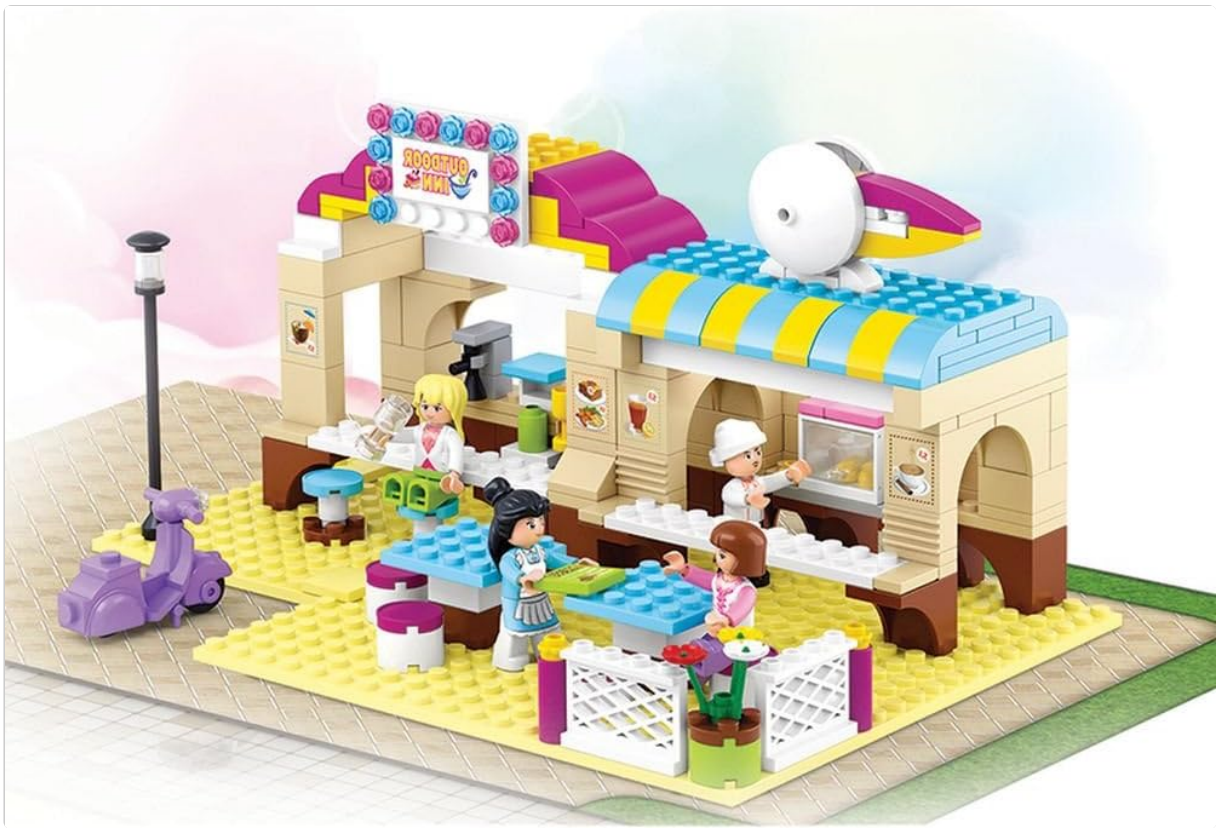
Image: A detailed view of two mini-figures at a blue table, demonstrating the interactive elements of the assembled restaurant.