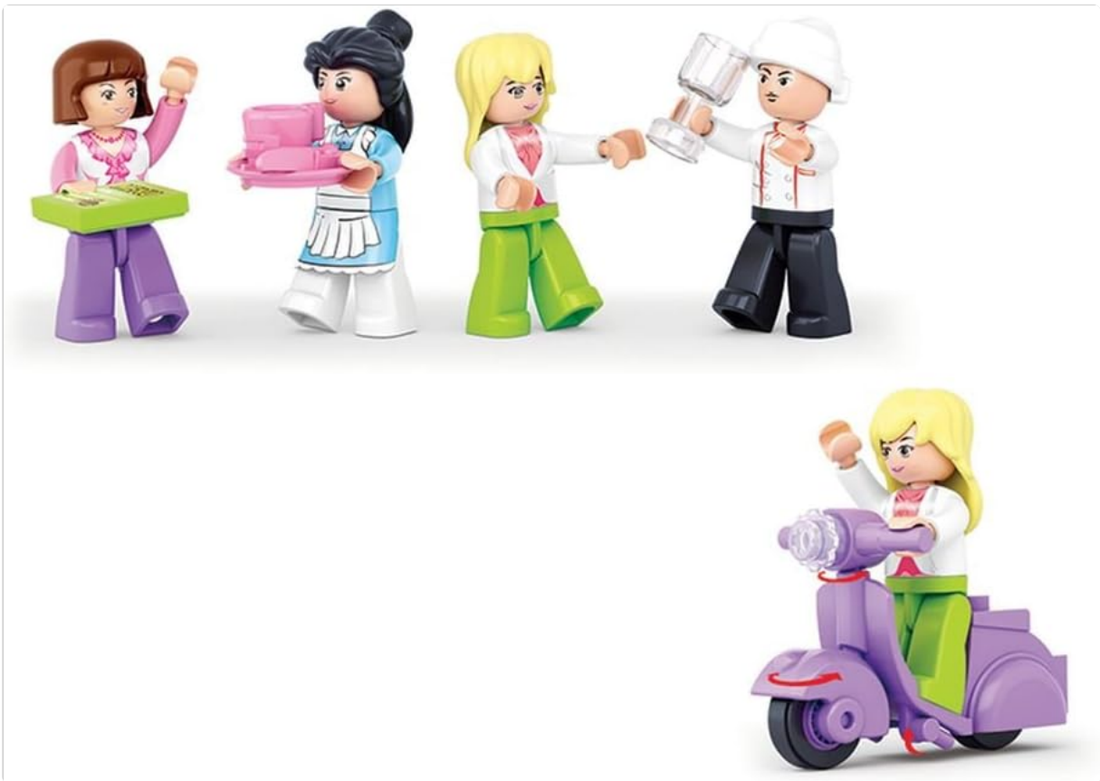
Image: A close-up view of the four included mini-figures: a chef, three girls, one of whom is riding a purple scooter.