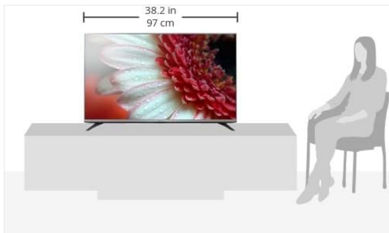
Image: Scale diagram of the LG 43LF5400 TV, showing its size relative to a person and indicating a width of 38.2 inches.