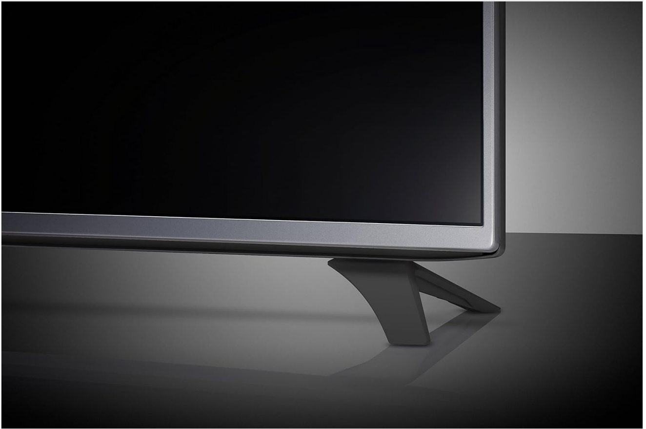
Image: Close-up view of the TV's stand, showing how it connects to the bottom frame.