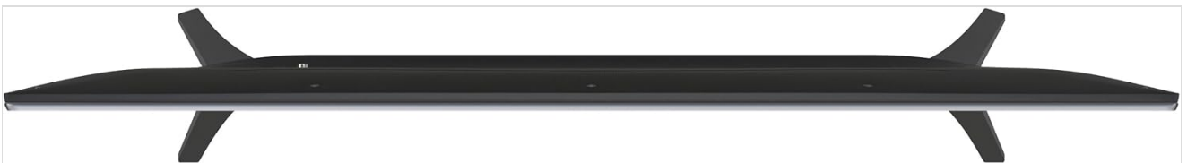
Image: Top-down view of the LG 43LF5400 TV with the stand legs visible at each end.