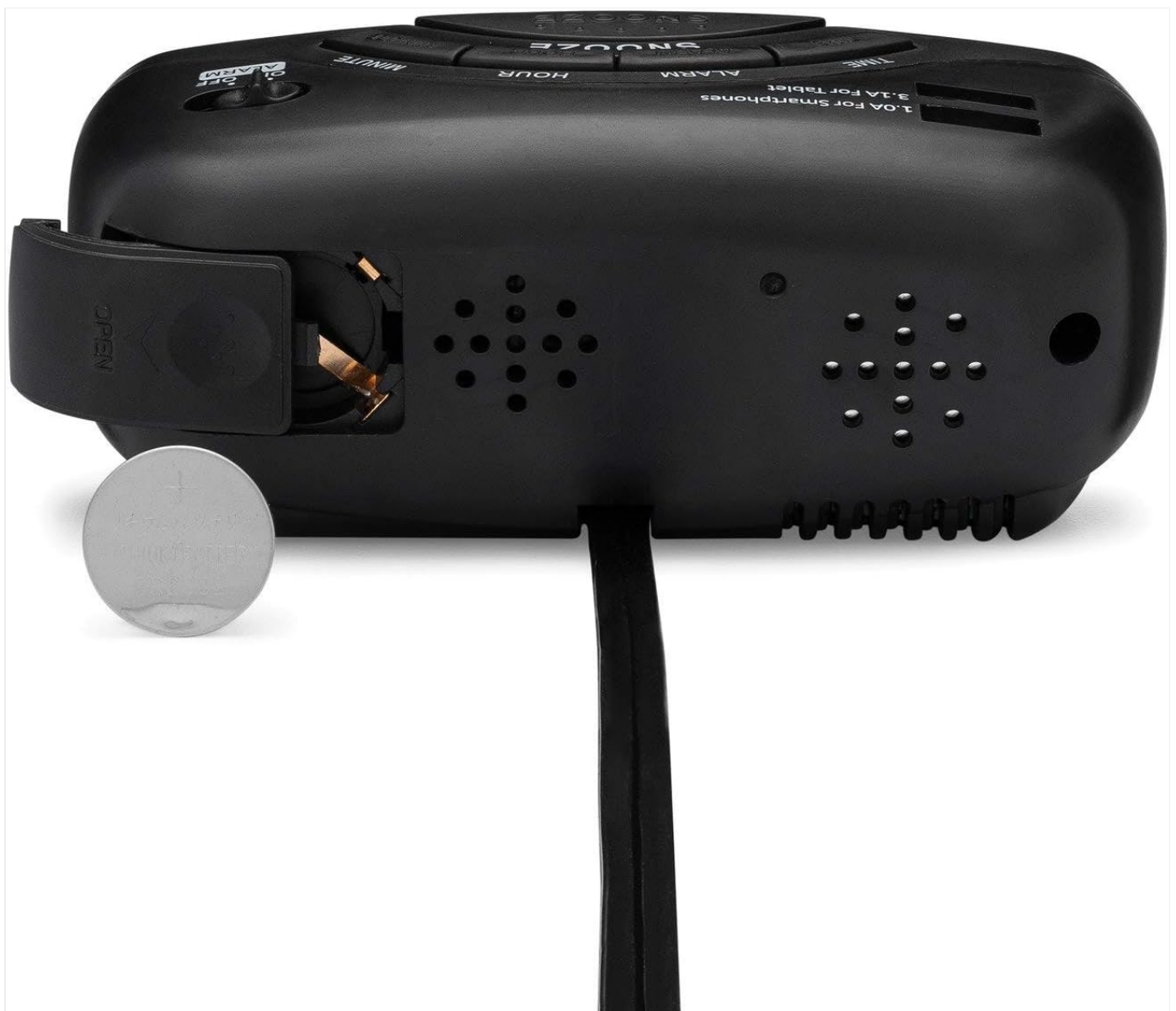
Image 3: Back view of the Sonnet T-1949 Digital LED Alarm Clock. The battery compartment is open, revealing the slot for a button cell