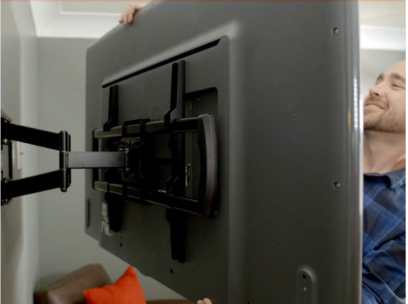
Image: A close-up view of the two vertical mounting brackets securely attached to the back of a flat-screen television, ready for wall mounting.