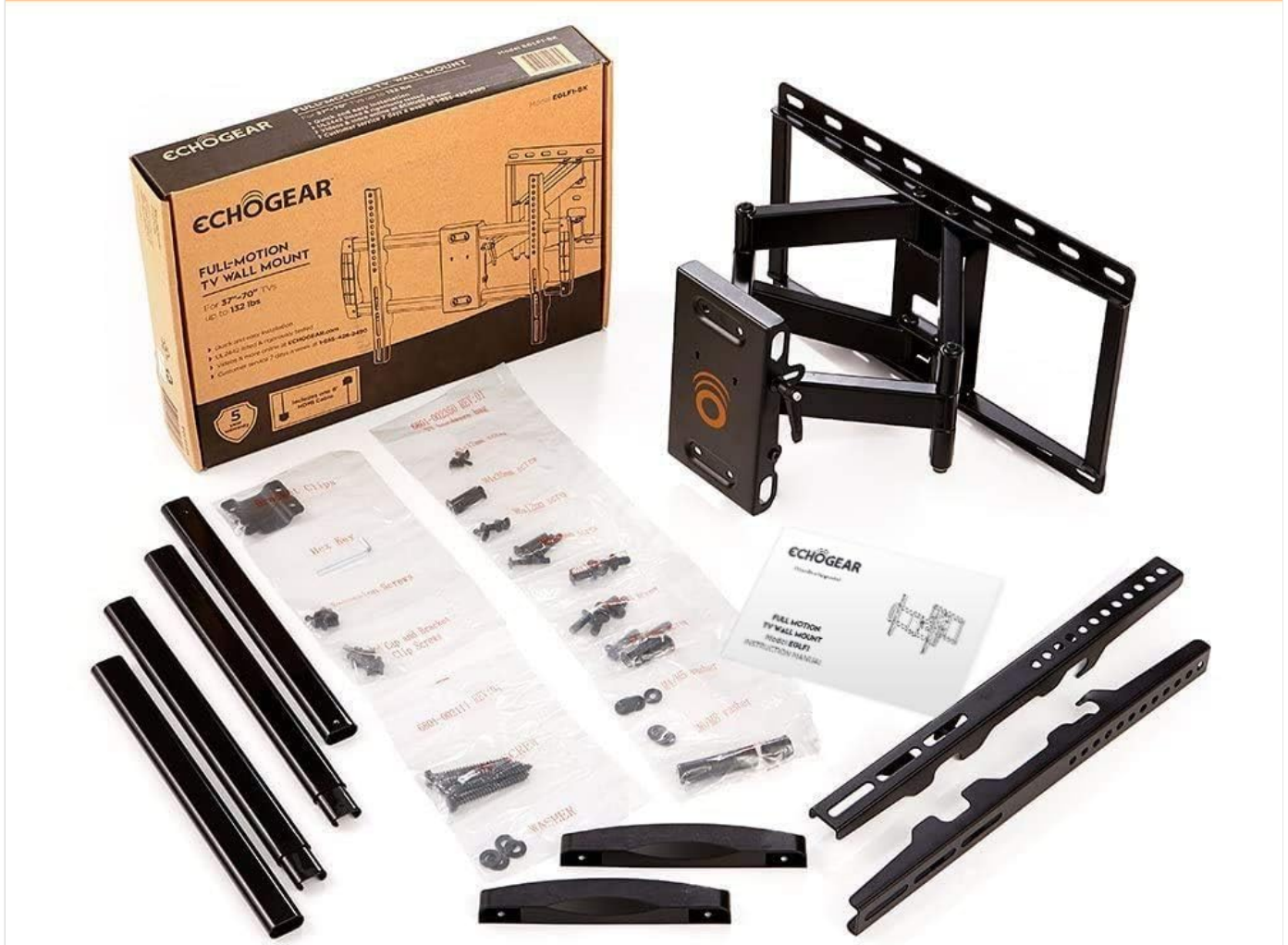
Image: All components included in the ECHOGEAR Full Motion TV Wall Mount package, neatly laid out. This includes the main mount assembly, TV brackets, various screws, spacers, and an instruction manual.