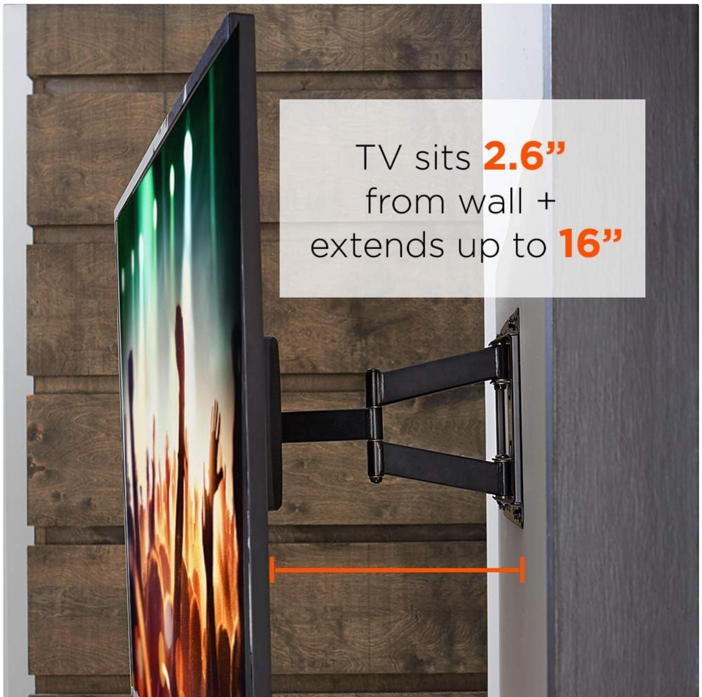
Image: A side profile of the TV mount, illustrating its ability to extend the television up to 16 inches from the wall, providing ample space for cable management and articulation.