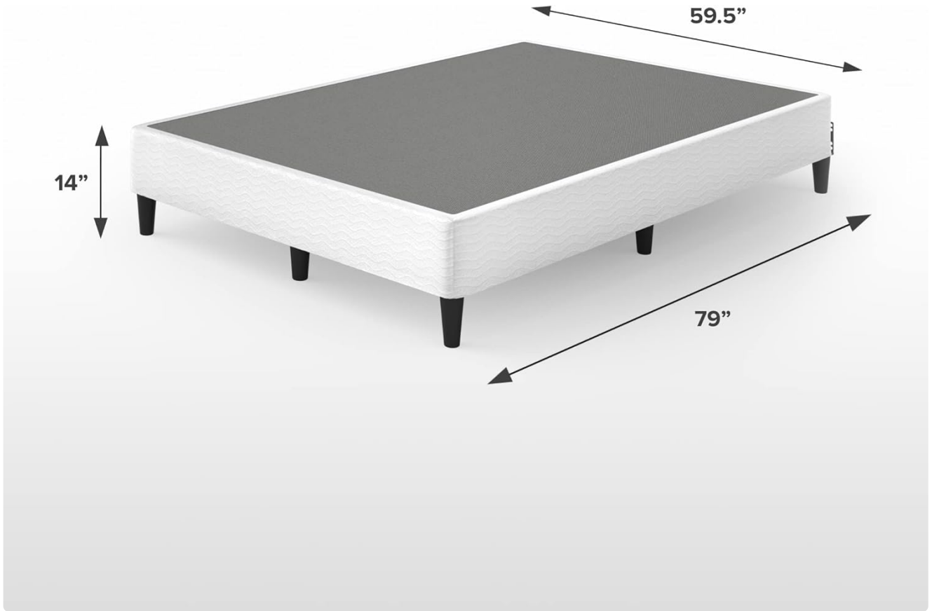
Image: Dimensional diagram of the Zinus Keenan Queen Metal Mattress Foundation.