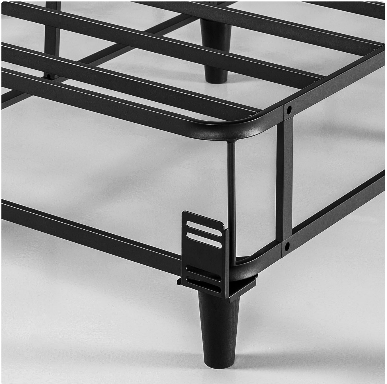
Image: A close-up view of the headboard bracket integrated into the frame's leg attachment point.