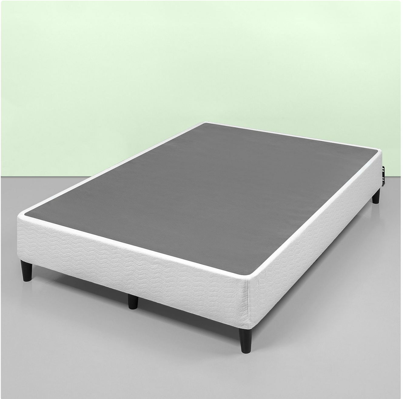
Image: The Zinus Keenan Queen Metal Mattress Foundation with a mattress placed directly on its surface, ready for use.

Once assembled, simply place your mattress directly on top of the Zinus Keenan Metal Mattress Foundation. The sturdy steel slats and non-slip fabric cover are designed to keep your mattress securely in place and provide optimal support.