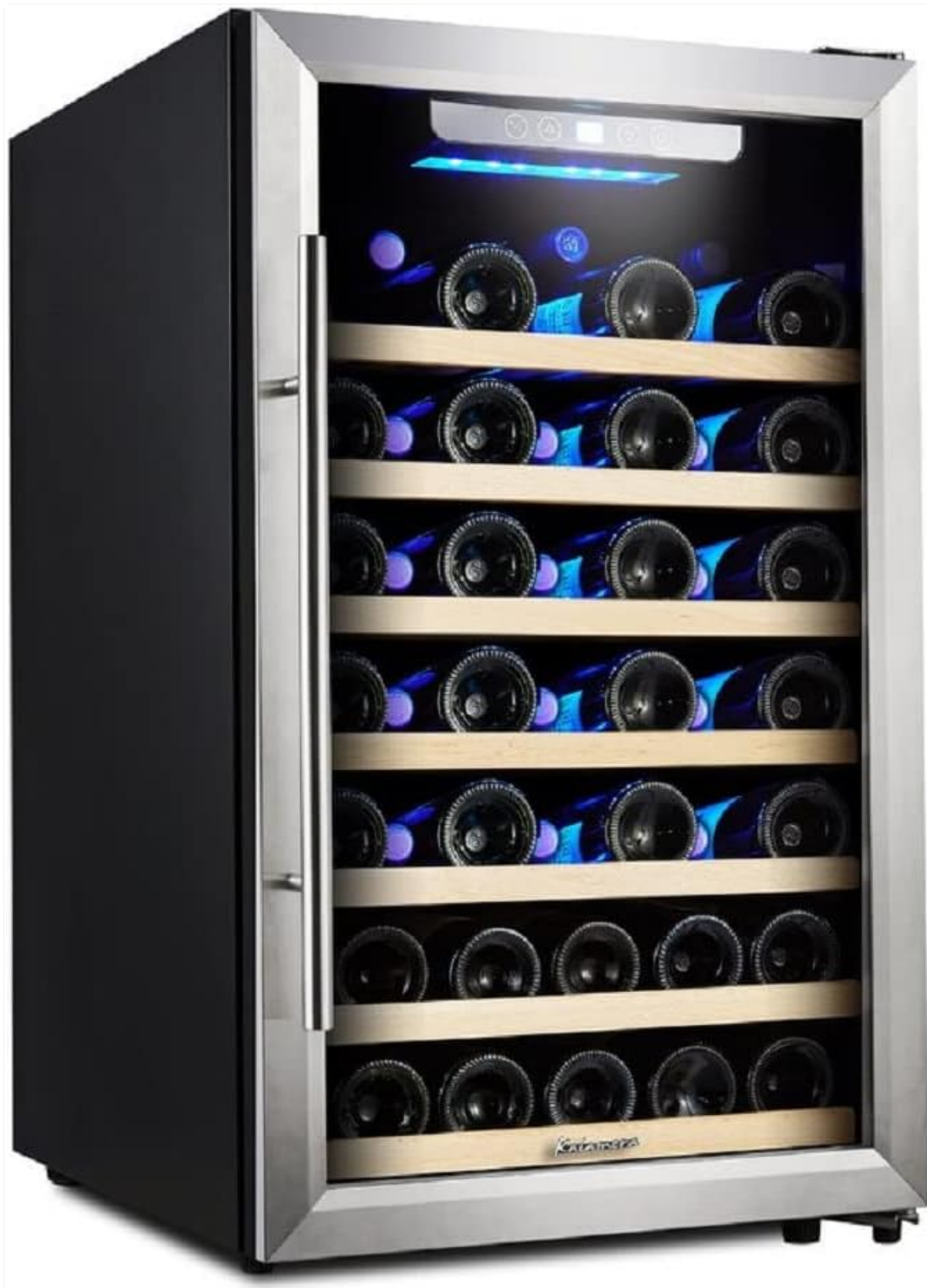
Front view of the Kalamera KRC-52SZF wine refrigerator.