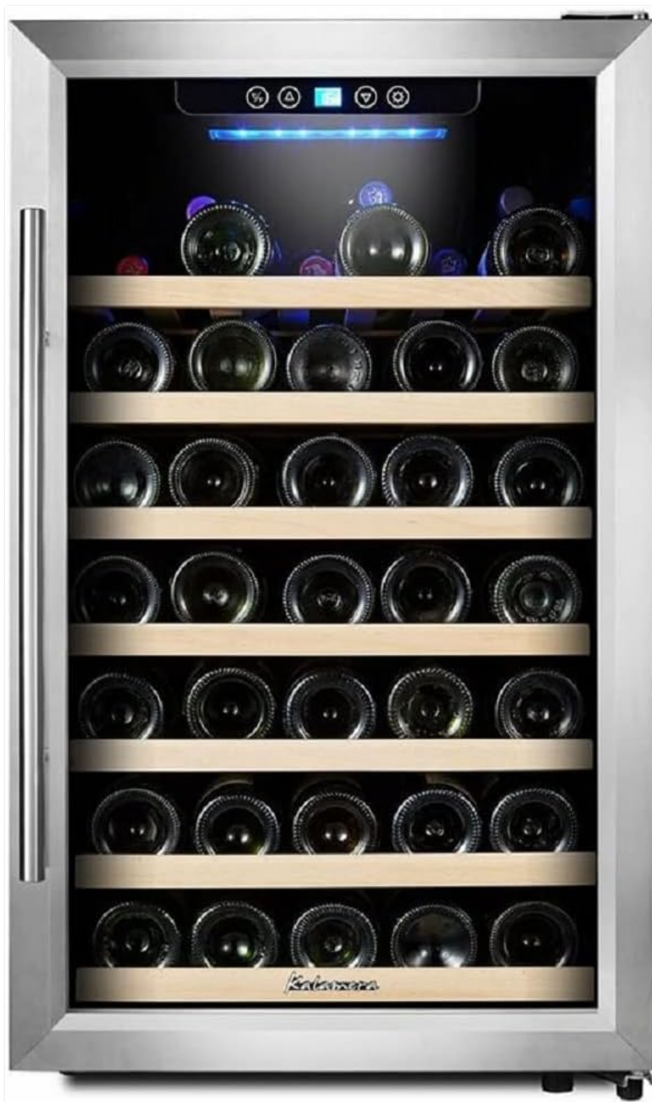
Interior view of the wine refrigerator showing wooden shelves.