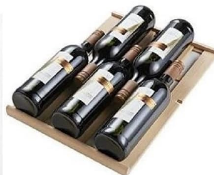
Diagram illustrating bottle loading capacity and shelf removal for larger bottles.