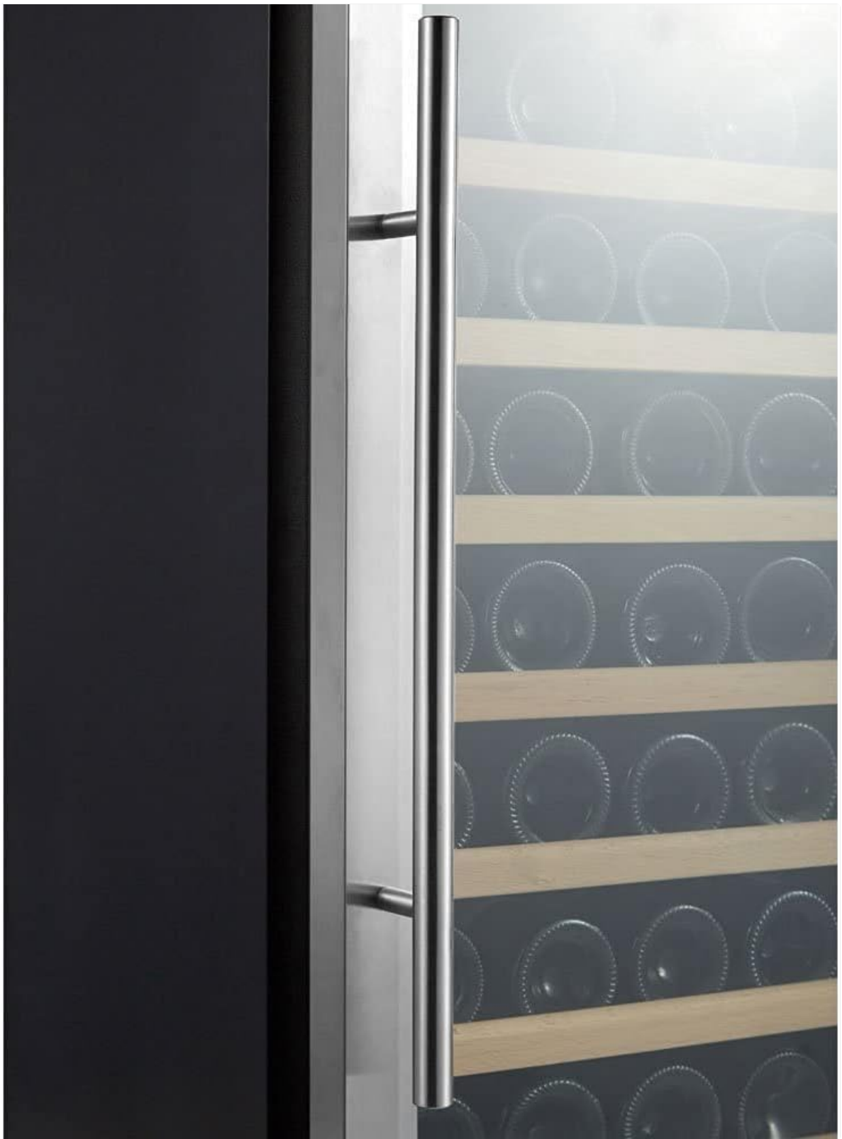
Interior view of the wine refrigerator with the door open, showing bottle arrangement.