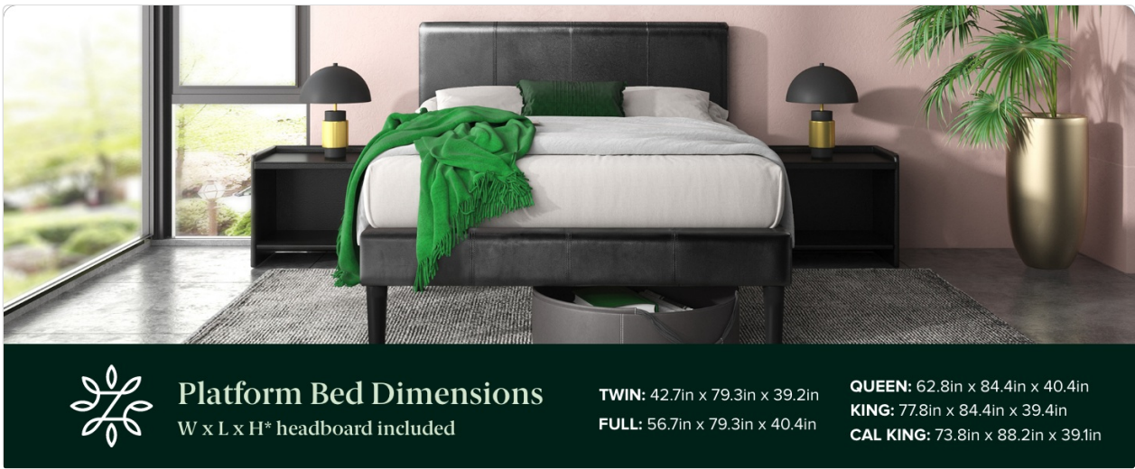
Image: A comprehensive diagram illustrating the dimensions (width, length, and headboard height) for various sizes of the ZINUS Gerard Platform Bed, including Full size.