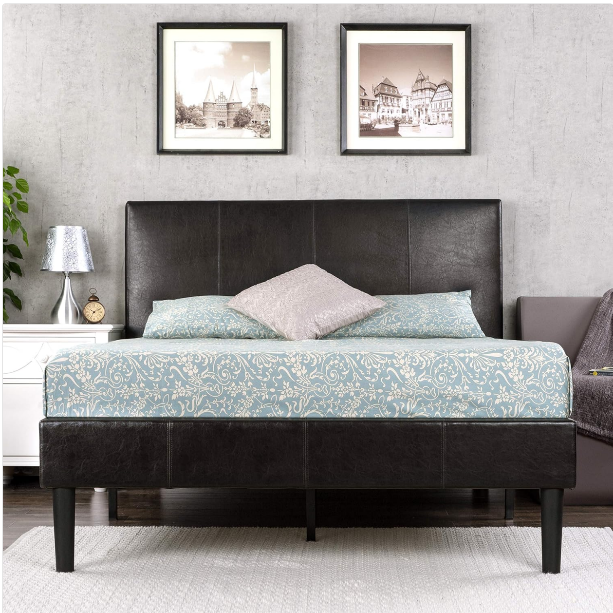
Image: The ZINUS Gerard Full Size Platform Bed Frame fully assembled with a mattress and bedding, showcasing its design and functionality.