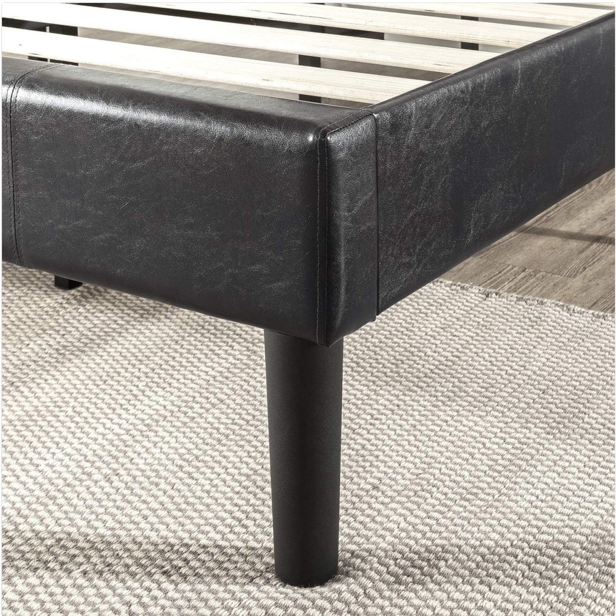
Image: Detail of the wood slats, showing the Velcro attachment system designed to prevent mattress movement and reduce noise.