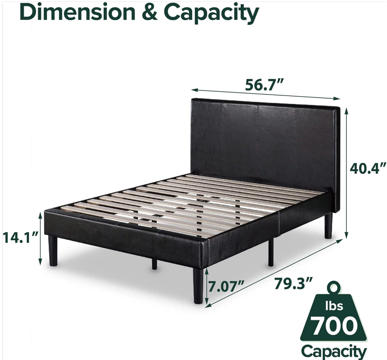
Image: A visual representation of the bed frame's dimensions (length, width, height, underbed clearance) and its maximum weight capacity of 700 lbs.

The frame provides approximately 7 inches of underbed clearance, offering convenient space for storage.