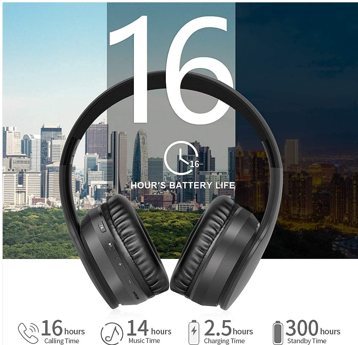
Image: Visual representation of the LOBKIN S19's battery performance, showing 16 hours calling time, 14 hours music time, 2.5 hours charging time, and 300 hours standby time.

A fully charged headset provides approximately 14 hours of music playback or 16 hours of call time.