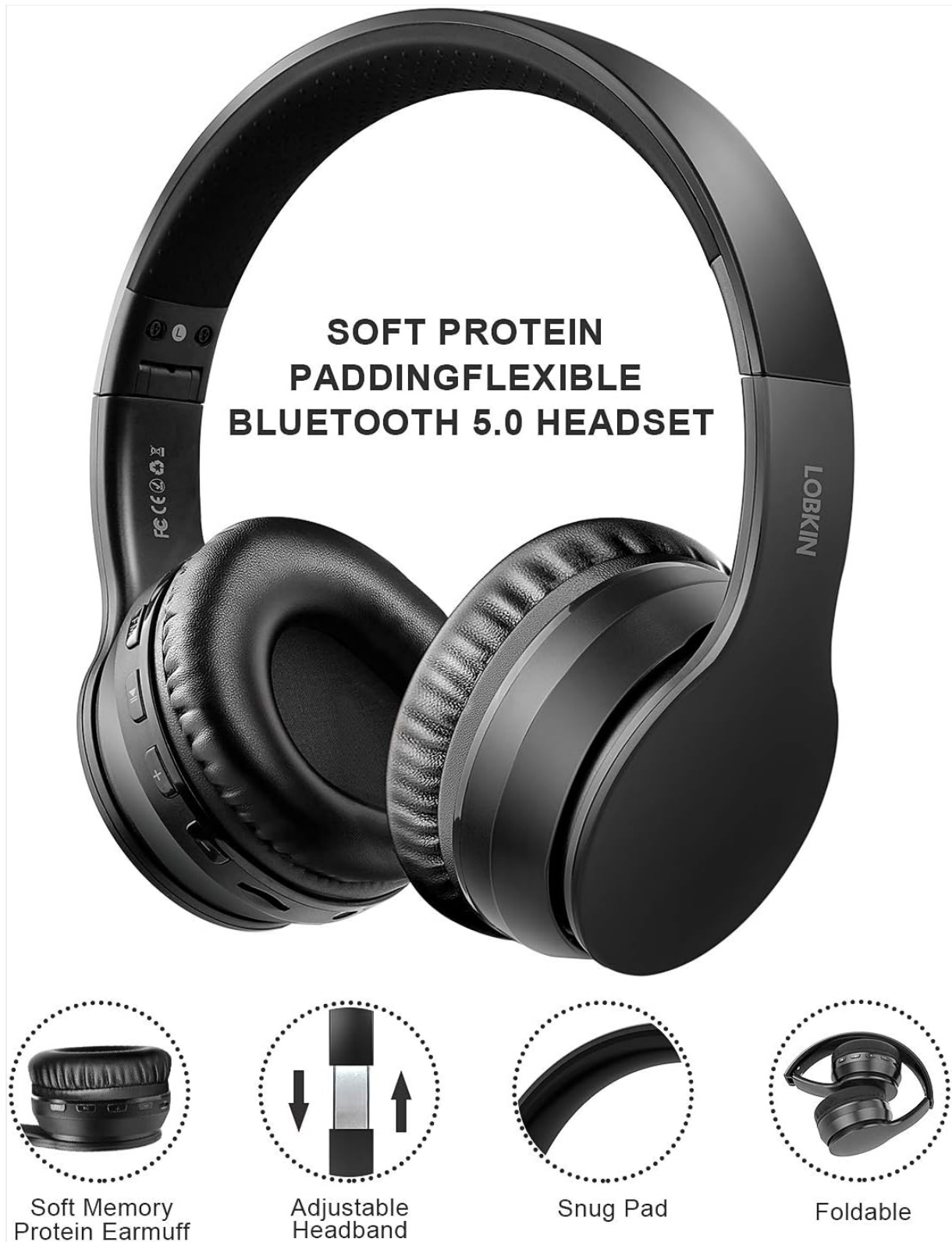
Image: The LOBKIN S19 headset highlighting its soft protein earmuffs, adjustable headband, snug fit, and foldable design for portability.