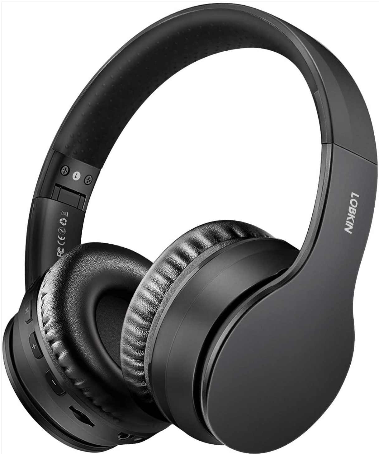
Image: The LOBKIN S19 Wireless Headset in black, showcasing its over-ear design and adjustable headband.