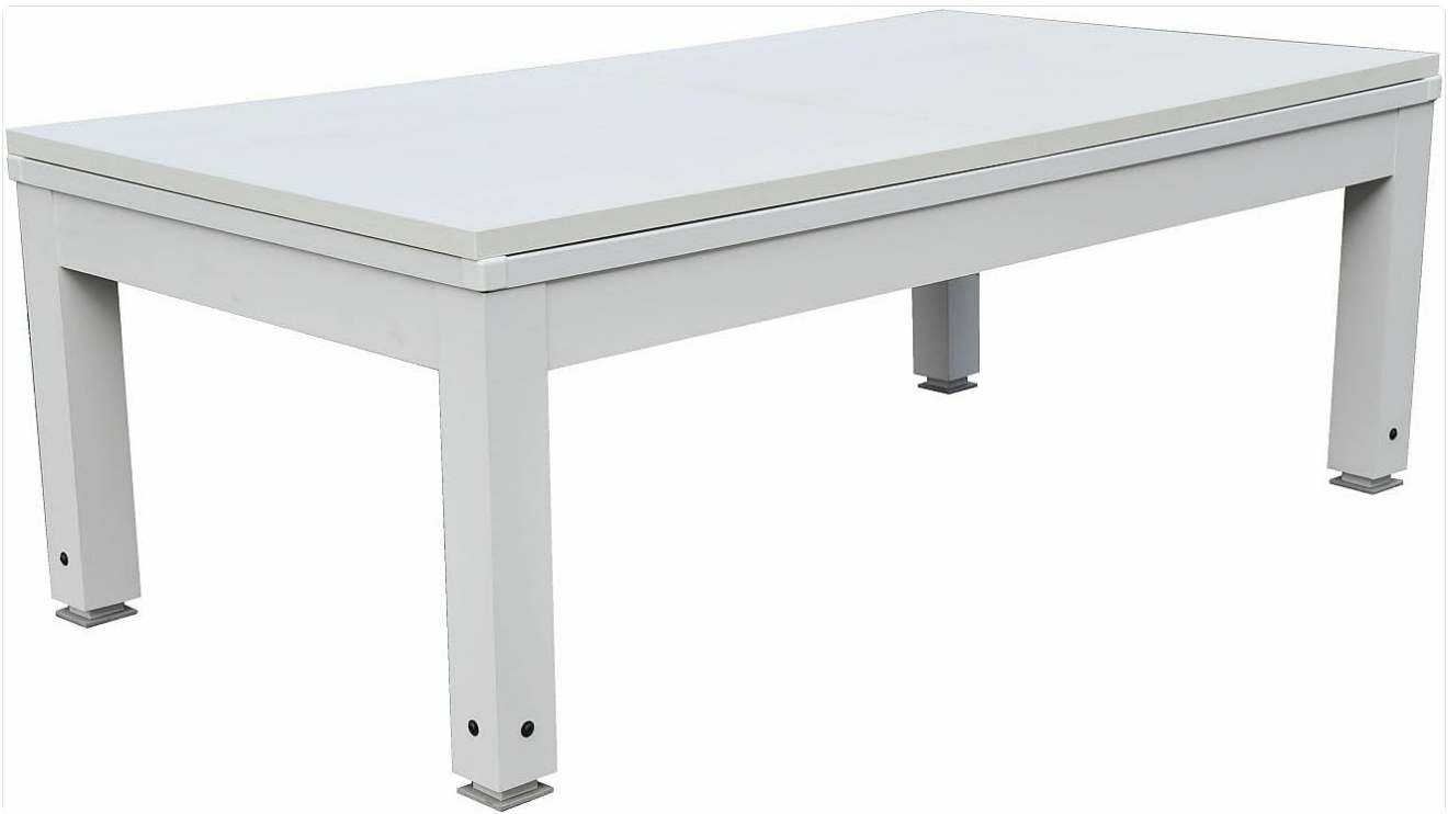
Figure 5.1.1: The billiard table transformed into a dining table with the tabletop panels covering the playing surface.