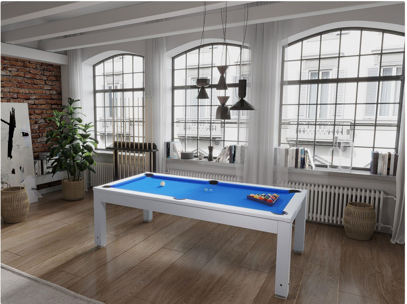
Figure 5.3.1: The Vente-unique Snooker Billiard Table in a home setting, ready for a game of billiards.