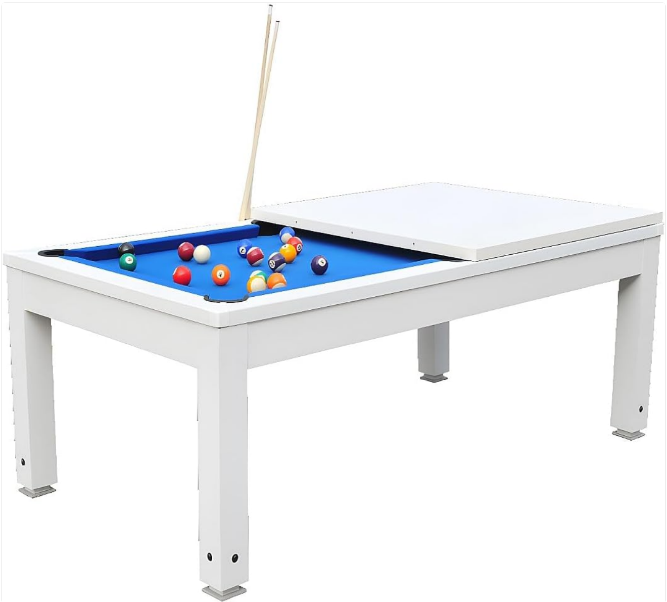
Figure 5.2.1: The convertible table with one panel removed, showing the billiard playing surface, balls, and cues.