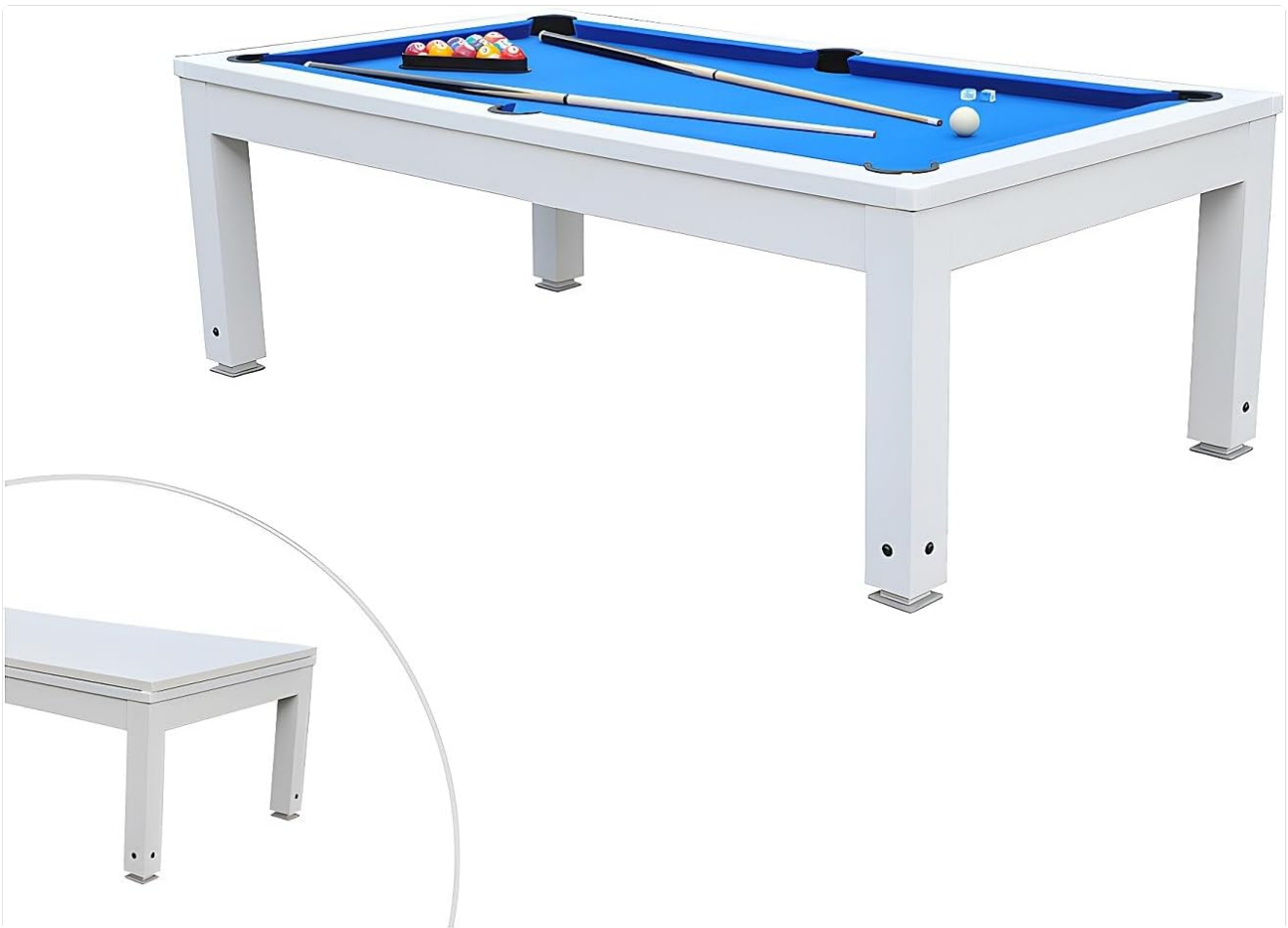
Figure 4.2.1: The Vente-unique Snooker Billiard Table with its legs securely attached, showcasing the white frame and blue playing surface.