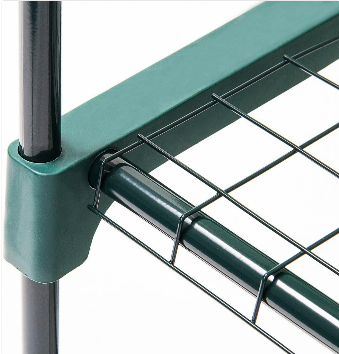
Figure 3: Detail of a shelf connection, illustrating how components click together.