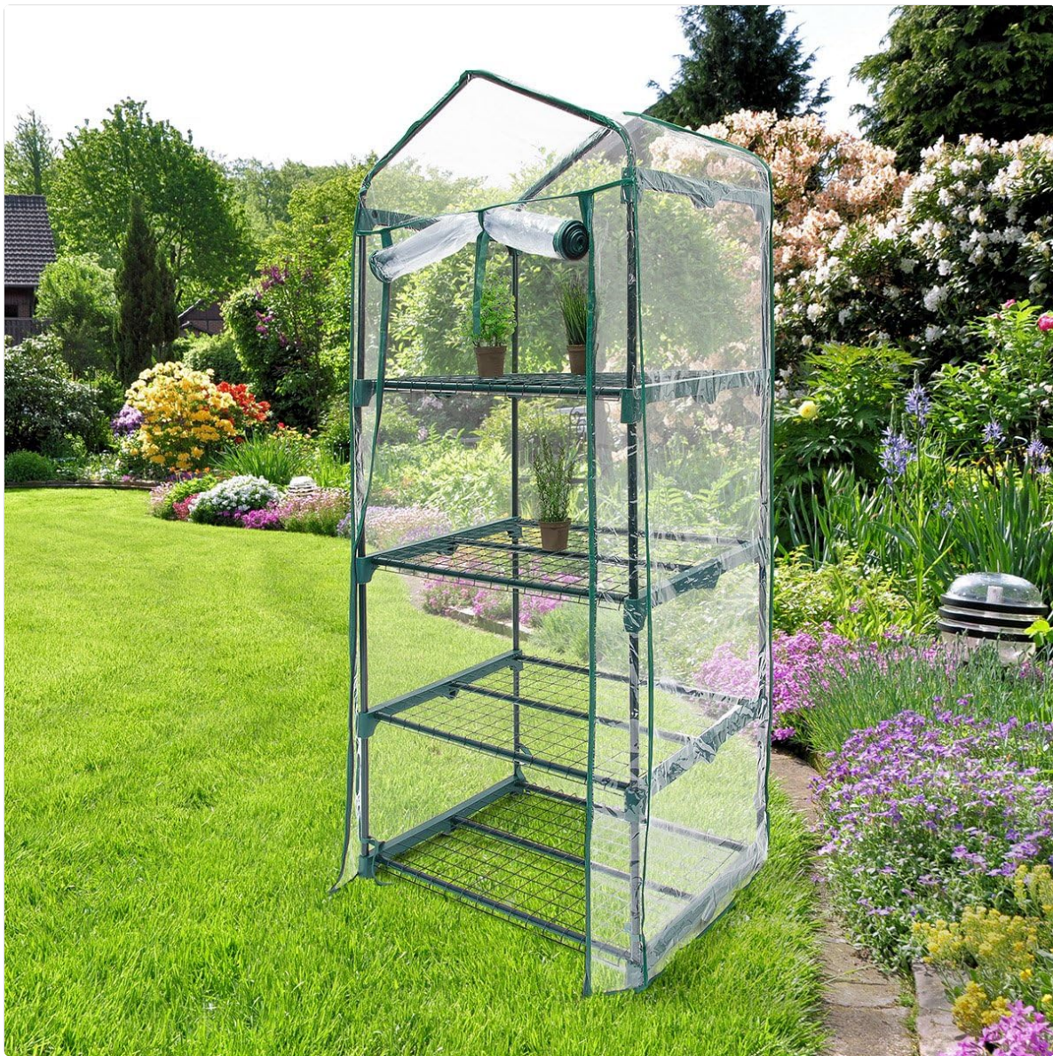
Figure 1: Overview of the Relaxdays 4-Tier Plant Cold Frame Greenhouse.

Key features include a transparent, robust cover, a roll-up door with two zippers, and a peaked roof designed to prevent water accumulation. The four tiers provide ample space for various plants.