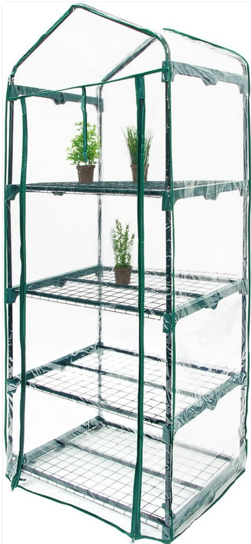
Figure 4: Interior view showing the four tiers with plants.