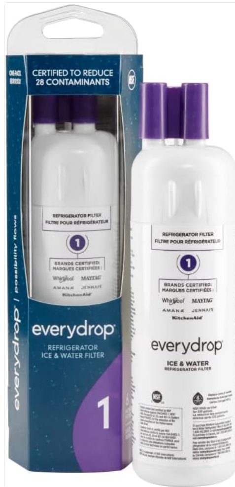
Image: The everydrop® filter removed from its packaging, ready for installation.