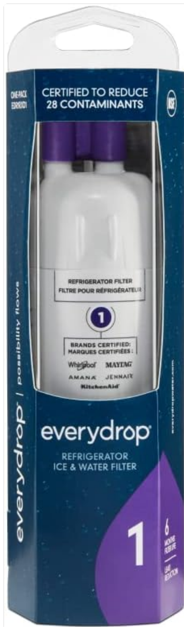
Image: everydrop® Ice and Water Refrigerator Filter 1 in its retail packaging.