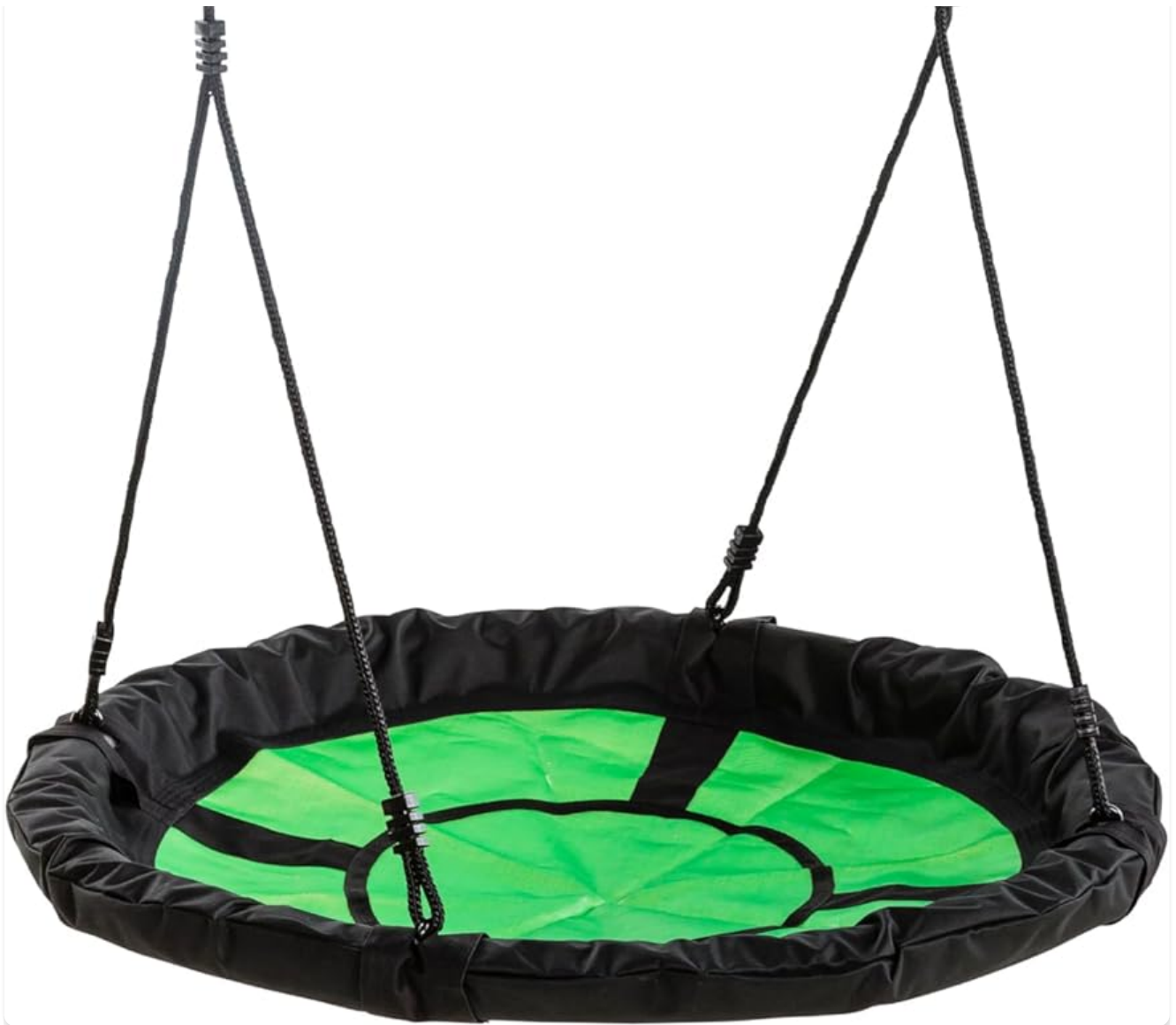
Image 1.1: The AXI Swibee 100 cm Nest Swing, featuring its black frame and green mesh seat, ready for installation.