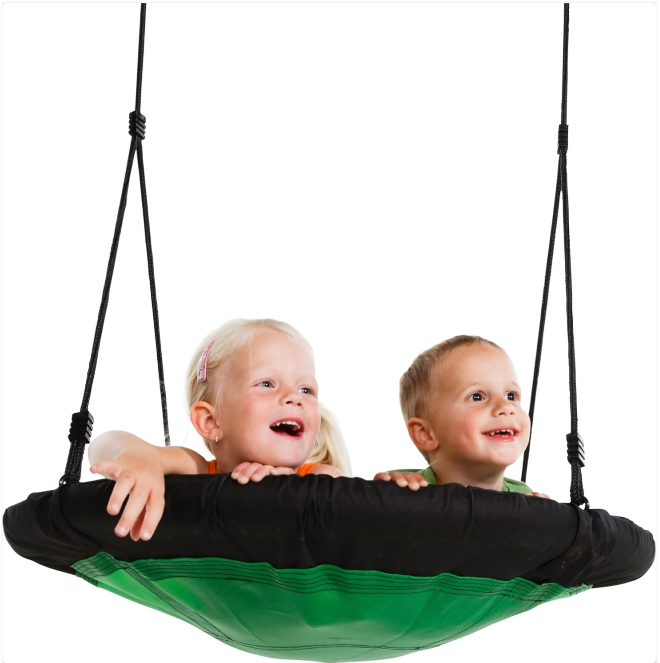
Image 4.3: Two children smiling and enjoying their time on the AXI Swibee Nest Swing, showcasing the fun and comfort it provides.