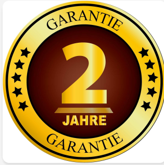
Image 8.1: Official 2-Year Warranty badge, signifying the product's coverage against manufacturing defects.

For technical support, warranty claims, or any questions regarding your AXI product, please contact AXI customer service through their official website or the retailer where you purchased the product.