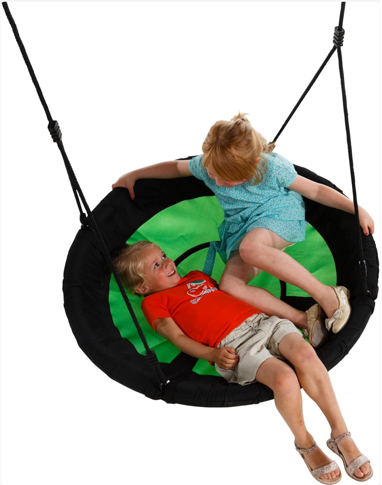
Image 4.2: Two children sharing the AXI Swibee Nest Swing, highlighting its capacity for multiple users.