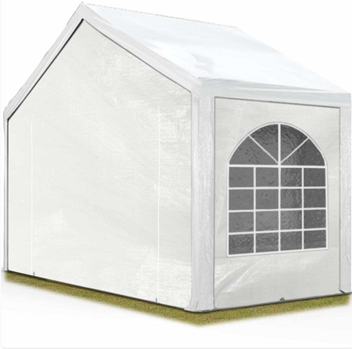
Figure 1: Assembled TOOLPORT 3x2m Party Tent in a garden setting.