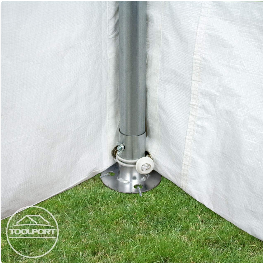
Figure 5: Foot plate anchoring detail.