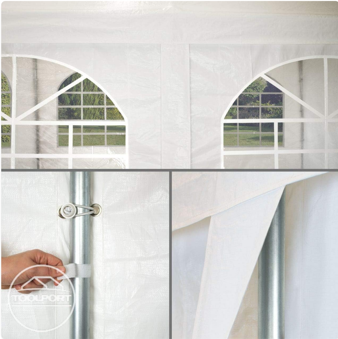
Figure 4: Side panel attachment and window design.