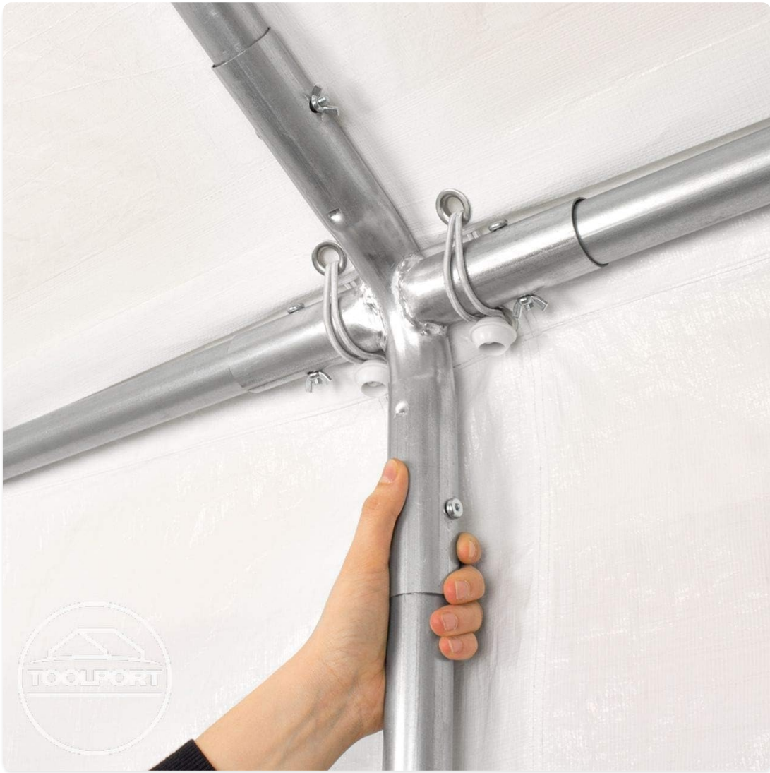
Figure 3: Detail of the bolted frame connection.