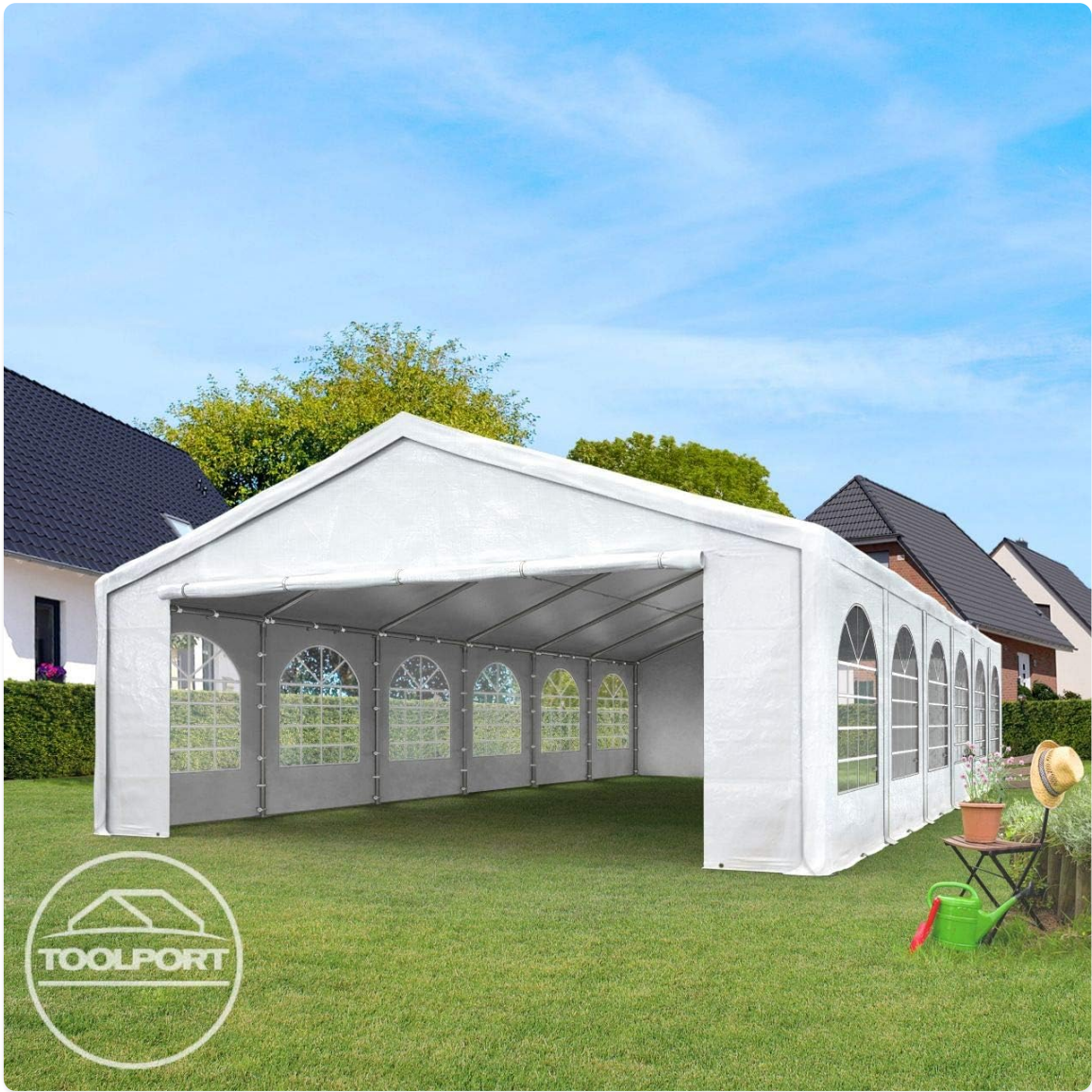
Figure 6: Tent with side panels open, suitable for good weather.