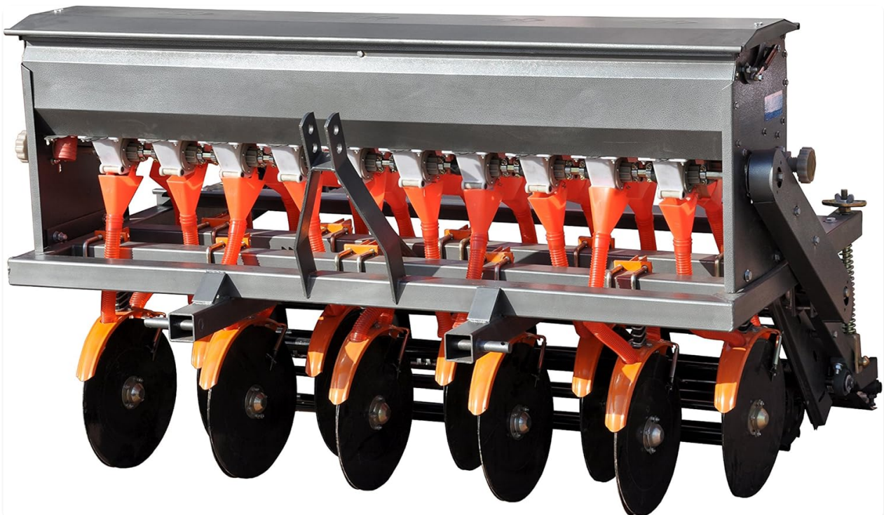
Image 1: Front-side view of the Field Tuff FTF-603PTS 3-Point Seeder, showcasing its robust construction and multiple seeding rows.

The seeder is constructed for durability and reliability, ensuring long-term performance. It includes two boxes with closeable slides for precise seed distribution.