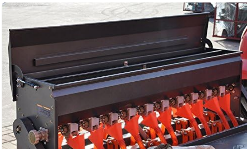
Image 2: Top view of the seeder with hoppers open, ready for filling with seed or fertilizer.

The seeder includes two boxes with closeable slides. Fill the hoppers with your desired seed or food plot mix. Ensure the material is dry and free of debris to prevent blockages.