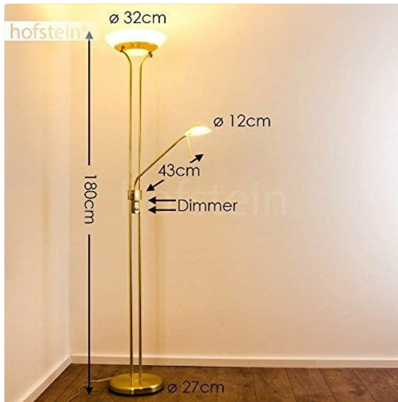
Figure 2: Dimensions of the Hofstein Biot LED Floor Lamp. The lamp stands 180 cm tall, with a main shade diameter of 32 cm and a base diameter of 27 cm. The reading arm extends 43 cm with a 12 cm shade diameter.