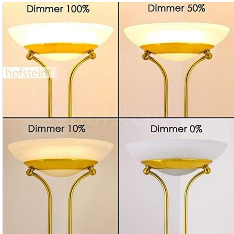
Figure 4: Illustration of different dimmer levels for the main uplight, ranging from 100% brightness to 0% (off), demonstrating the lamp's dimmable functionality.