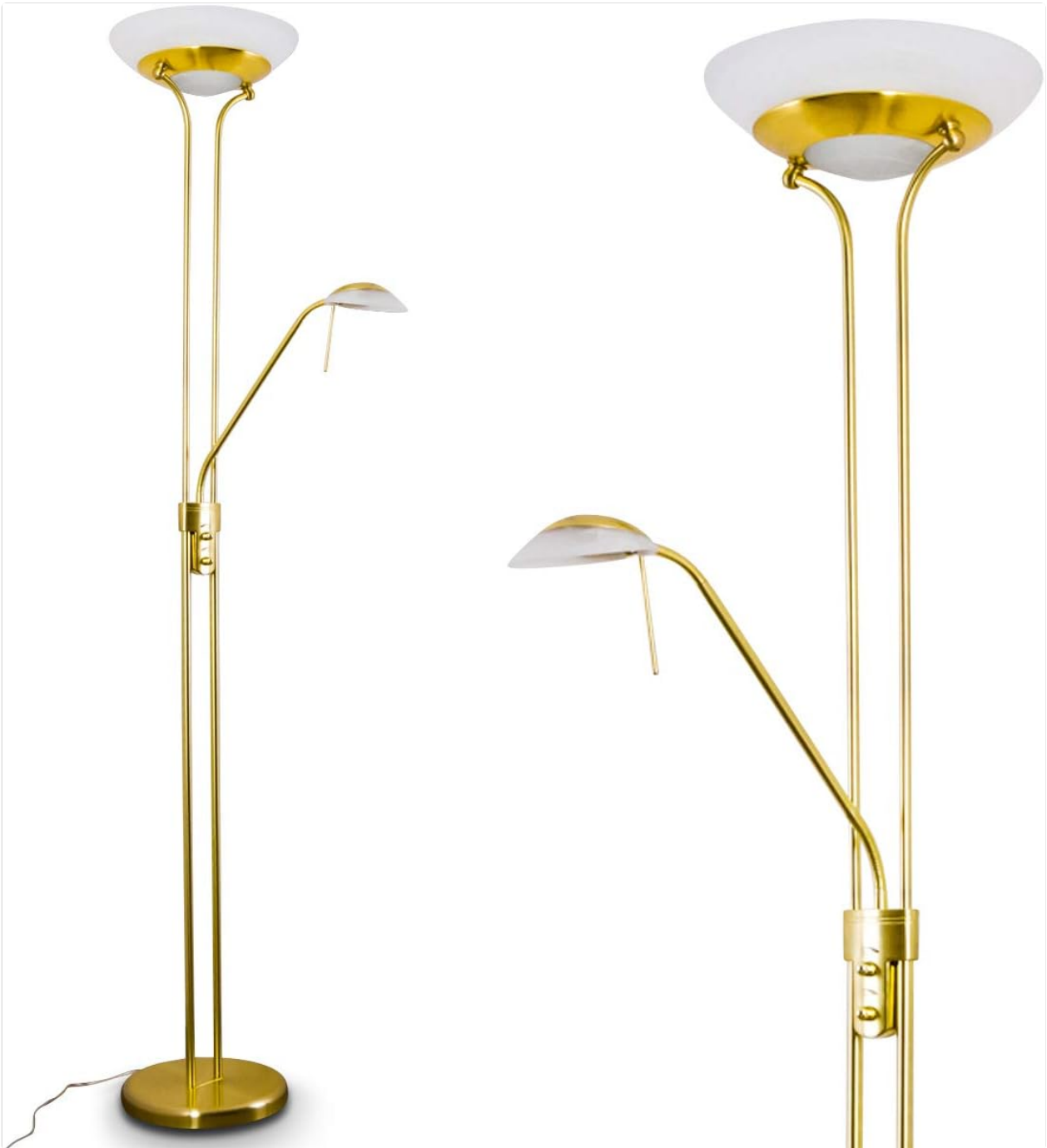
Figure 1: Fully assembled Hofstein Biot LED Floor Lamp. This image shows the overall design of the lamp, featuring a main upright and an adjustable reading light, both in a brass finish with white glass shades.