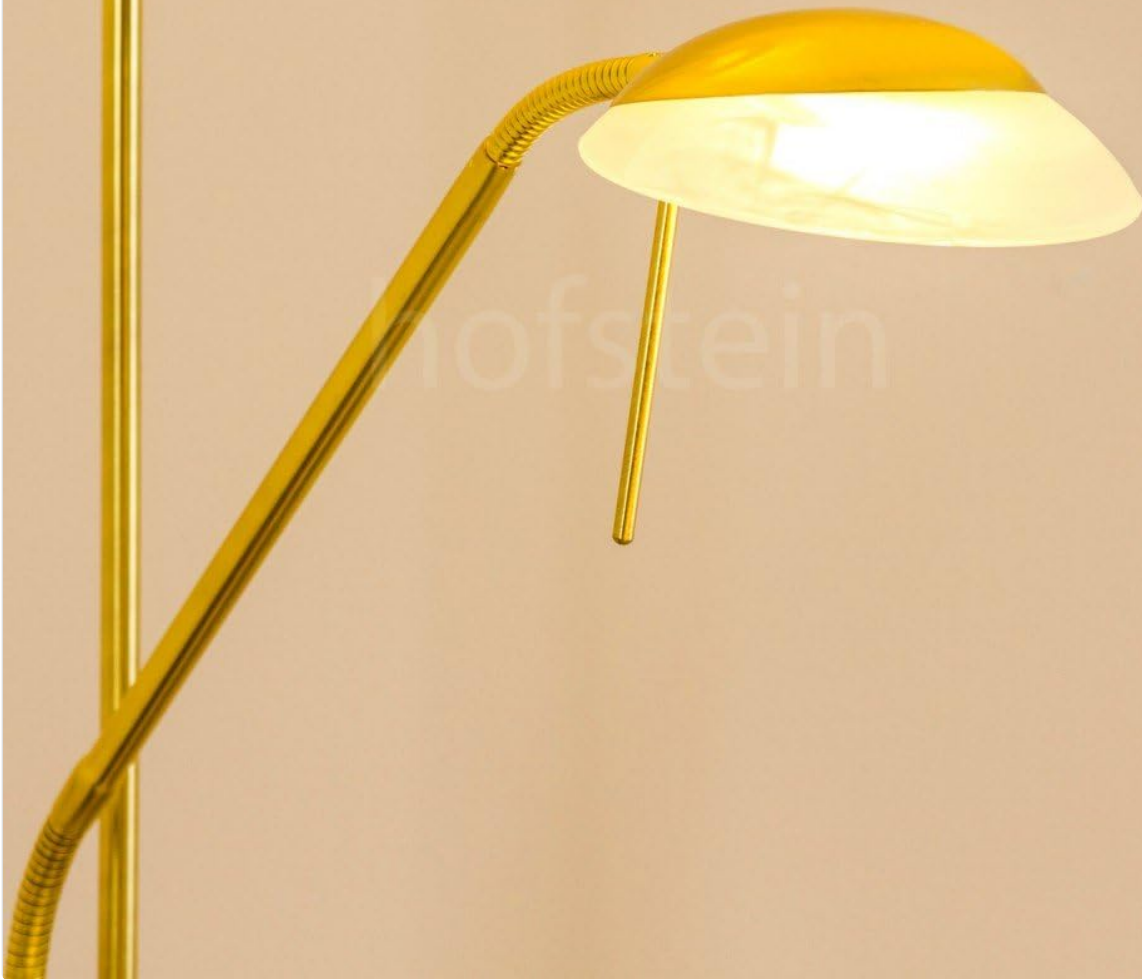
Figure 5: Close-up view of the adjustable reading light, highlighting its flexible arm and integrated LED light source.