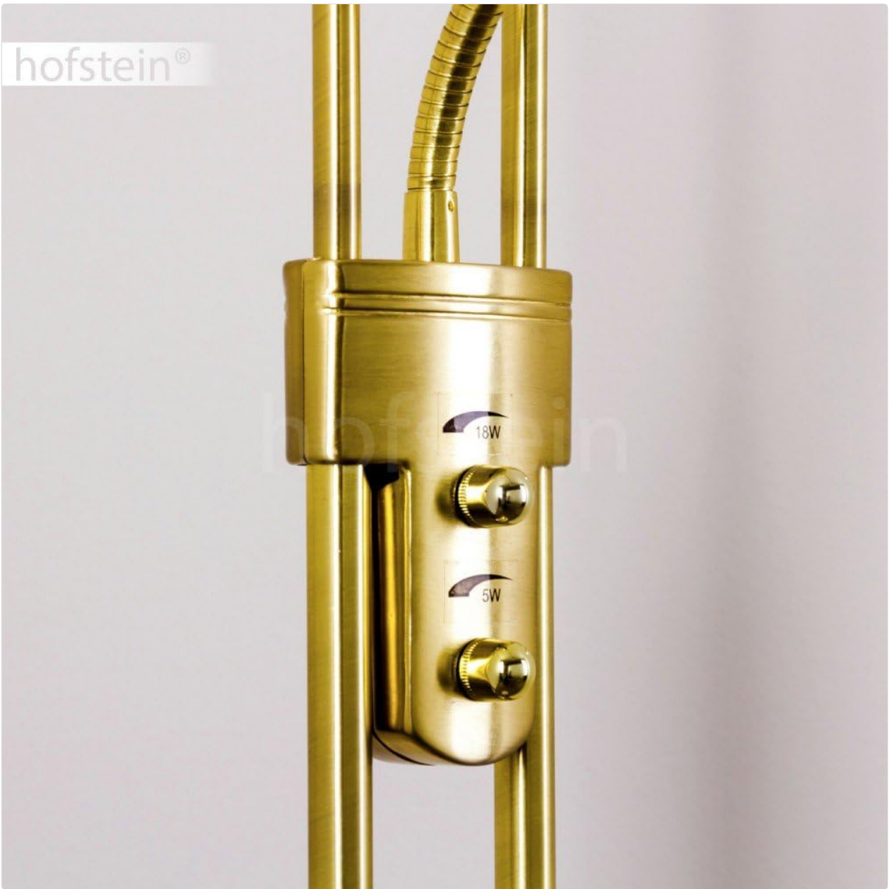
Figure 3: Close-up of the dimmer controls on the lamp pole. The upper knob controls the 18W main uplight, and the lower knob controls the 5W reading light, allowing independent brightness adjustment.