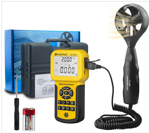
Image: The complete package including the main anemometer unit, separated wind sensor, hard carry case, 9V battery, and screwdriver.