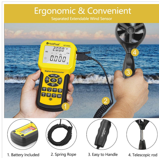
Image: Close-up of the anemometer's battery compartment, showing the 9V battery and connection points.