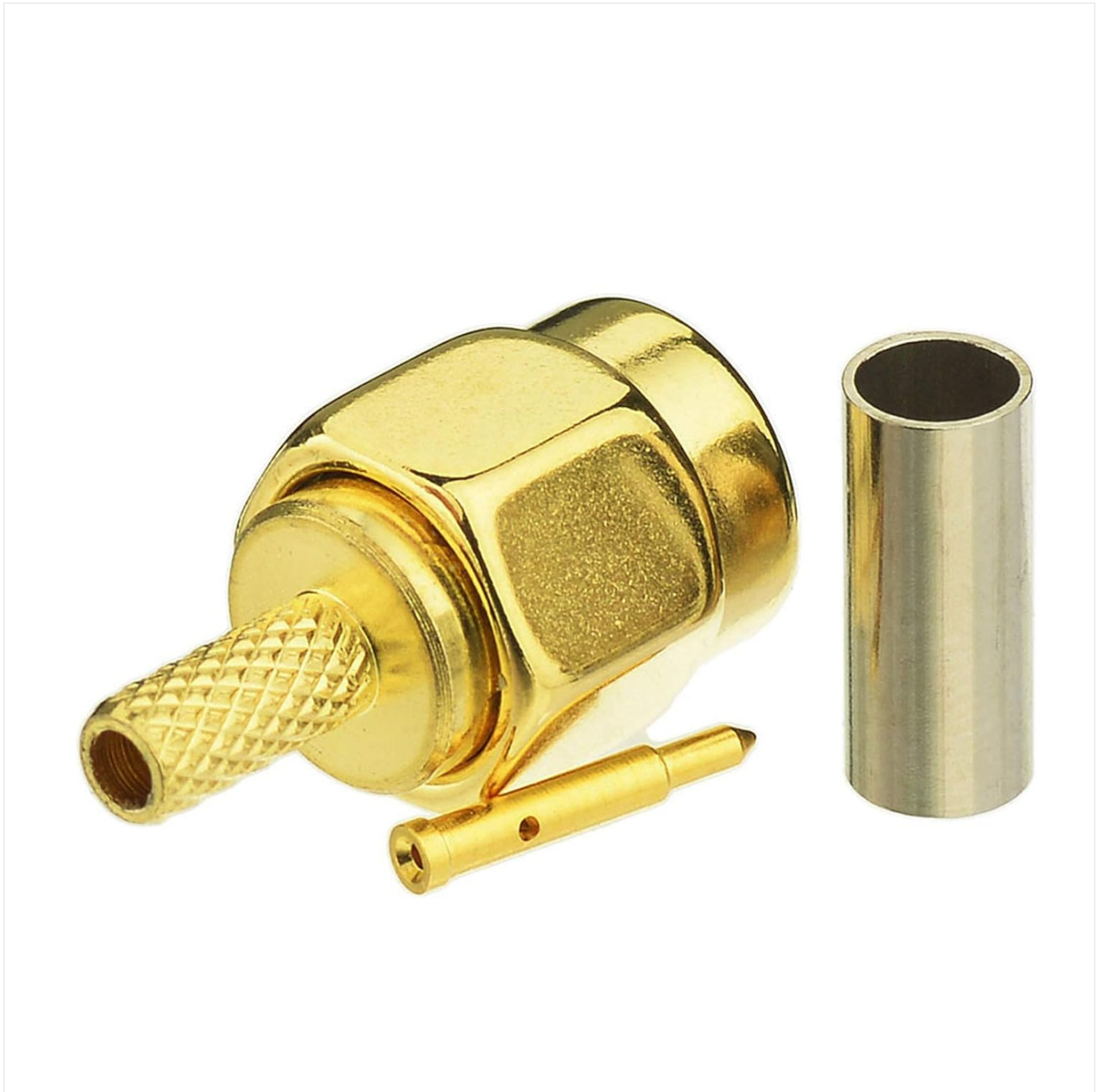
Image: Close-up view of the SMA Male Crimp RF Connector's inner pin and crimp tube, showing the components before assembly.