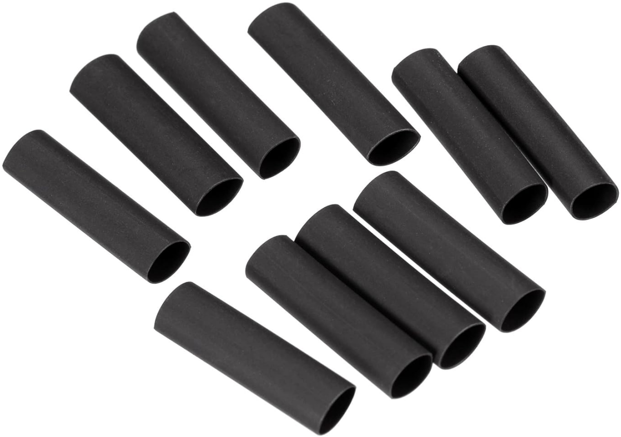
Image: A collection of black heat shrink tubes, used for insulating and protecting cable connections.