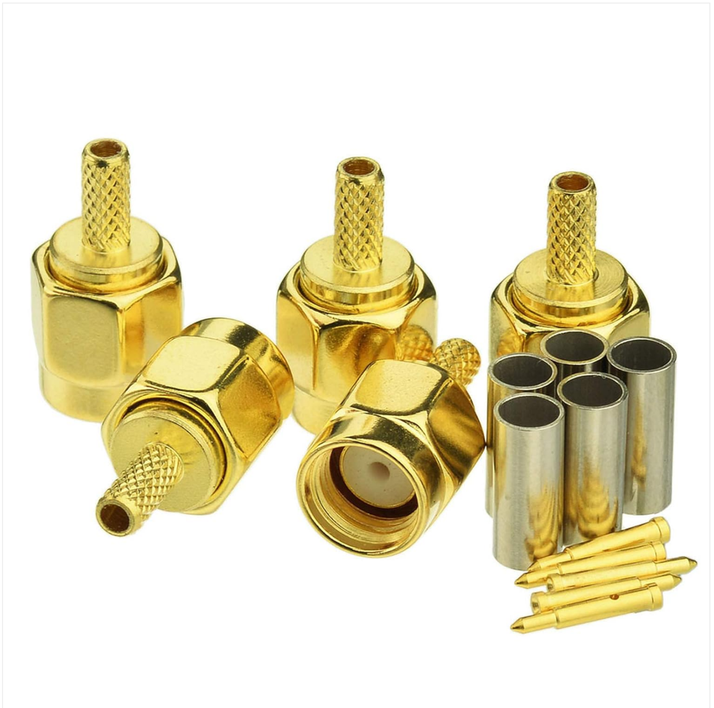
Image: A set of SMA Male Crimp RF Connectors, including the main connector body, inner pins, crimp tubes, and heat shrink tubes.