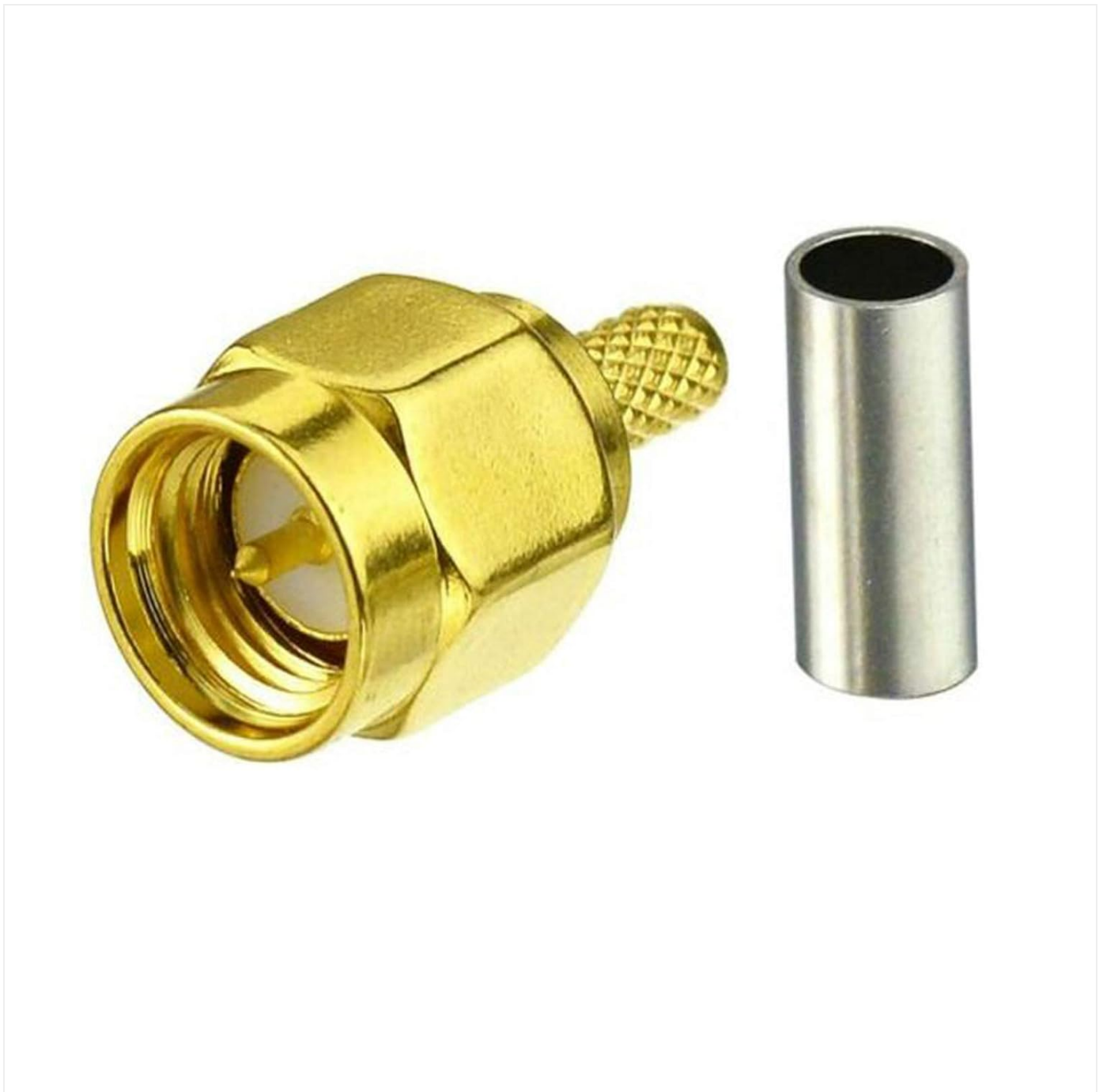
Image: Disassembled view of an Eightwood SMA Male Crimp RF Connector, showing the main body, inner pin, and crimp tube.