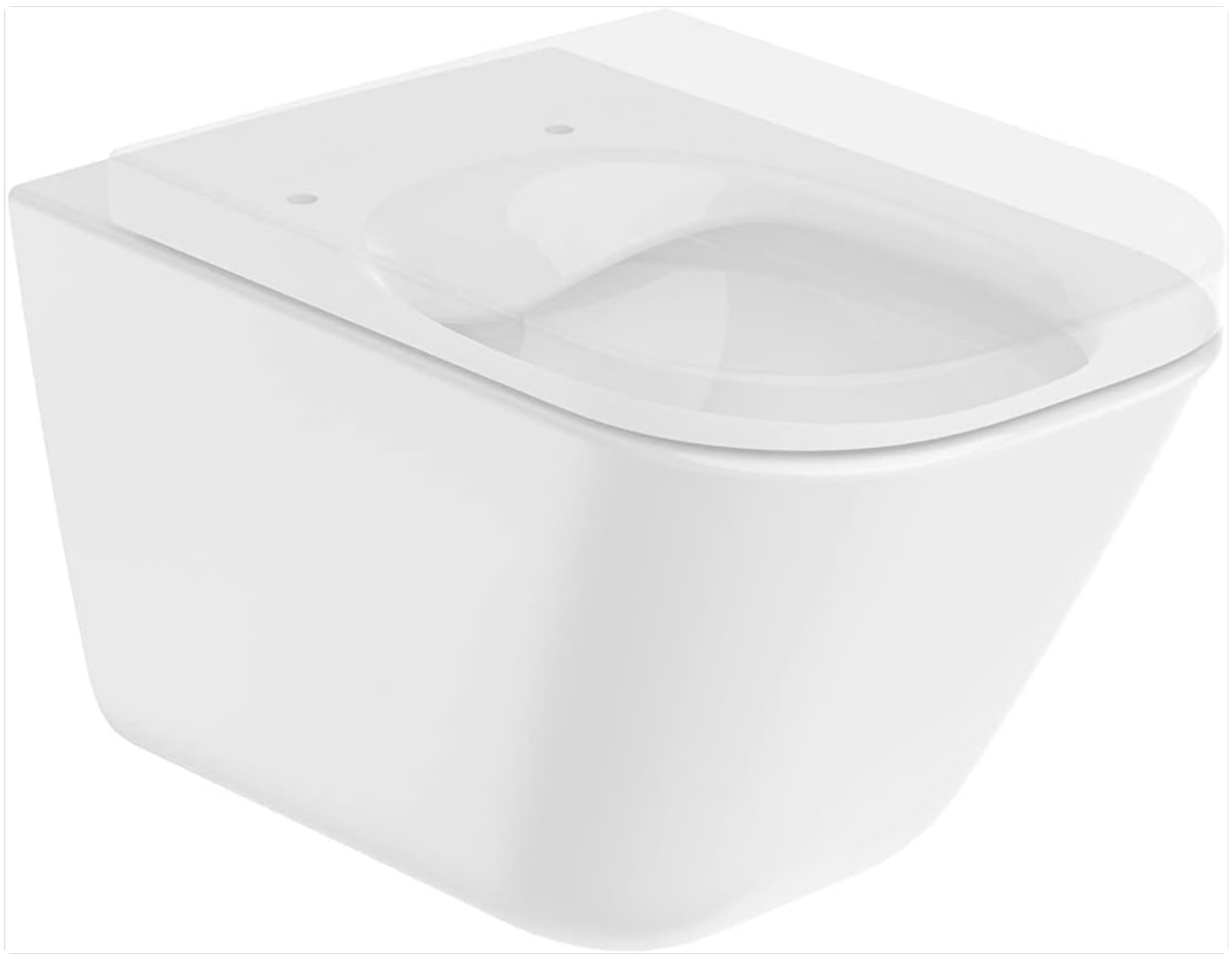
Figure 1: Roca Clean Rim SQUARE Wall-Hung Toilet Pan. This image shows the complete toilet pan from a front-side angle, highlighting its square shape and clean lines, typical of a modern wall-hung design.