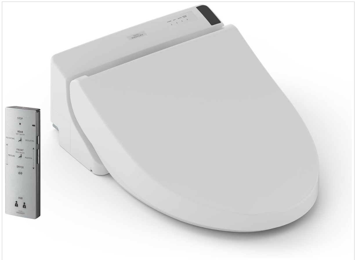
Image: TOTO WASHLET C200 Electronic Bidet Toilet Seat with its wireless remote control.