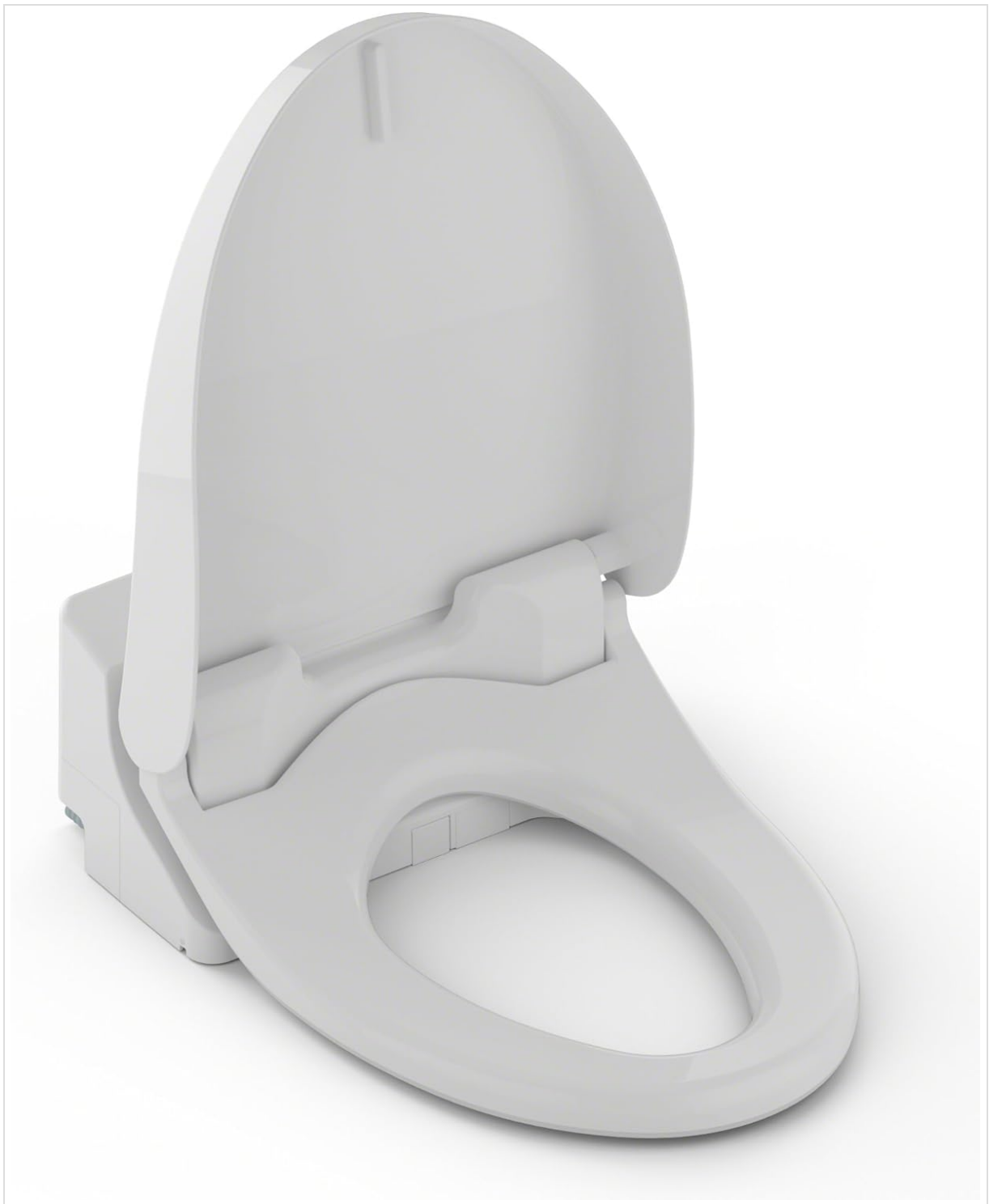
Image: TOTO WASHLET C200 Electronic Bidet Toilet Seat with the lid open, showing the internal components.