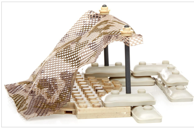
Image: Detailed view of the buildable desert outpost environment with fabric digi-camo tarp and sandbag fortifications.