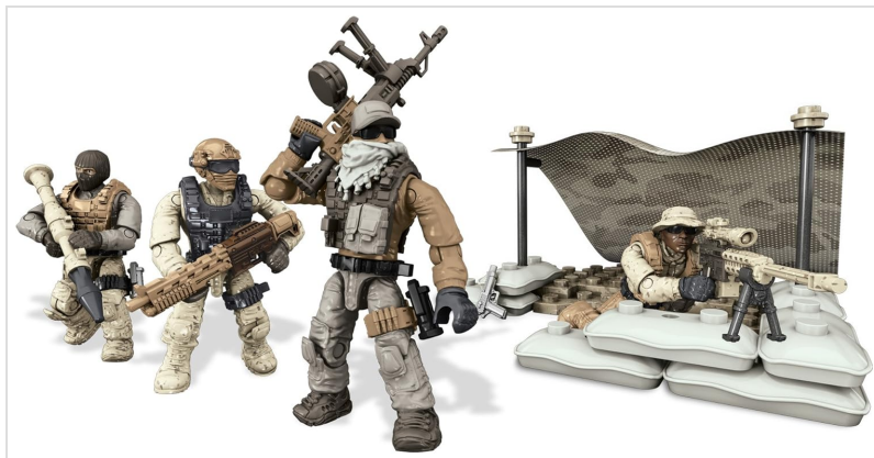
Image: The complete Mega Bloks Call of Duty Desert Squad set, showing all four figures deployed around the assembled desert outpost.