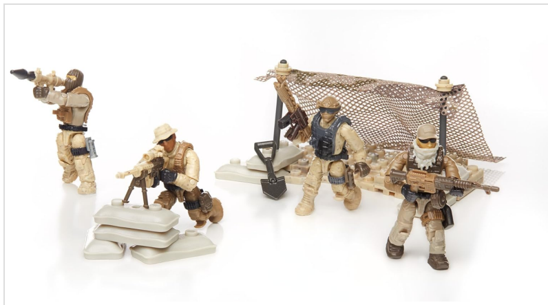
Image: Multiple desert trooper figures engaged in various action poses, demonstrating their articulation and the interactive elements of the set.