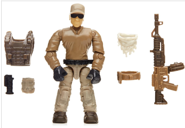
Image: A single desert trooper figure showcasing its detailed design, detachable armor, and weapon accessories.