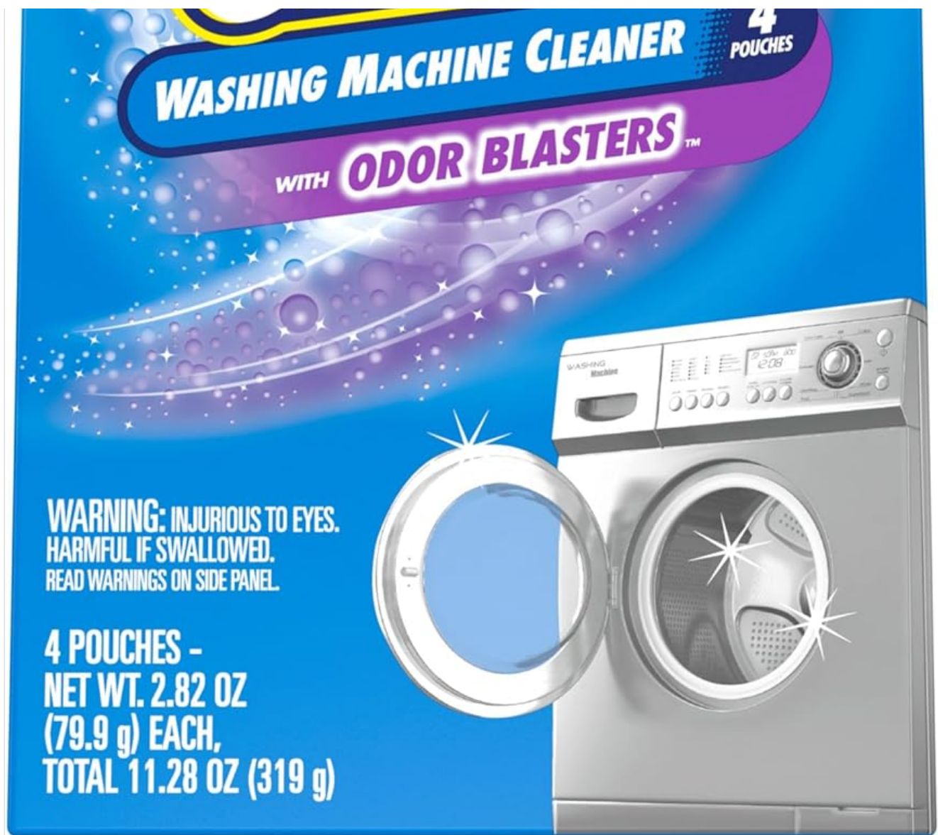
Image: OxiClean Washing Machine Cleaner with Odor Blasters product packaging.

The cleaner comes in pre-measured, easy-to-use pouches, suitable for both High-Efficiency (HE) and standard washing machines. Regular use helps prevent residue buildup and keeps your washing machine clean and fresh-smelling.