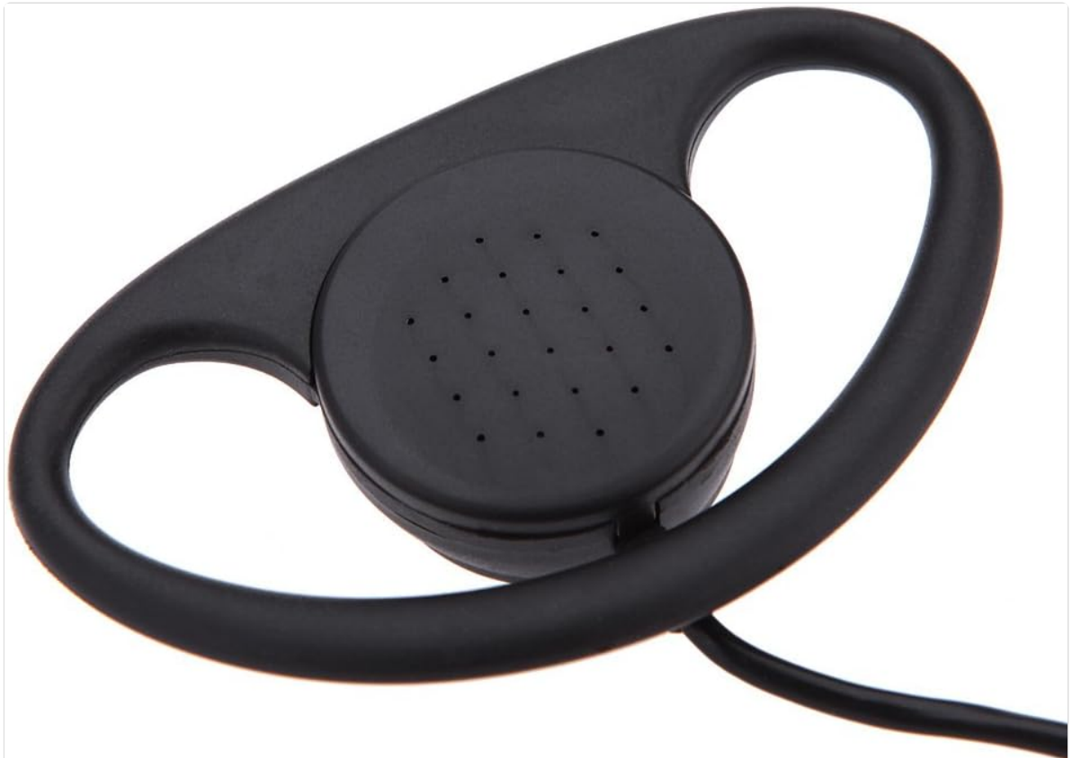
Figure 2: Close-up of the comfortable ear cushion and speaker grille.