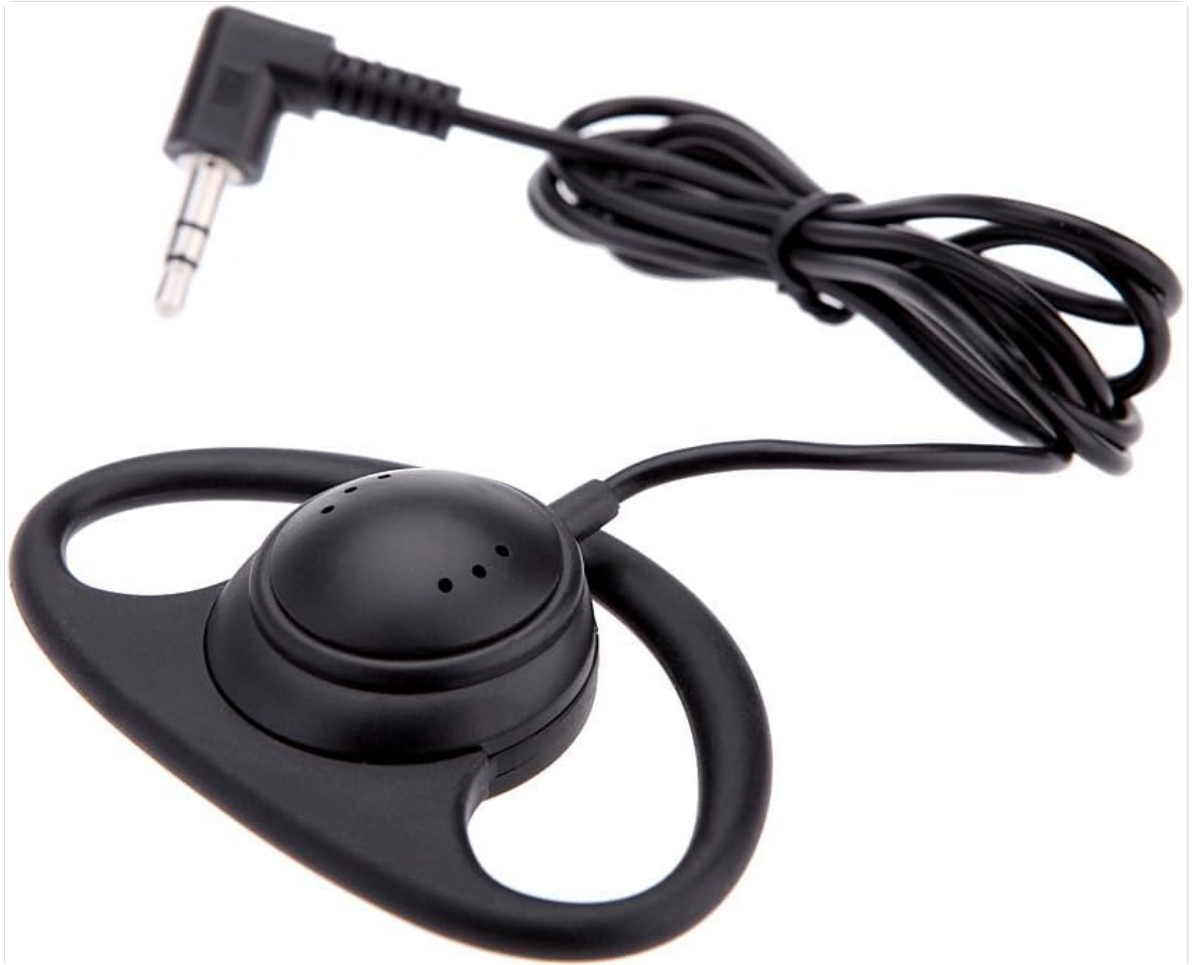
Figure 1: Overall view of the Andoer Single-Sided Headset Earphone.