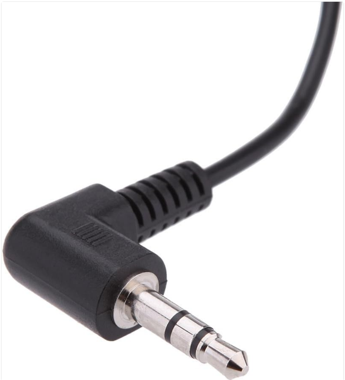
Figure 3: Detail of the 3.5mm audio jack for universal connectivity.