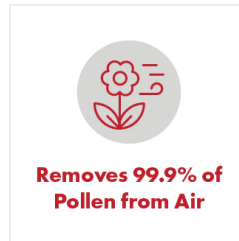
Figure 4: Icon representing HEPA filtration, essential for clean air.

The advanced HEPA filters are crucial for trapping allergens. Check and clean the HEPA filters regularly according to the instructions provided with the filter. Replace them as recommended to maintain filtration efficiency.