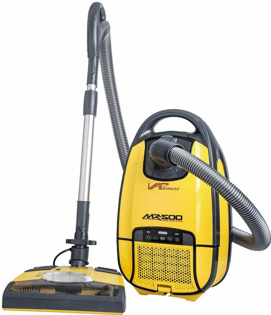
Figure 1: Vapamore MR-500 Vento Canister Vacuum with powerhead and hose.