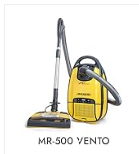
Figure 2: The Vapamore MR-500 Vento Canister Vacuum with its main powerhead.