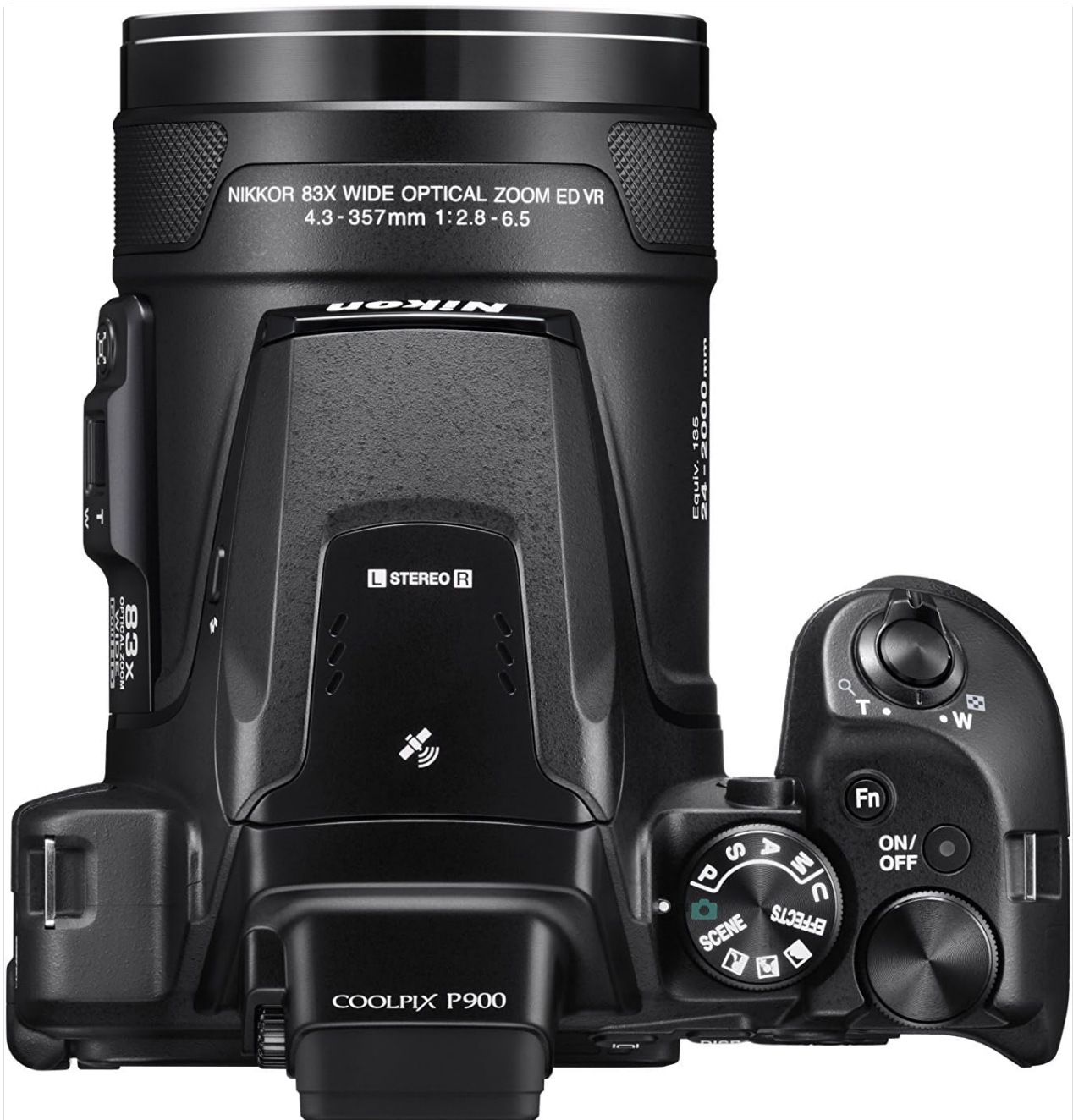
Top view of the Nikon Coolpix P900, highlighting the mode dial, zoom controls, and built-in microphone.