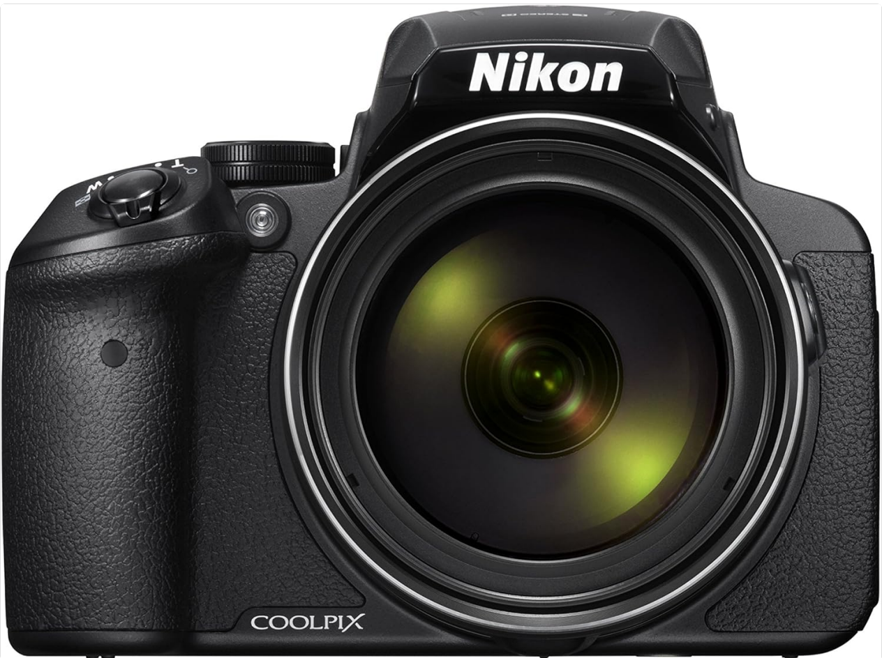
Front view of the Nikon Coolpix P900 camera, showcasing its large optical zoom lens.