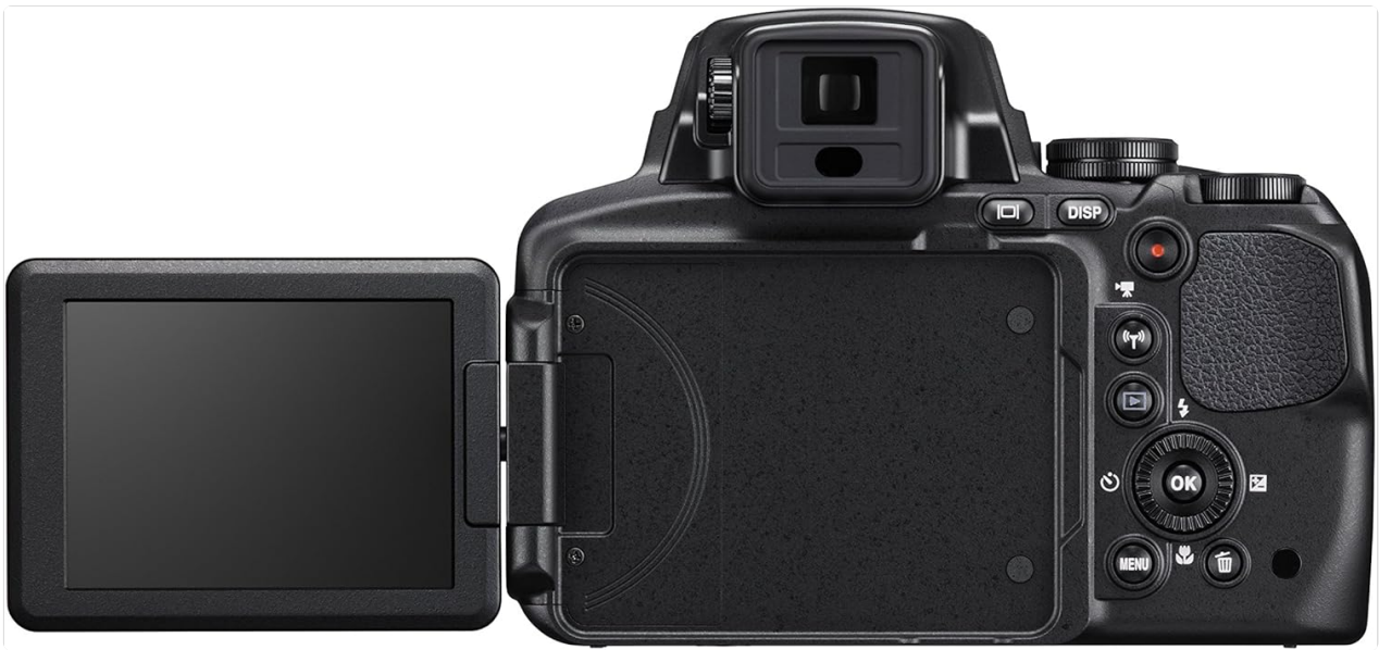
Rear view of the Nikon Coolpix P900 with its vari-angle display extended, showing the screen and control buttons.