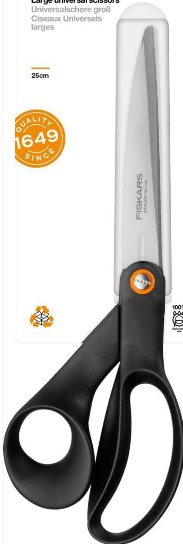
Image 2.1: Packaging of Fiskars Functional Form Universal Scissors, highlighting key features.