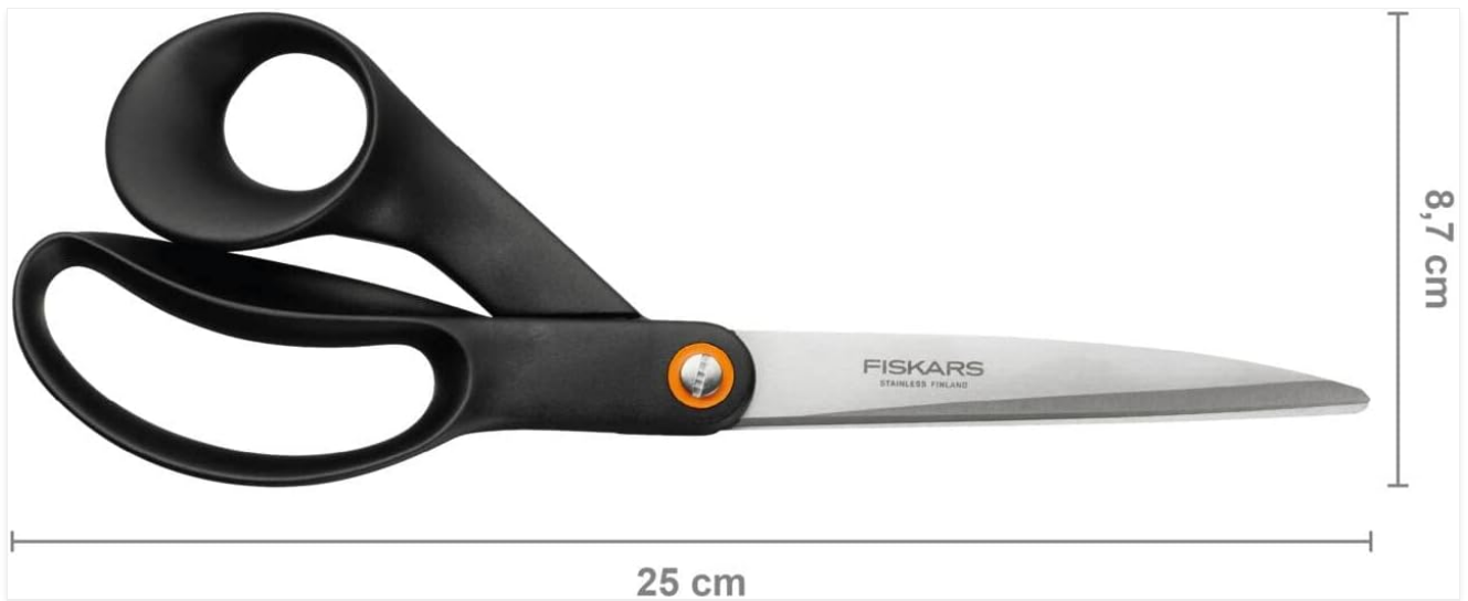
Image 7.1: Dimensional diagram of the scissors, showing total length and handle height.