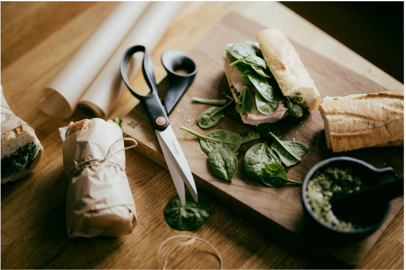
Image 4.2: Scissors in use for general household tasks, demonstrating versatility.