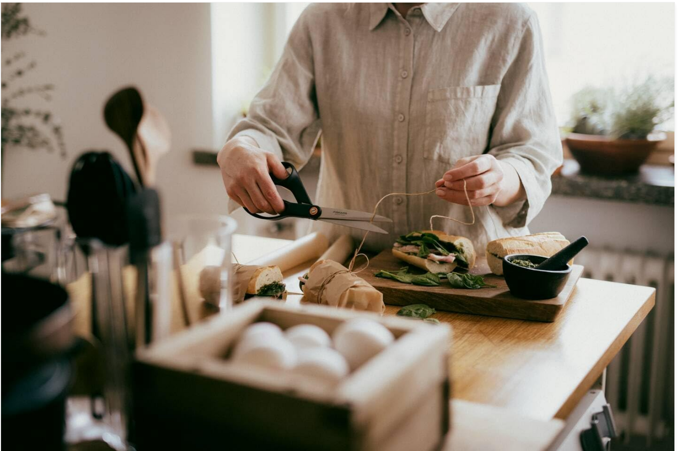
Image 4.3: A user demonstrating the comfortable grip while cutting.

Your browser does not support the video tag.