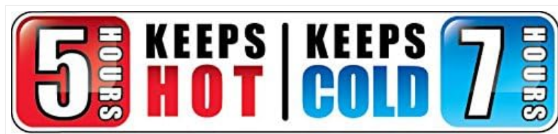
Image: Visual representation of the food jar's temperature retention capabilities: 5 hours for hot food and 7 hours for cold food.