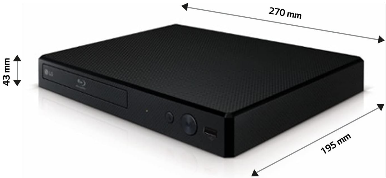
Image: The LG BP250 Blu-Ray player with an overlay indicating its compact dimensions: 270 mm width, 195 mm depth, and 43 mm height.