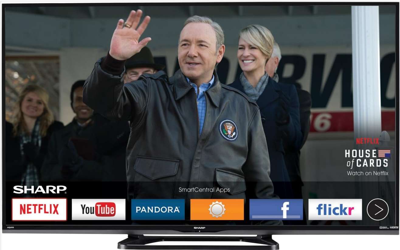
Figure 2.2.1: Smart Central Apps Interface. This image shows the TV screen with the Smart Central Apps overlay, featuring icons for Netflix, YouTube, Pandora, and other applications.

The Sharp LC-40LE653U features Smart Central Apps, providing access to various online services and a web browser. Ensure your TV is connected to the internet via Wi-Fi or Ethernet.