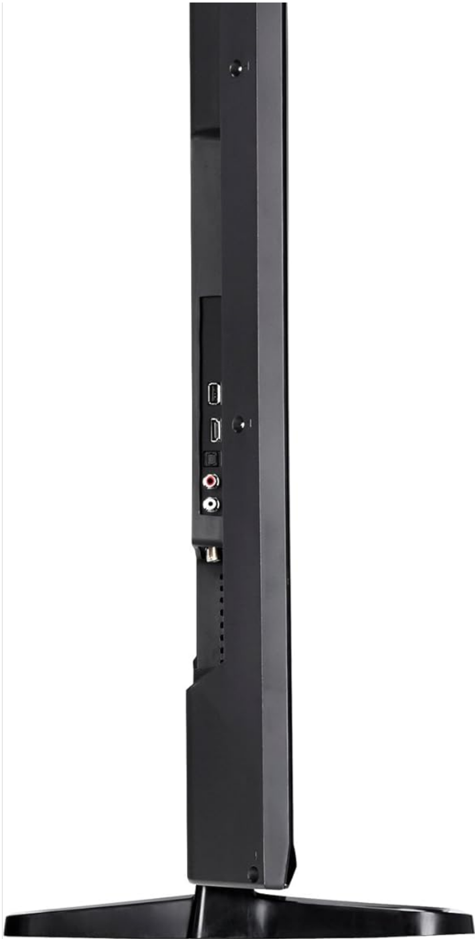
Figure 1.3.1: Side Panel Connections. This image displays the side profile of the TV, highlighting accessible ports such as USB and HDMI for convenient connection of devices.