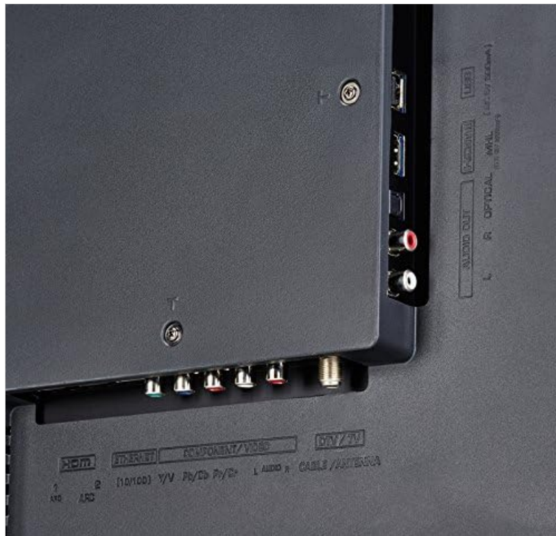
Figure 1.3.2: Rear Panel Connections. A detailed view of the rear input panel, showing HDMI, Ethernet, Component/Video, and DTV/TV (Antenna) ports. This is where most permanent connections are made.