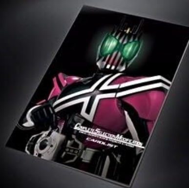
Image: Overview of the complete set contents, including the 77 Rider Cards, two 4-pocket binders, and the instruction booklet.