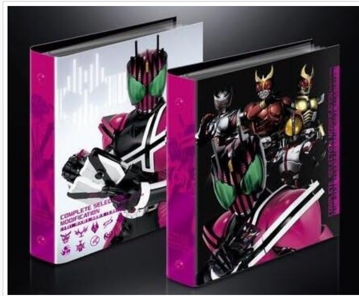
Image: The two 4-pocket binders, featuring artwork related to Kamen Rider Decade, used for card storage.